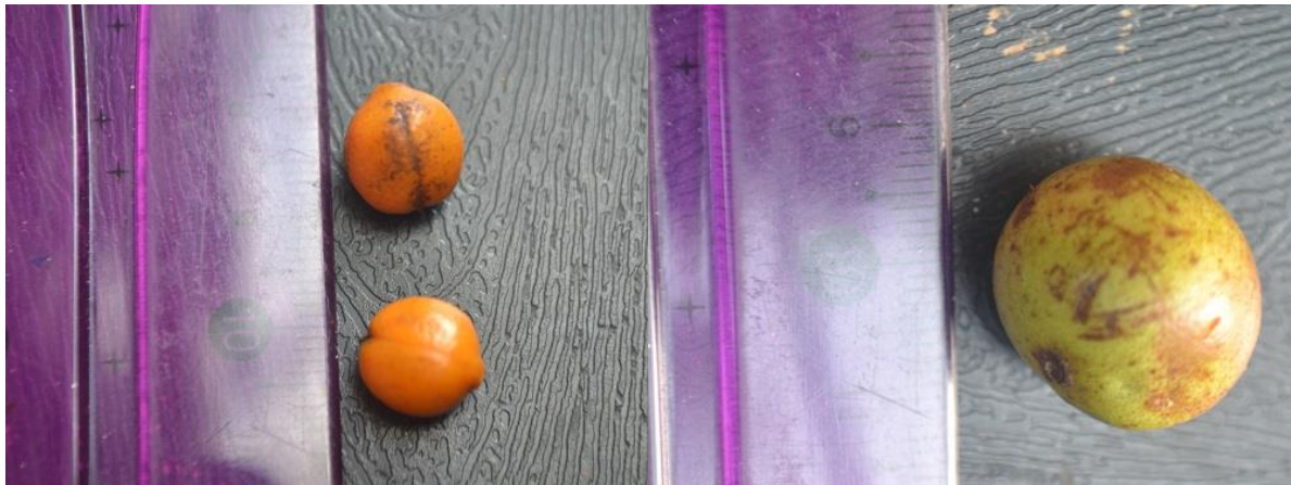
Left: Hazombary. Right: Rom-pandolotra. Below: Ramy.

It is late comparing the date planned in the research proposal because most of plants in this forest started fruiting in October. I work with three local guides in order to maximise data collection. Thus, until now we did tree observation of four species (vernacular name: Ramy, Hazombary, Rom-pandolotra and Fandramanana) with 21 trees. Four frugivore species were detected dispersing seed, which are Microcebus rufus (mouse lemur), Zosterops maderaspatanus (Madagascar white-eye), Alectroenas madagascariensis (Madagascar blue-pigeon) and Hypsipetes madagascariensis (Madagascar black bulbul).