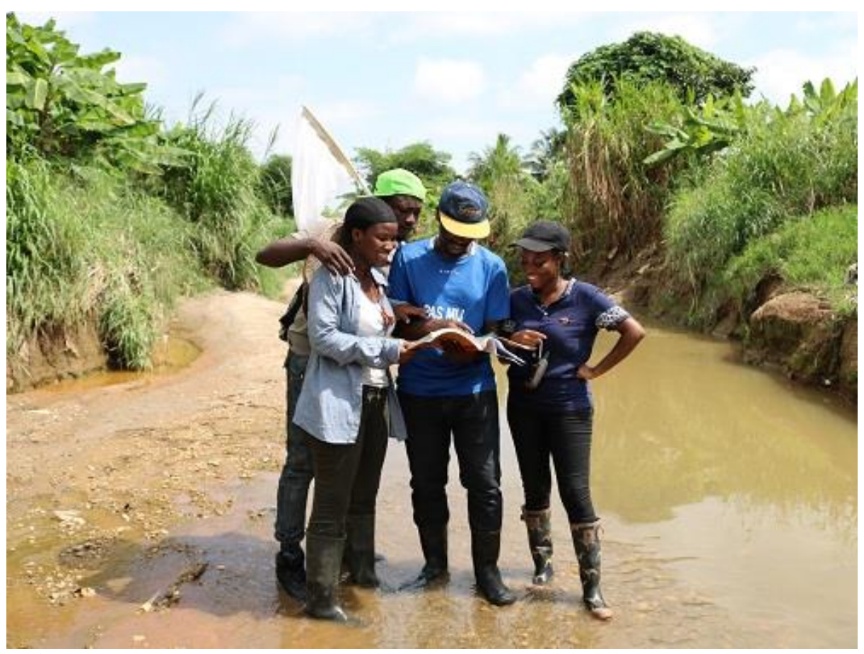
Project team members

The survey was done in both the wet and dry season. The wet season sampling occurred from June to October 2018, while the dry season sampling was done from December 2018 to February 2019. We have recorded a total of 38 Odonata species along the Birim River and 43 species in the Offin River and their tributaries. Some notable and rare species are the Elattoneura villieri , Heliaechna fuliginosa and Sapho bicolor . We have currently initiated our community education and awareness creation campaigns in selected communities fringing these two rivers.