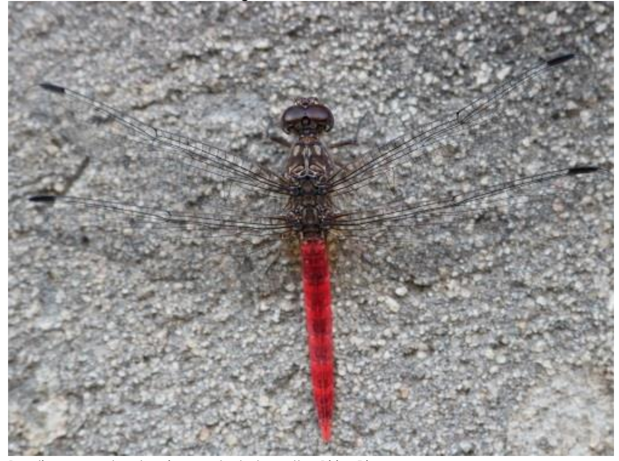
Bradinopyga strachani recorded along the Birim River.