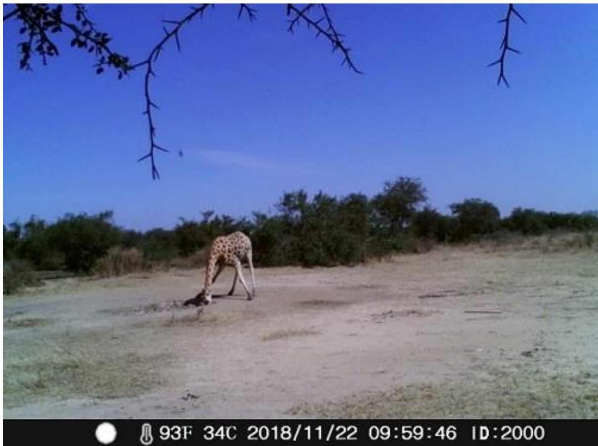
Bending to eat minerals from the soil in Tinga area of Zakouma.

I have also gathered a lot of other giraffe footage and photos using the camera traps at strategic positions throughout Zakouma NP and have been able to get ID photos from screen grabs too, so a really important aspect of the project is being helped with the cameras!