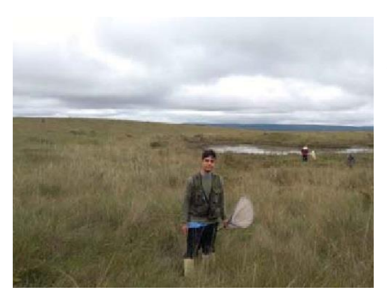
Figure 1 - Legend: Collecting dragonflies in the National Park of Serra da Canastra. This photo is mine. I allow its publication on Rufford's website.

Other: <a href="https://www.instagram.com/libelulas_da_serra_da_canastra">https://www.instagram.com/libelulas_da_serra_da_canastra</a>