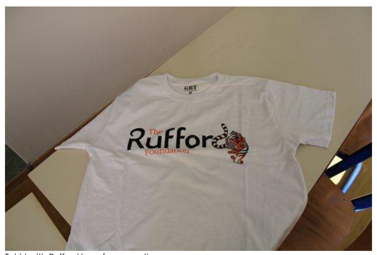
T shirt with Rufford logo for promotion.