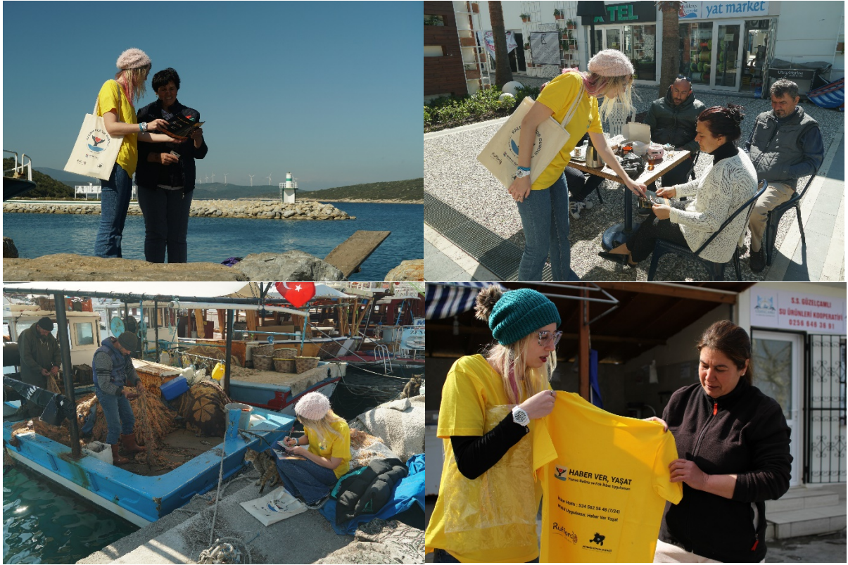
© Amin HERODIAN & Cansu KABAKÇI