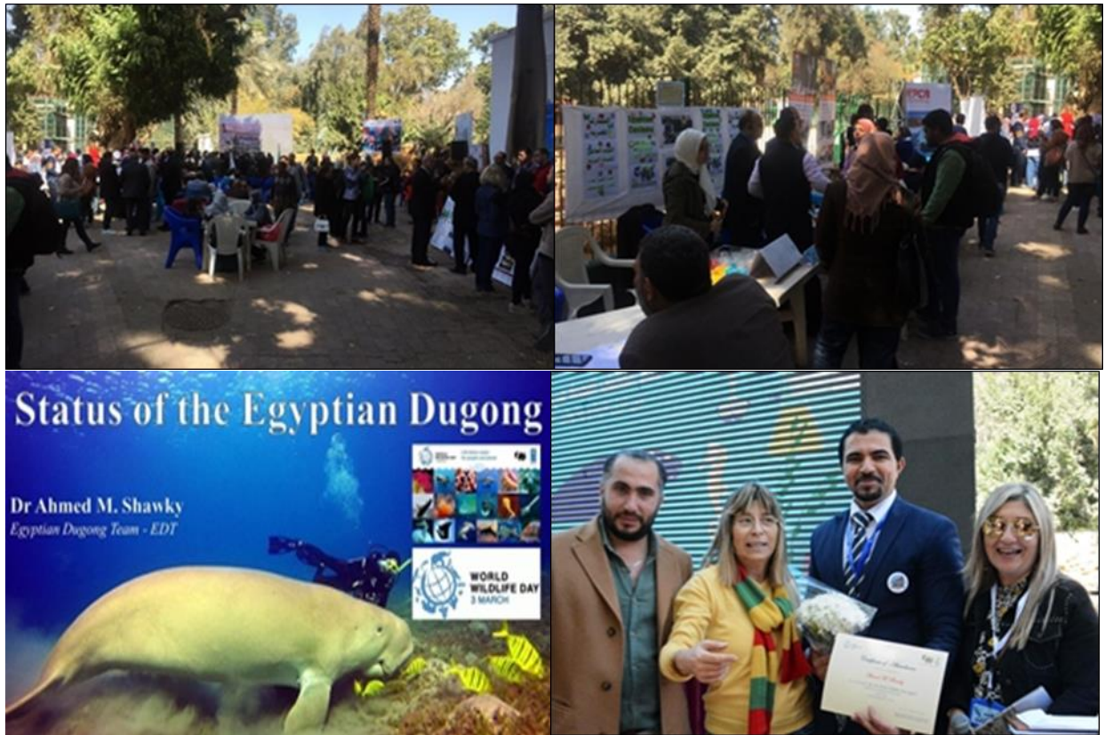
The celebration of World Wildlife Day, EGYPT 2019.