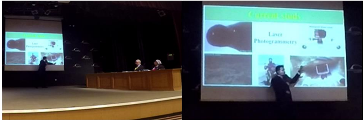
Presenting the project activity of laser photogrammetry in the conference "Coast to Ocean", Bibliotheca Alexandria.