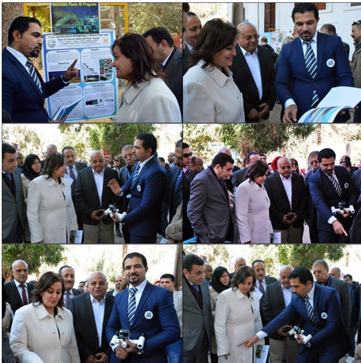
Introducing a briefing of using laser photogrammetry on dugongs to Dr Mona Mehrez - deputy Minister of Agriculture.