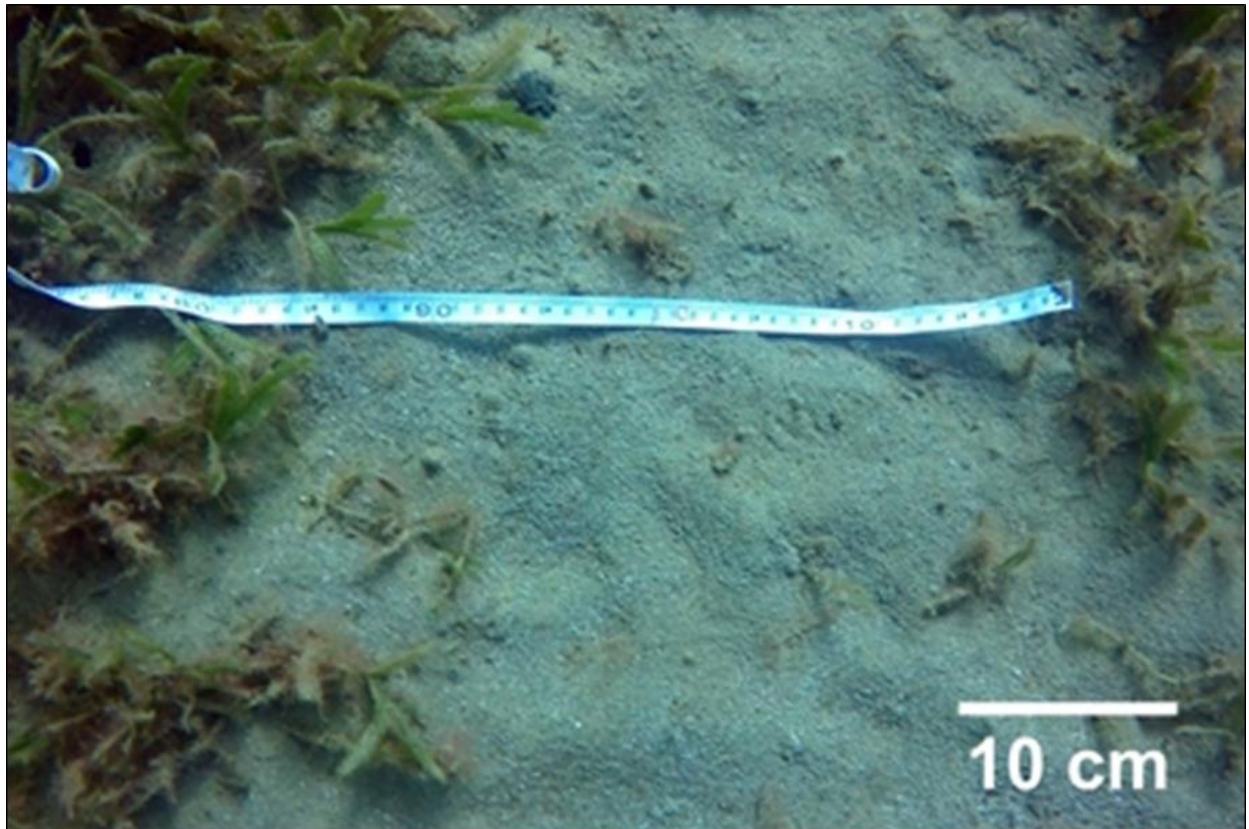
Photos show the first record of the feeding trail of 30cm wide in Marsa Alam.