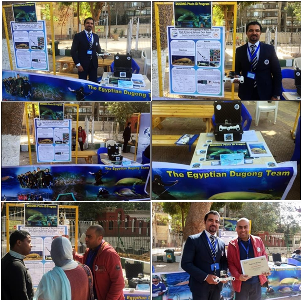
Egyptian Dugong Team booth during the participation in the World Wildlife Day, EGYPT 2019.