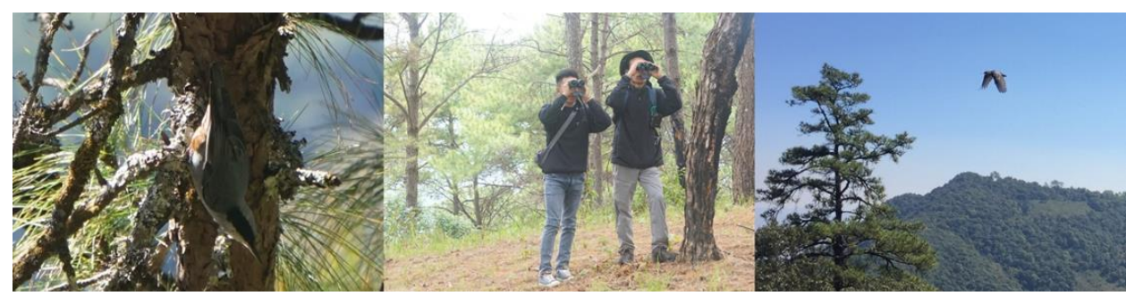
Giant Nuthatch is walking on a pine branch(left), Survey team is looking for Giant Nuthatch in forest(middle), and Giant Nuthatch is flying in its habitat(right).