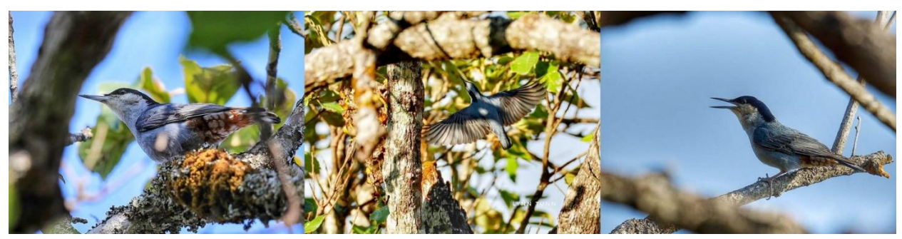
Giant Nuthatches in Mount Ashae Myim Anauk Myim area