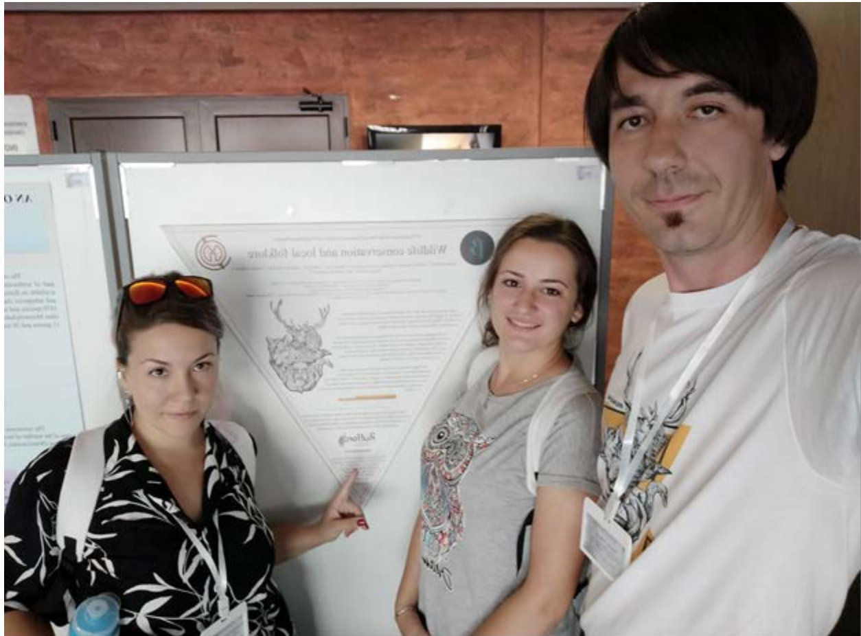
13 th Symposium on the Flora of Southeastern Serbia and Neighboring Regions, Stara planina Mt., 2019.

http://www.sfses.com/docs/Book-of-Abstracts.pdf (page 101)