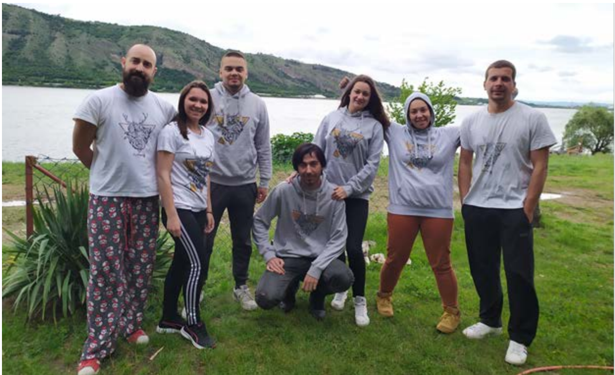
Project team members – arrival to the National Park Đerdap

This years' field activities started on schedule, at the beginning of May. Our project team, together with master students, bachelor students and volunteers collected the population parameters at four research localities in East and South Serbia during the months of May and July. At the Kunovica research locality we were accompanied by the students of the Faculty of Science and Mathematics, University of Niš, undertaking the course "Conservation biology", as well as members of the Biological Society "Dr. Sava Petrović" (BDDSP). A total of 29 bachelor and 10 master students took part in the field work in the month of May, followed by 19 volunteers (members of BDDSP). At the Kunovica research locality monitoring of Hermanns' tortoise has been established ever since 2009 representing one of the longest conservation monitoring programs in our country and being a part of large research cofounded by the Ministry of Education, Science and Technological Development of Serbia. At the other three research localities monitoring program has been established in 2016 through my first Rufford Small Grant (18761-1) and we aim to achieve the same, and even longer tradition of monitoring in those additional areas, thus ensuring the survival and conservation of Hermanns' tortoise in the entire country.