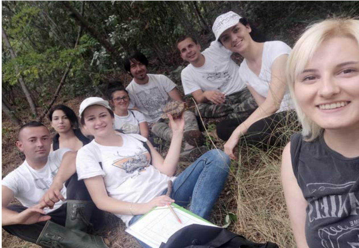
Mater students at Kunovica research locality – field activities in July