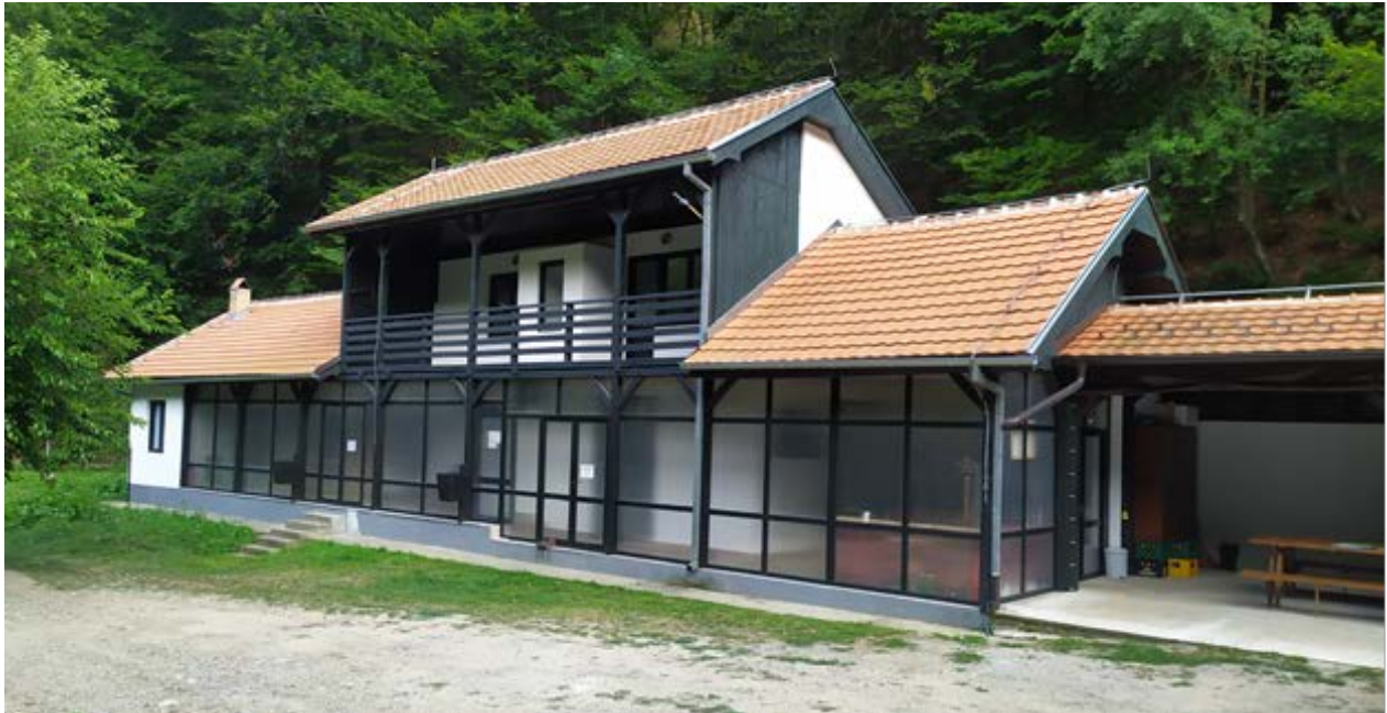
NP Đerdap Visitor center – our accommodation

Considering that this is the 4th year of our field activities, we established a successful collaboration with the managers of the “Đerdap” National Park protected area, at the territory of which is one of our selected research localities in eastern Serbia. This year, our research was cofounded by the protected area managers in the form of accommodation for our entire team of researchers. Our project team was located in one of the visitor centers managed by the Djerdap National Park.