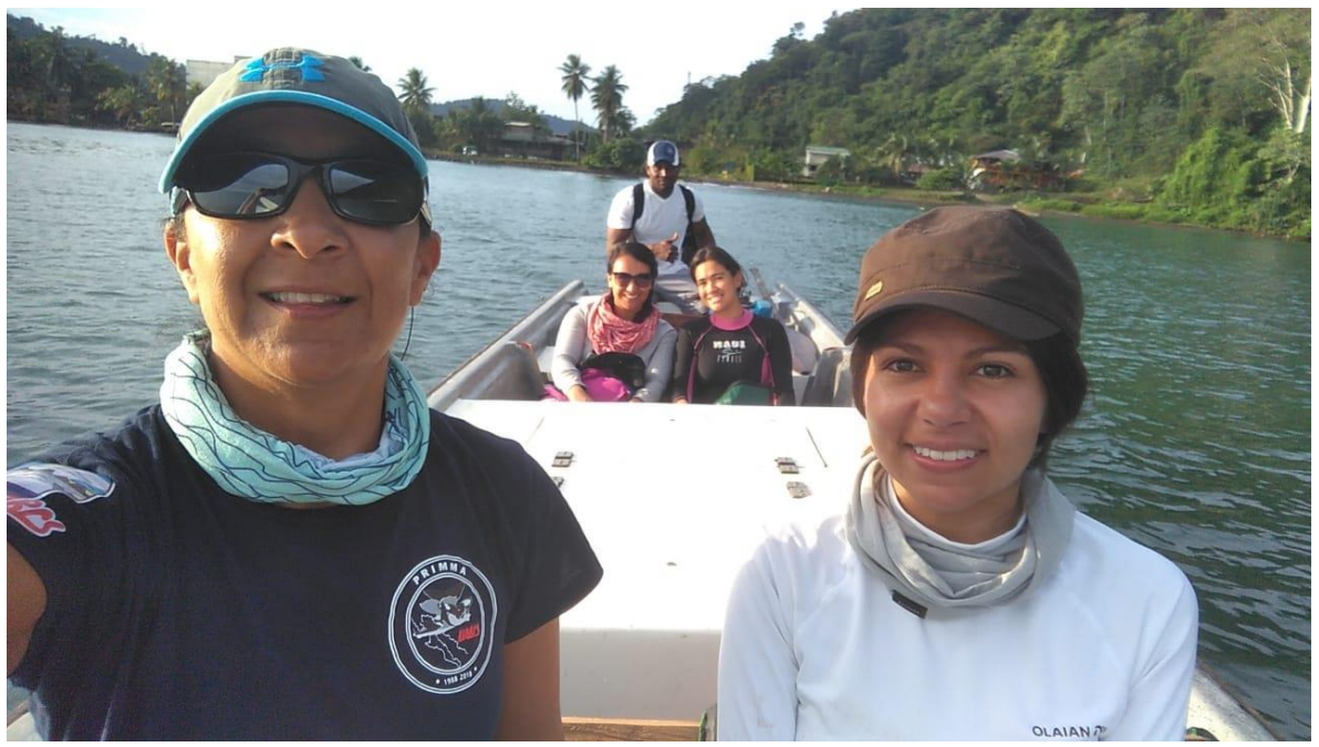
Fieldwork team.