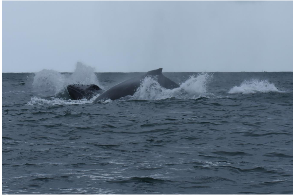
Competition group in Bahía Málaga.