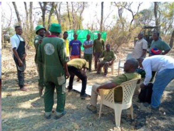
Left: A focus group discussion with a group of beekeepers who are permitted to conduct beekeeping activities in Ugalla Game Reserve. Right: A focus group discussion with trophy hunting staff at a trophy hunting camp in Ugalla Game Reserve.