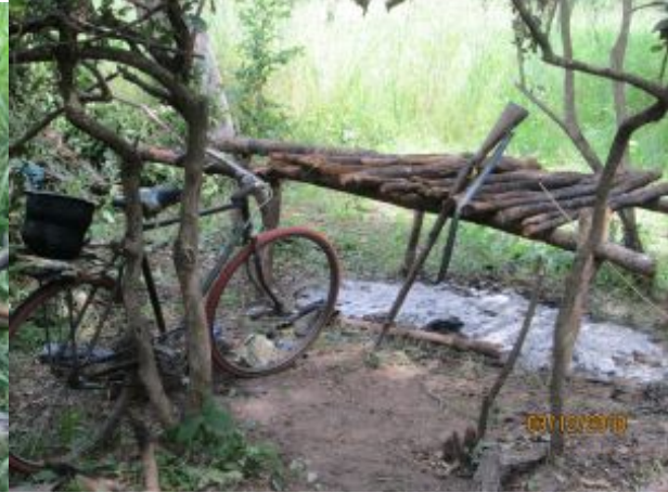
Left: Warthog meat abandoned by poachers fleeing from patrollers in Ugalla Game Reserve. Right: A bushmeat hunters' camp encountered by patrollers in Ugalla Game Reserve.