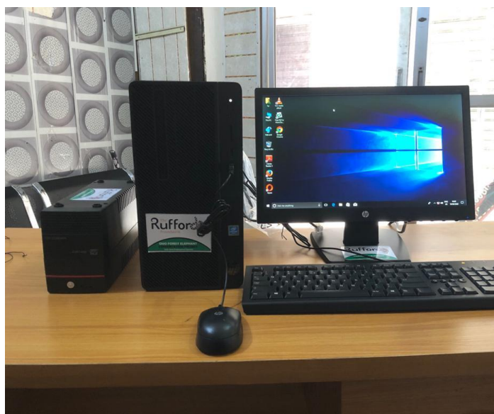
Desktop computer system for a central-based system to collate field data on patrols and biomonitoring