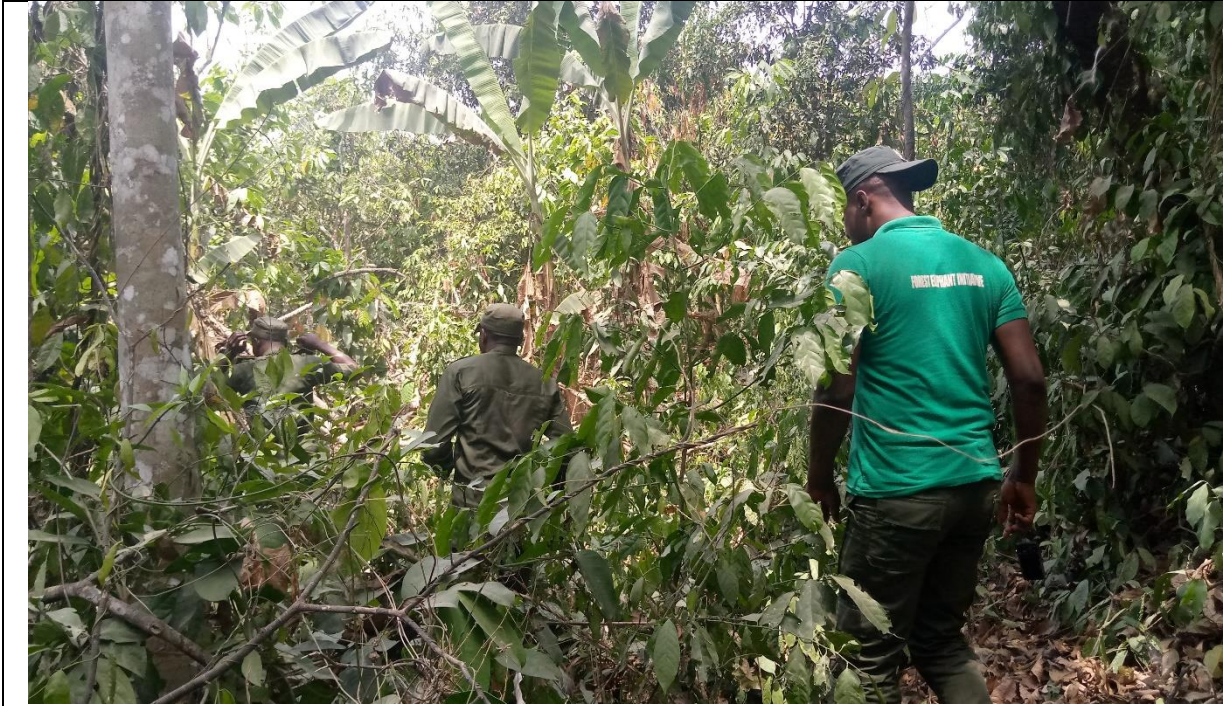
Elephant trail within project area