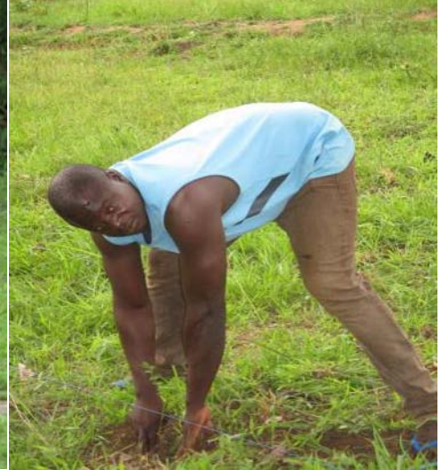
Left: Tree planting exercise at Kulmasa. Right: One of the sub-chiefs planting tree at Menji.