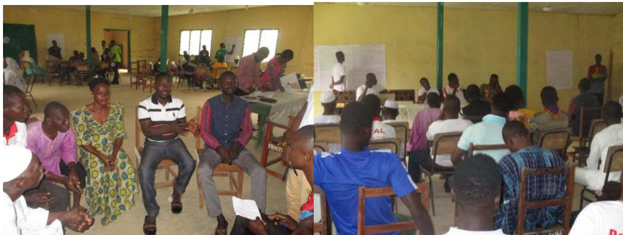
Left: Picture taken during Menji by-law amendment; participants were divided into groups to solicit for their views. Right: Picture taken during Menji by-law amendment where each group presented their suggestions to the entire participants for comments and inputs

From February to April 2020 community members were supported to plant 5000 seedlings including mahogany and shea butter tree (2500 each at Menji and Kulmasa).