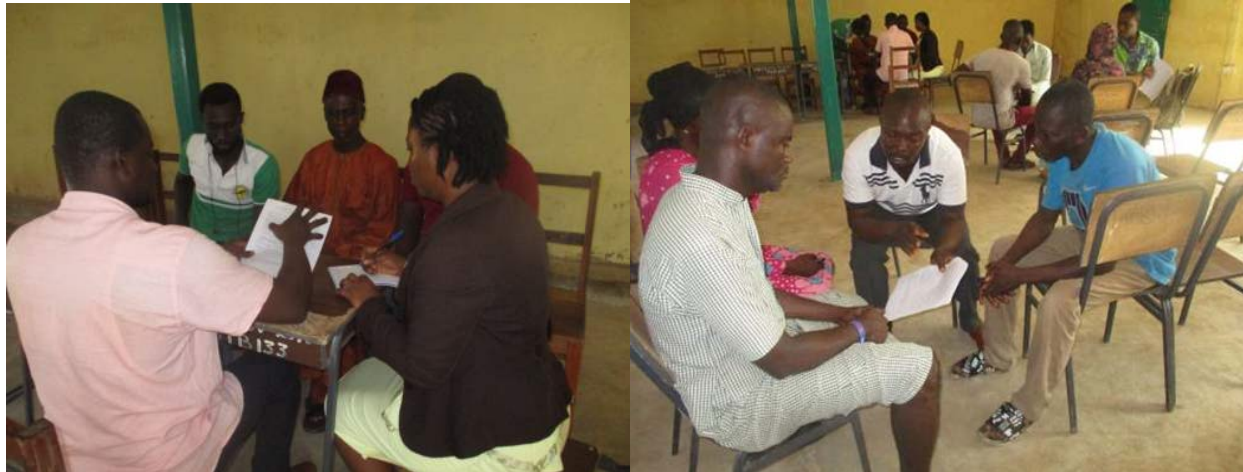
Left: Picture taken during review of Menji by-la. Right: Picture taken during review of Menji by-law, participants were divided into groups to gather their views.

A copy of the final draft has been sent to the Tain District Assembly for amalgamation into the District Assembly by-laws on forest and wildlife conservation at district level. Copies have been distributed in the community and are also discussed at the information centres to create general awareness. This has immensely reduced illegal activities which has created conducive environment for the increase of crocodile at Menji crocodile pond.