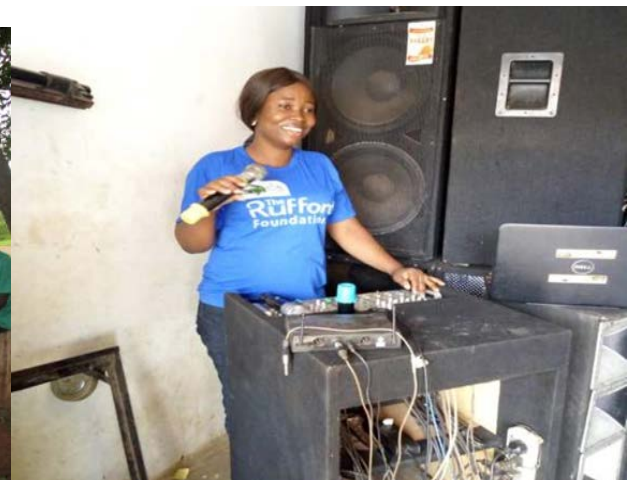
Left: Picture taken during community education at Menji. Right: Picture taken during education on Menji Information centre.

Since 2018, through the initiative of this project, Menji and Kulmasa communities are able to use local calls to bring crocodile from the water to the riverbank for sight-seeing which is currently gaining tourist attraction. This is a link ( https://youtu.be/a03szwXPvXE ) for a video during the call of crocodile at Kulmasa community.