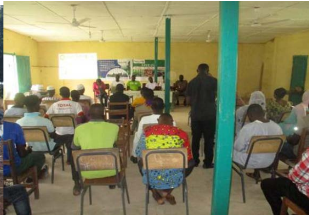
Left: Picture taken during community sensitization and education at Kulmasa. Right: Picture taken during community education at Maluwe.