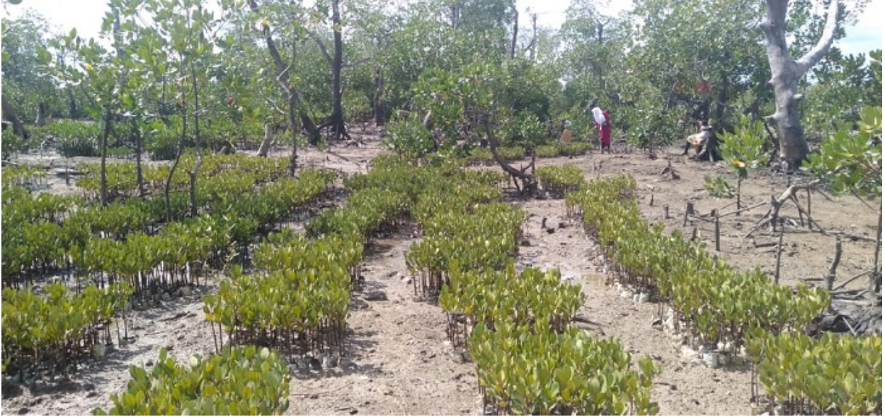
Progress on growth of expounded mangrove nursey after uplift of partial lockdown in August 2020.