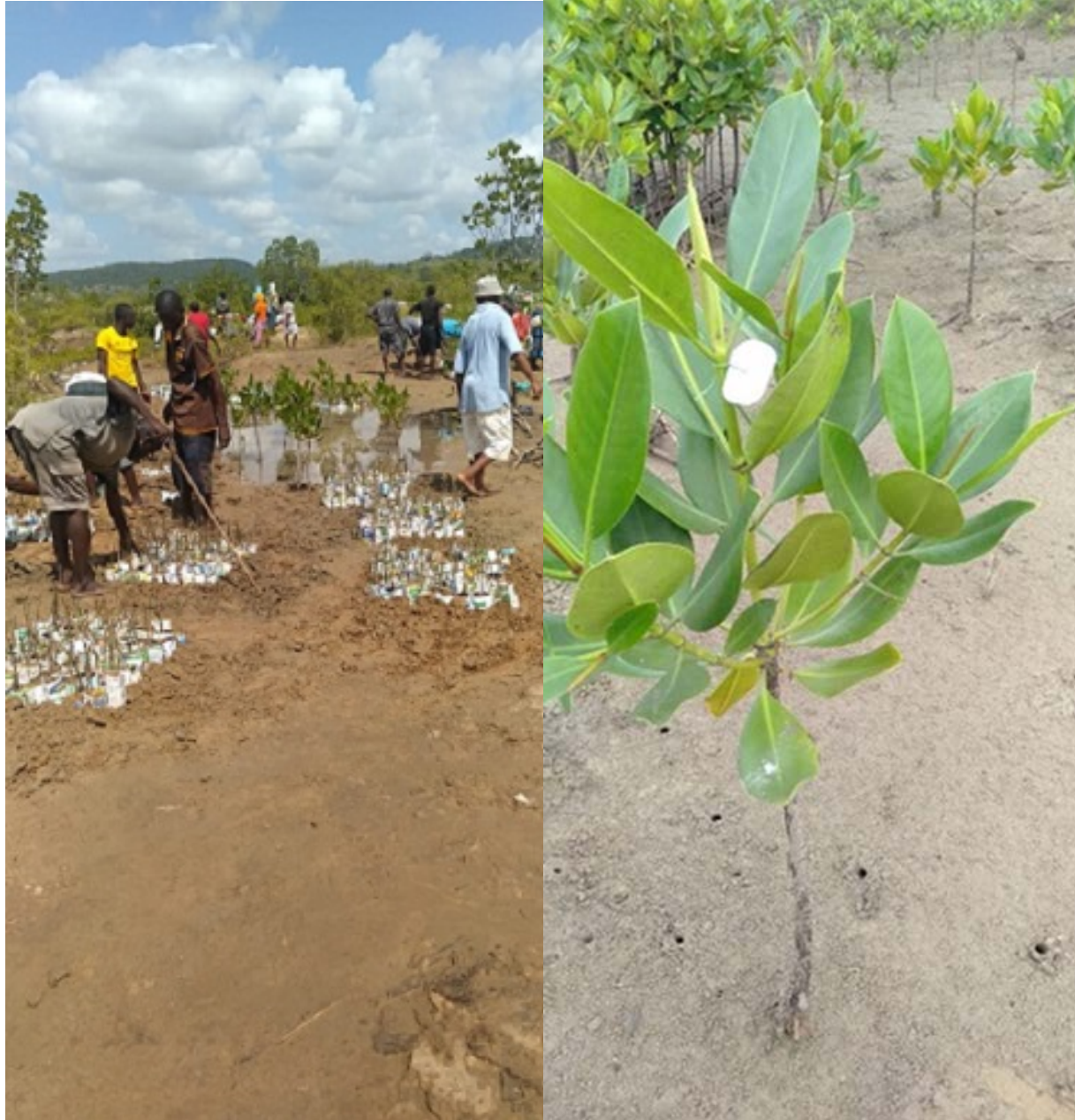
Left: Bidii conservation group planting more seedlings to expound on restoration this happened in March 2020. © Said Chirugah. Right: Tagged replanted mangrove plot for periodic monitoring. © Said Chirugah.