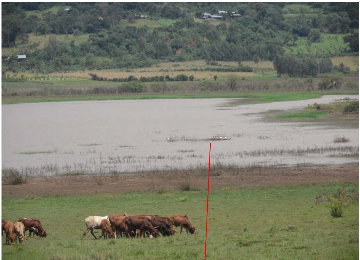
Figure 3: Other birds (herons) use artificially created nest