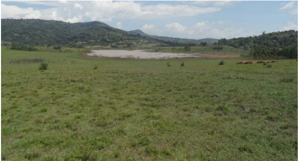
Figure 2: An overview of wetland at which the artificial nest created for wattled crane breeding

To avoid the effects of overflow on the nest, we have studied the hydrological condition of the wetland following hydrological gradients. The study has helped us to understand the shallow and maximum depth flood water during the rainy season. To make the site preferable for wattled crane breeding the artificial nest was created during peak rainy season (when the water level reaches its maximum point). The nest was located in the shallow depth, and 100 m away from the mainland to avoid interference of humans and livestock.