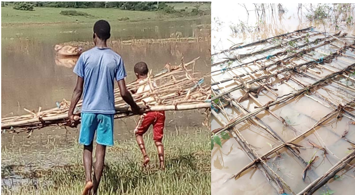
Left: Local boat to transport the mat and grasses to the selected nesting location. Right: Mat placed on wetland.