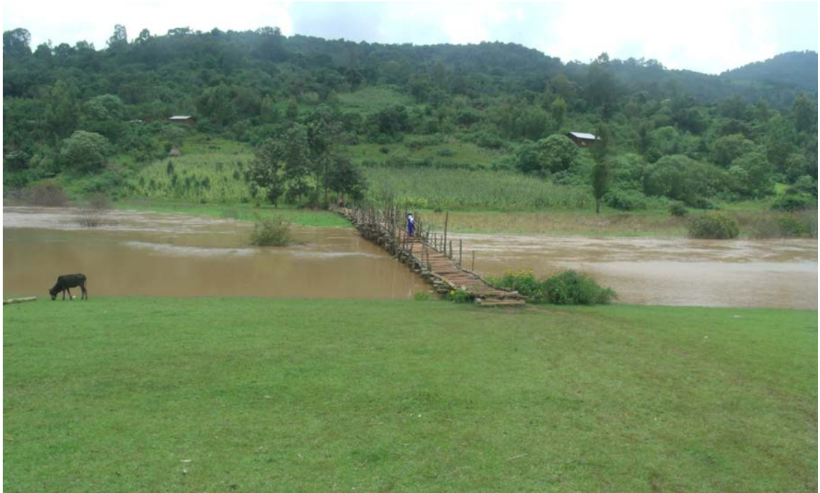
Figure 4: Crossing-Gibe river using traditional bridge in dawn stream to Boye wetland complex

In the breeding season we have searched the potential wattled crane breeding areas in Jimma. Immodestly after crossing a local made bridge on Gibe River downstream of the project site (Figure 4), we have found a new wattled crane breeding area. Around this bridge different bird species (e.g., herons) roost and live.