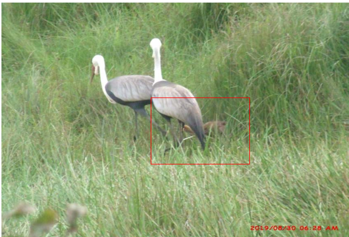
Figure 7: Wattled crane chick with its parents, Jimma Buyo Ka. Circle1: 7-day old chick.