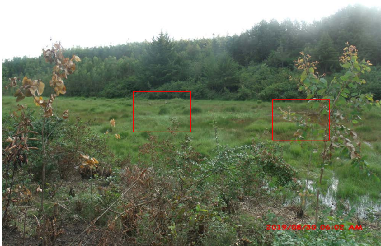
Figure 6: Overview of wattled crane breeding site in Jimma Buyo-Kachama. Circle 1: Wattled crane feeding. Circle 2: Active nest of cranes.