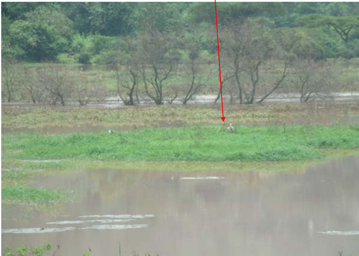
Wattled crane breeding pairs