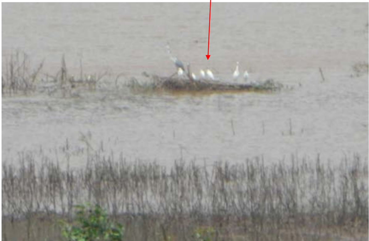
Different birds rest on the artificial nest