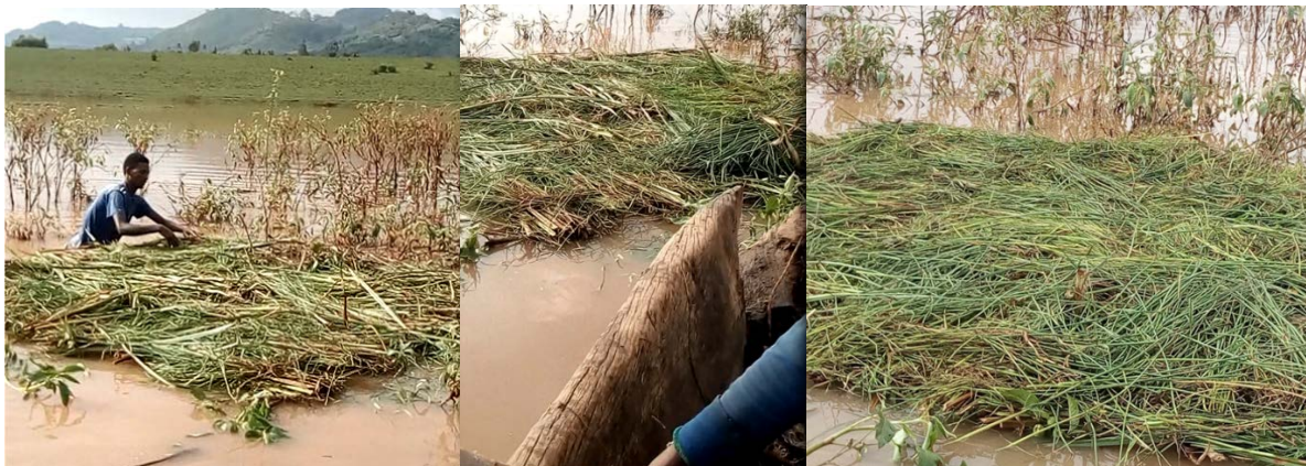
Left: Creating the nest. Middle: Grass transported with local boat. Right: Final view of the nest.