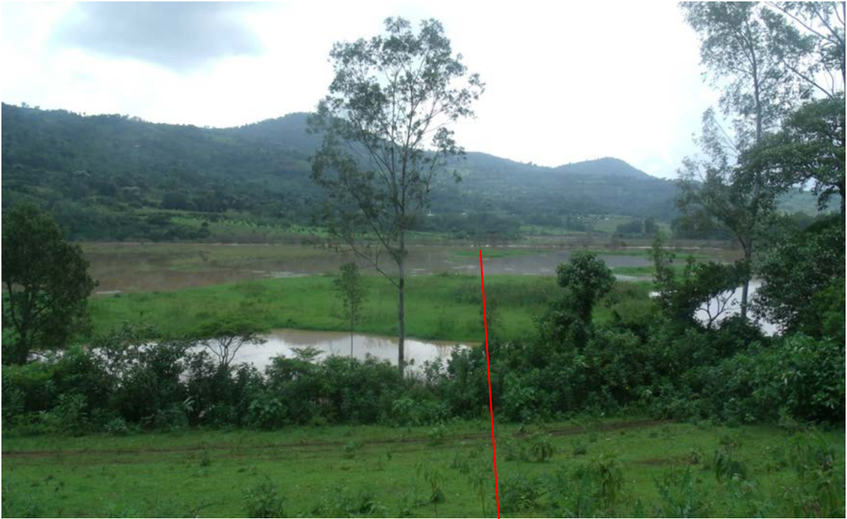
Figure 5: A new newly found breeding site at dawn stream to Boye wetland complex