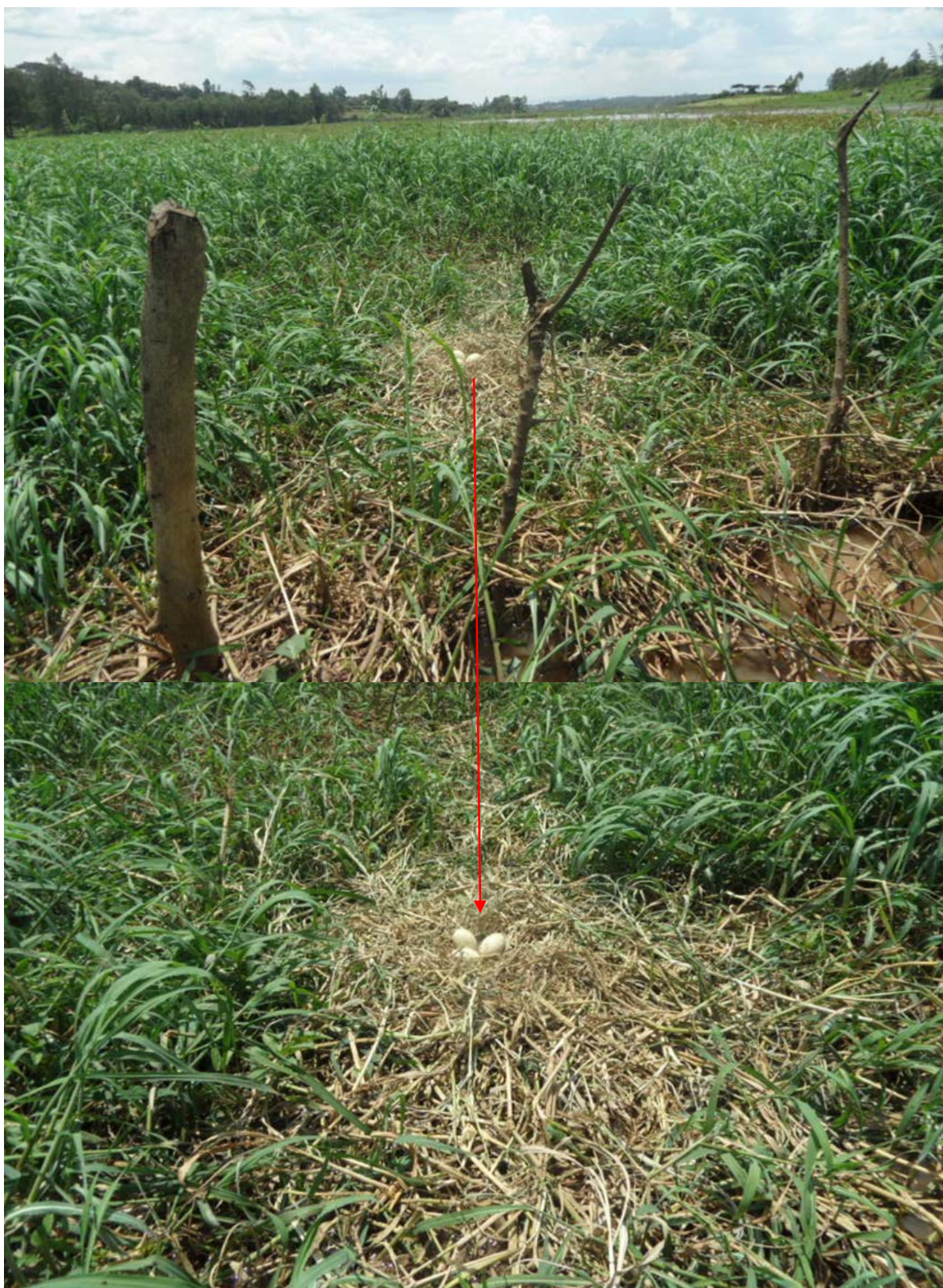
Figure 11: The second pair has also laid three eggs