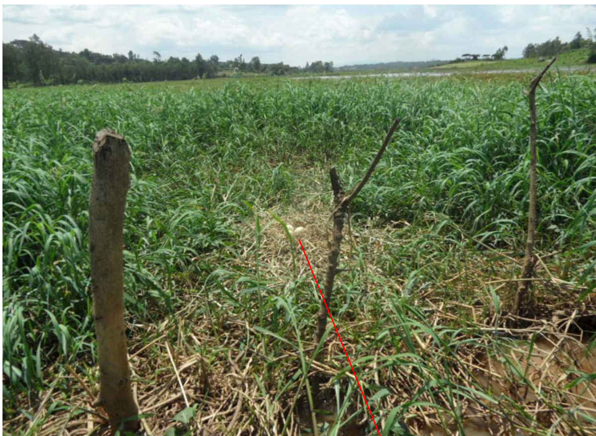
Figure 8: The restored wetland used by black crowned crane breeding