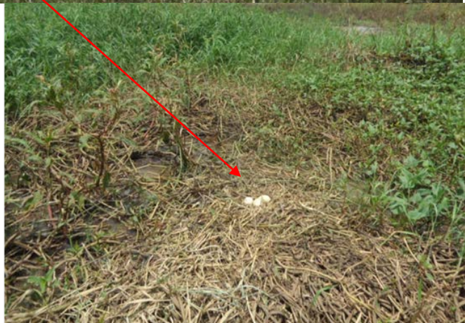
Figure 10: The first breeding pairs of black crowned crane laid three eggs.