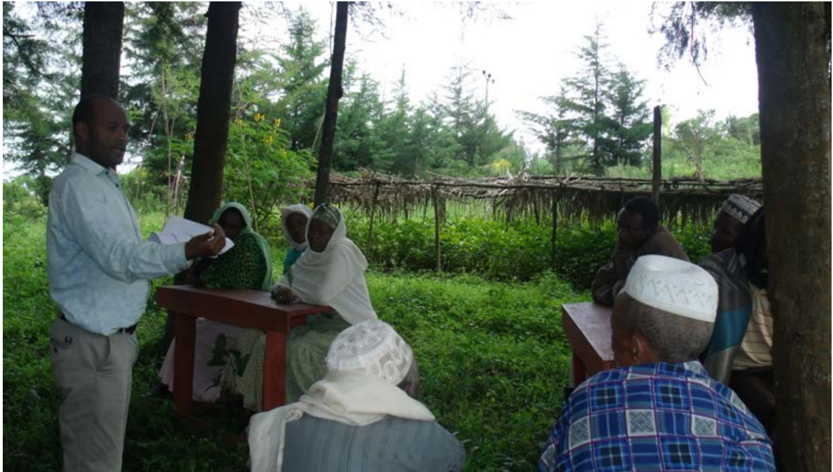
Figure 9: Discussion with local community on the socio-economic importance of protecting the wetland