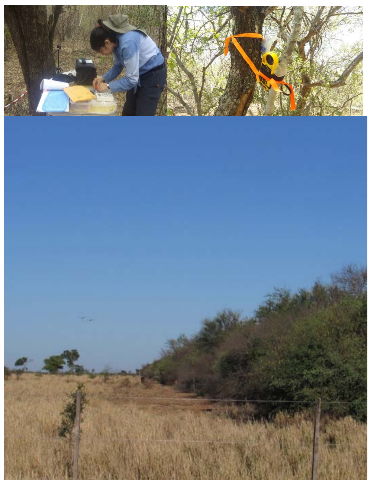
Figure 2. Working in the forest corridors (left). Forest corridors between the productivity plots (right).