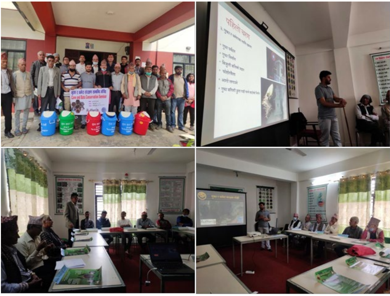
Figure 1: Cave and bats conservation seminar with cave management committees and concern stakeholders at Division Forest Office, Parbat, Nepal.

Last year we postponed our entire field visit due to rising coronavirus cases and severe lockdown in Nepal - this time we are happy to report that our spring monitoring assessment and conservation programme in caves of Kali Gandaki canyon has been completed. Alongside data keeping of cave microclimatic conditions and bat assemblages, we conducted seminars inviting members of cave management committee of Alpeshore, Gupteshore, Laleshore and Parbati cave and concerned stakeholders, and installed conservation hoarding boards, donated conservation dustbins and distributed samples to cave management guideline in each respective cave. In addition, during long pandemic period, we also disseminated our projects via publishing research papers and sharing news through highly followed social pages.