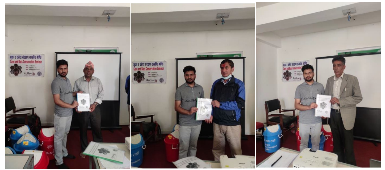
Figure 4: Distribution of cave management guideline to presidents of cave management committees.