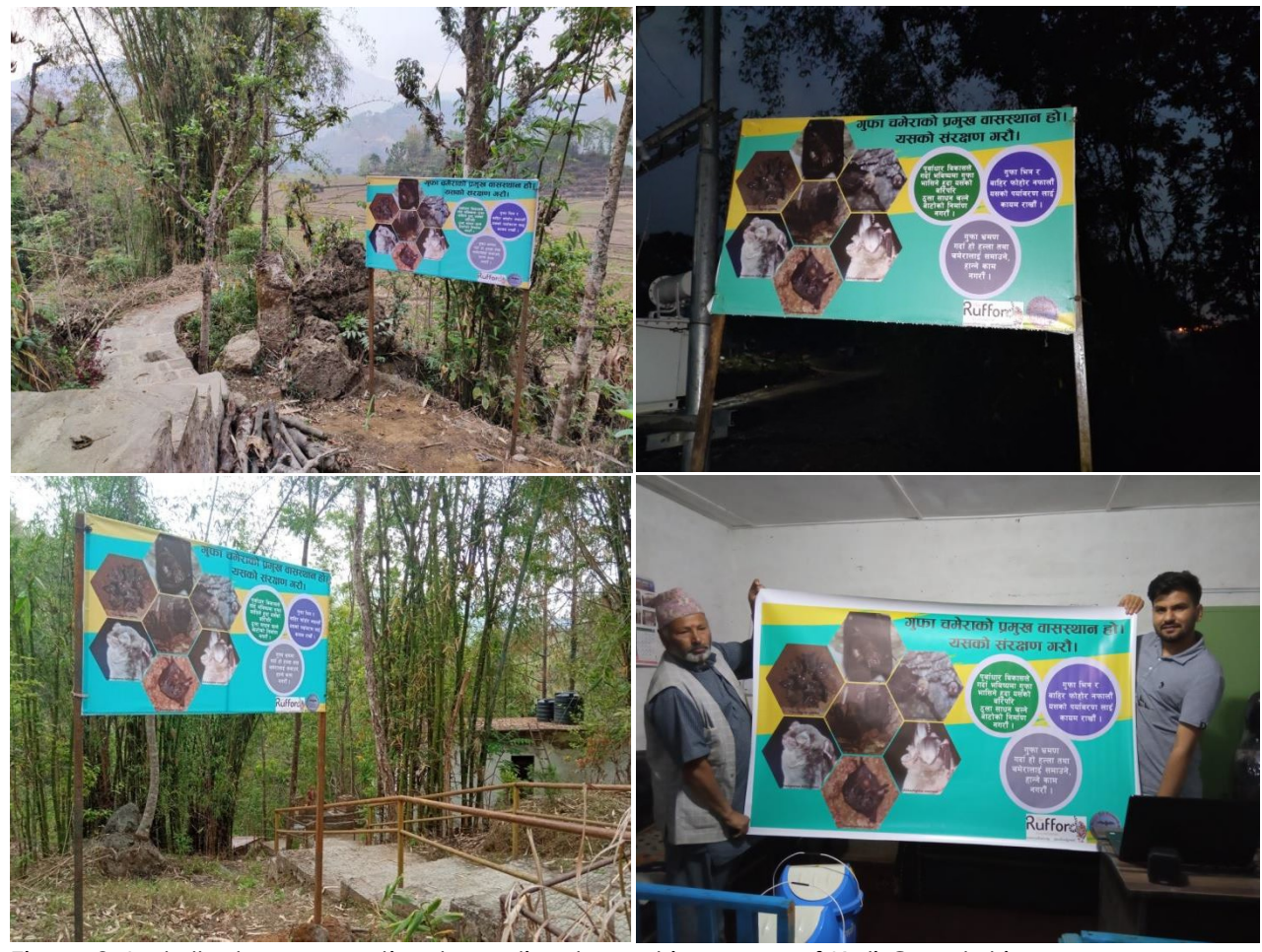
Figure 2: Installed conservation hoarding board in caves of Kali Gandaki canyon.