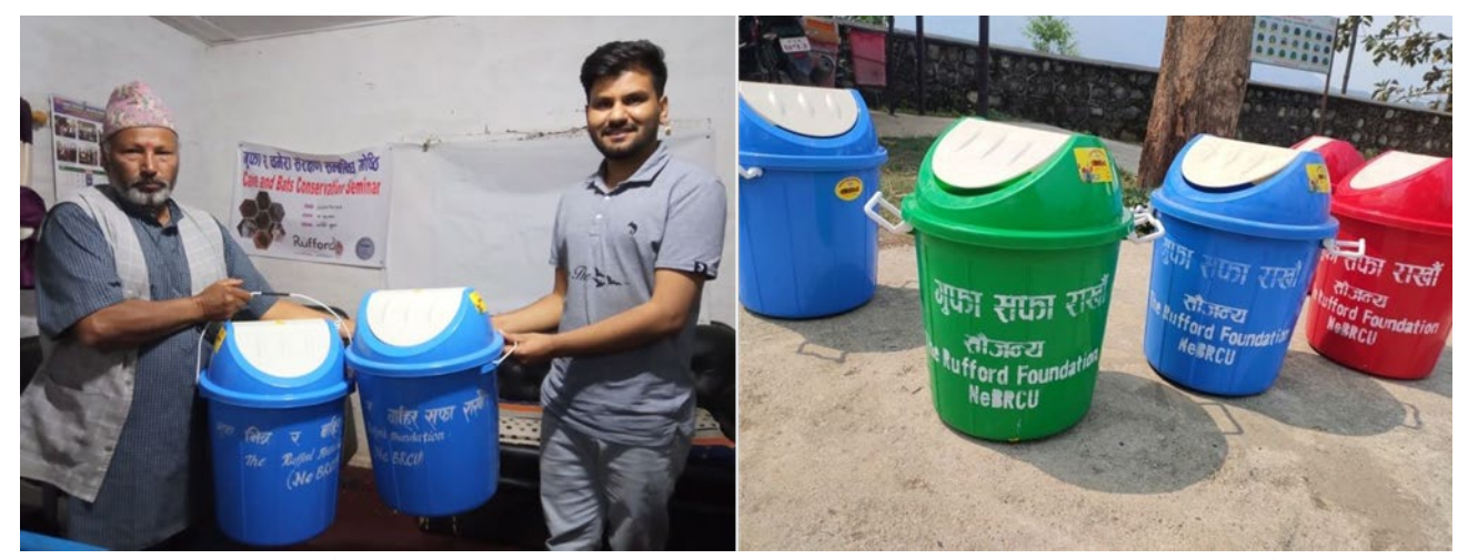
Figure 3: Donation of dustbins with key conservation message to the president of Parbati cave.