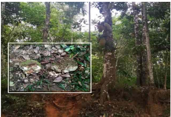
Jackfruit in the agriculture field is the main attraction for elephants in Wayanad