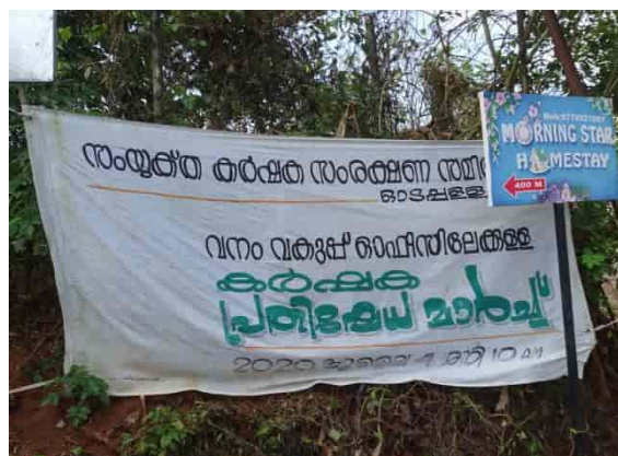
Banner in a public place indicating a rally to the forest department demanding action on mitigation of human-wildlife conflict.