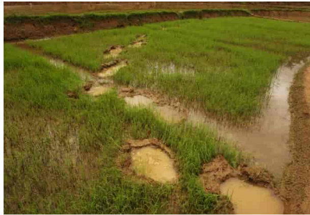
Damage by elephants to a Paddy ( Oryza sativa ) field in the study area