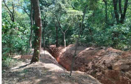
Elephant Proof Trench and fence erected on the boundary of village and forest.