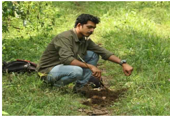
Elephant dung survey in the study area