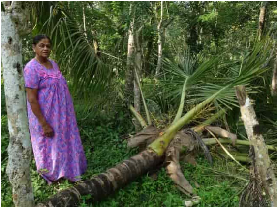
Coconut tree ( Cocos nucifera ) damaged by elephants in the study area