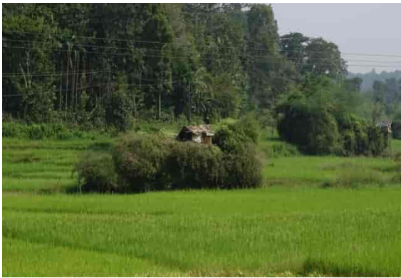
Machan raised to guard paddy