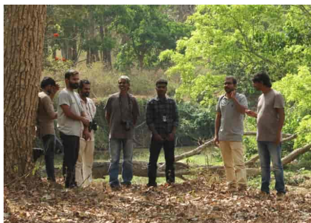
Field visit with the local NGO members, and forest department staff