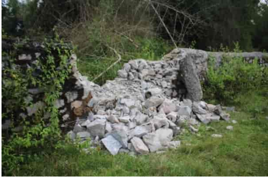
A stone wall erected in the forest and village boundary is damaged by elephants.