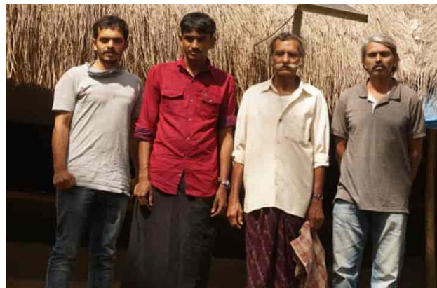
Research team met farmers to raise awareness about elephant conservation