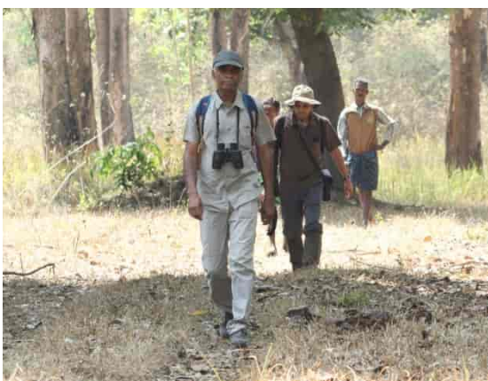
Field visit by the Co-PI