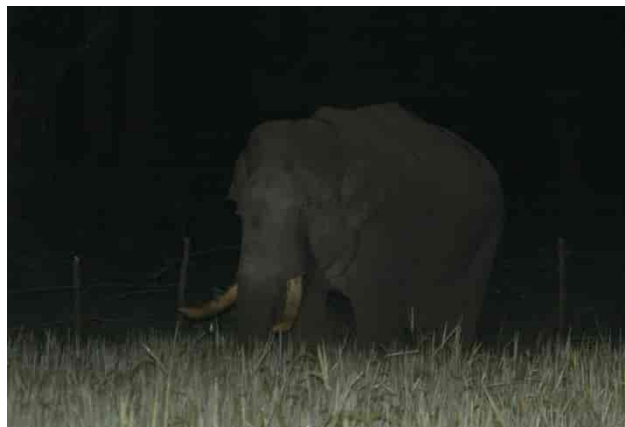
A crop-raider feeding on paddy in a forest hamlet.