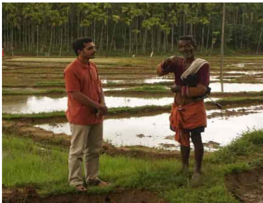
Interviewing a farmer to understand HEC situation