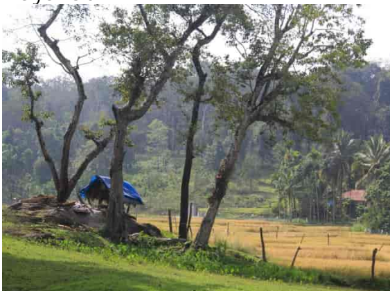
A forest hamlet grows paddy, coconut, and areca palm in the study area.