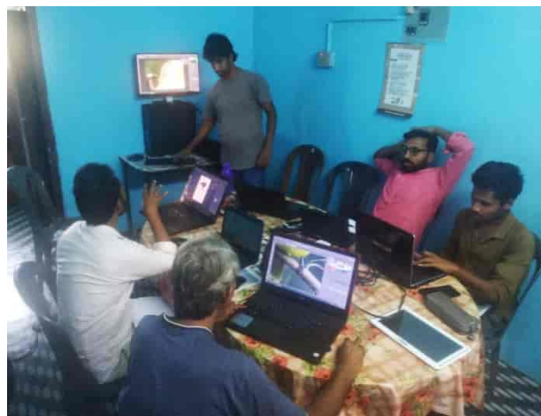
Conducted half-day workshop on handling research equipment and Photoshop