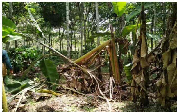
Elephant raided banana plantation in the study area