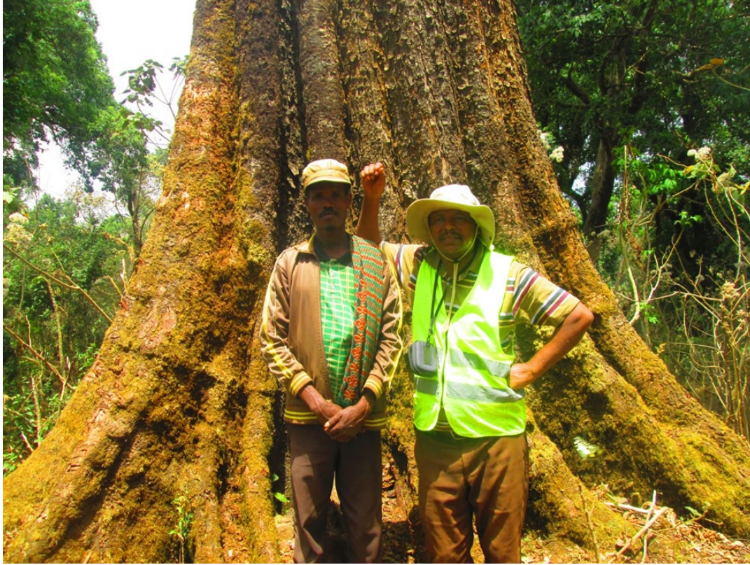
C. Views of different forest patches