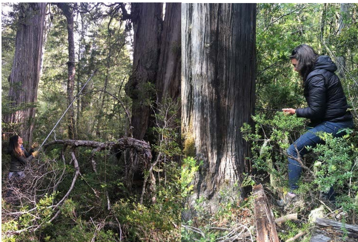
Collecting leaf samples and wood cores.