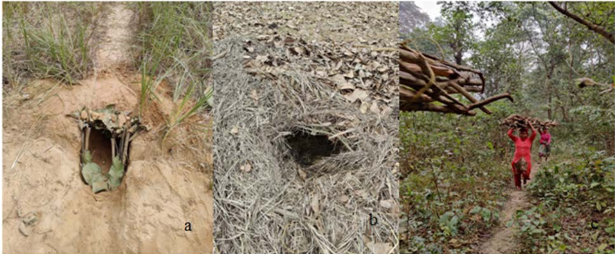
Photo: 2 Forms of disturbances (a), (b) traps for wildlife and (c) timber extraction

Human Disturbance Survey in Chure: We have conducted human disturbance occupancy survey in the Chure range. We included the Chure range both inside and outside the Banke National Park (BaNP) in order to gather good information. The data we have collected includes the severity, forms, extent of the disturbance caused to the range because of various anthropogenic activities. During the survey we came across various illegal timber extraction points, traps for wildlife, and even found people deep inside the forest collecting timbers and firewood. However, the analysis of the impact of human disturbance in the occupancy is yet to be conducted.