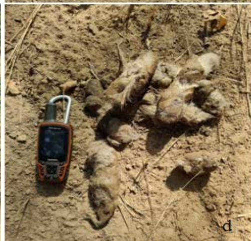
Photo: 3 Scat collection (a) and (c) by team members, (b) Pugmark d) Scat of big cat.