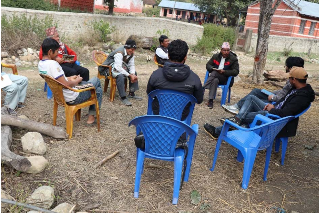
Photo: 1 Group Discussion with local communities of Dang around Banke National Park (BaNP) Buffer Zone.

Preparatory Works: (Reconnaissance Survey, Key Informant Survey): We conducted a reconnaissance and key informant survey at the beginning of project to create an effective project plan. After conducting a series of discussion with park officials and local communities, we created a framework that would allow us to work efficiently even during the COVID-19 pandemic.