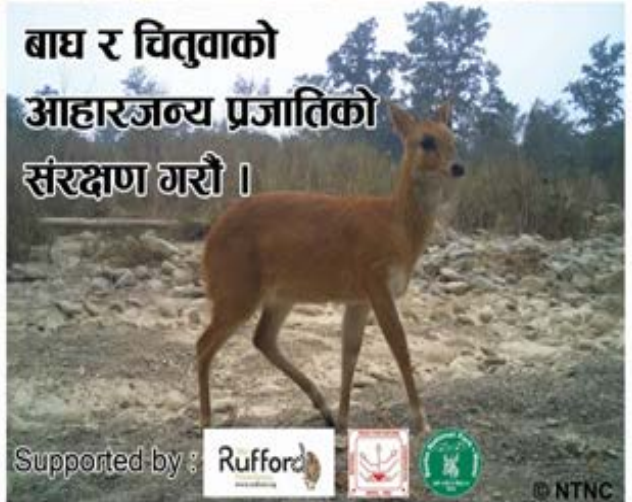
Photo: 1 Stickers with conservation messages of tiger- leopard and their natural prey.

Outreach Campaign: With an aim of spreading conservation awareness, we conducted school teaching programmes and organised events like a poem competition and drawing competition. We also organised interactive class with presentation in order to educate students about the necessity of conservation and the importance of big cats in maintaining balance in the ecosystem. The presentation was conducted for an hour where many students put questions on what species were big cats and why we needed them in the environment. We even discussed with students about the problems of illegal timber extraction and depredation of Chure hills. As the local stakeholders and real custodians of any forests, teaching the villagers and local stakeholders about conservation importance of Chure forests is noted as one of the important outcomes of the project.