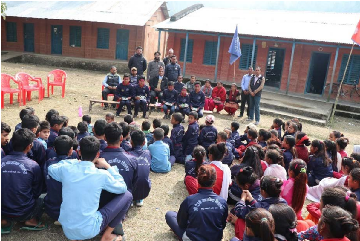
Photo: 4 Prize distribution of drawing competition.