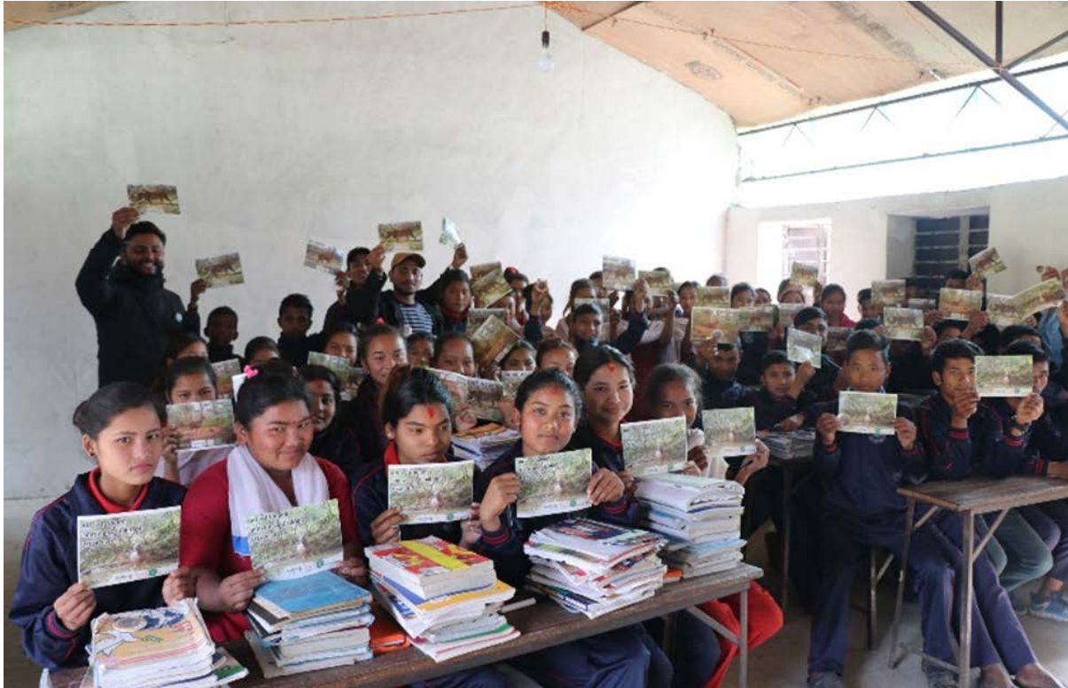
Photo: 3 School awareness programs about conservation of tiger and leopard.