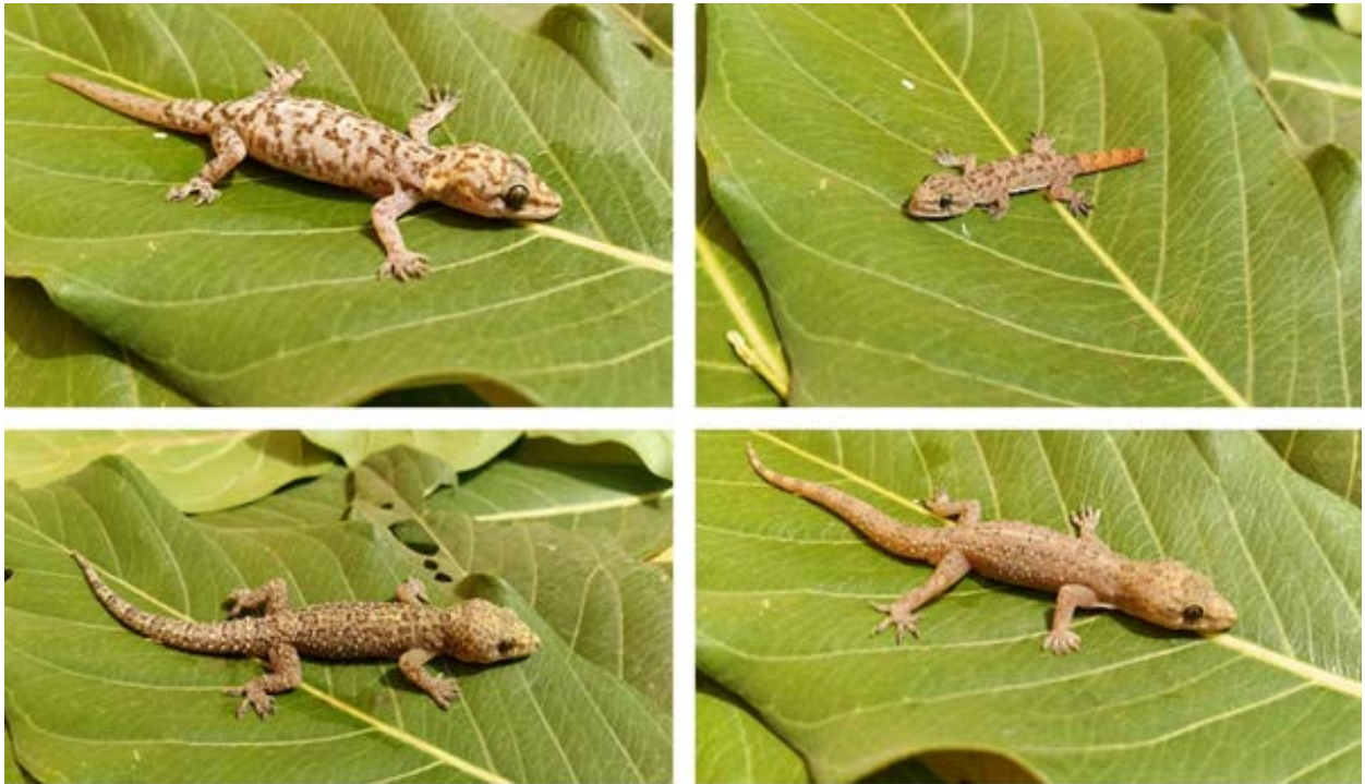
Figure 4 (b): Different morphs of Hemidactylus species recorded during the field survey.

During the field survey, we observed several threats to herpetofauna. These include cattle grazing, bush burning, uncontrolled irrigation practices, use of chemical fertilisers and pesticides for agriculture, and slash-and-burn agricultural practices (Figure 5).