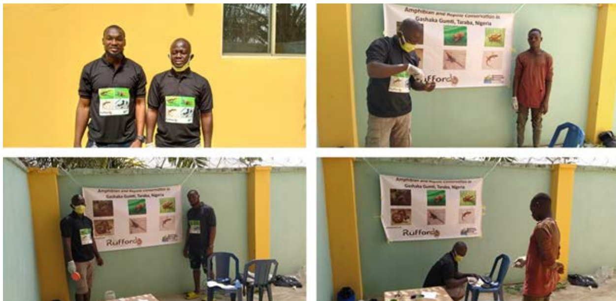
Figure 2 (b): Field assistants processing the vouchers collected during the field survey.

We processed the representative vouchers collected during the field survey (Figure 2b). We encountered 117 amphibians and reptiles during the field survey. We observed, collected and preserved different amphibian species (Figure 3) and morphs of geckos of the genus Hemidactylus for an inventory of Hemidactylus species in Nigeria, and description of the possibly new species (Figure 4). We also documented the geographic coordinates of different amphibian and reptile species encountered during the field survey.