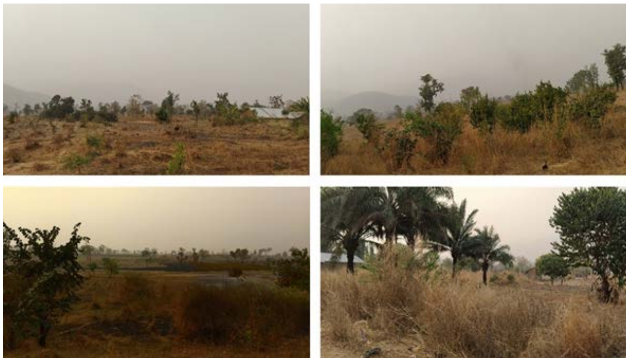
Figure 1 (b): Some of the localities surveyed during the field survey.