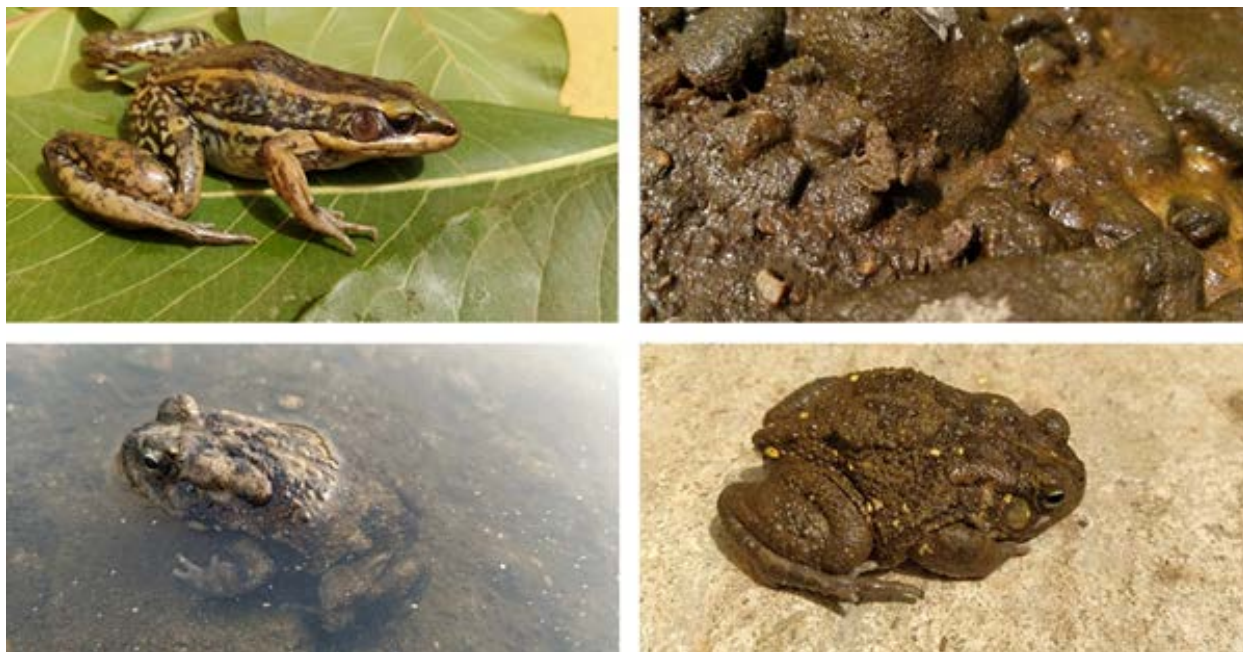
Figure 3: Some amphibian species recorded during the field survey.

We processed the representative vouchers collected during the field survey (Figure 2b). We encountered 117 amphibians and reptiles during the field survey. We observed, collected and preserved different amphibian species (Figure 3) and morphs of geckos of the genus Hemidactylus for an inventory of Hemidactylus species in Nigeria, and description of the possibly new species (Figure 4). We also documented the geographic coordinates of different amphibian and reptile species encountered during the field survey.