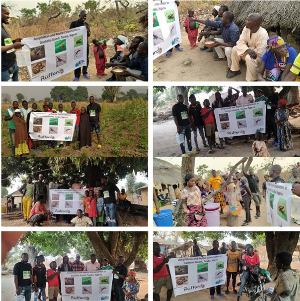
Figure 6: Conservation awareness and sensitization programmes within the local community.

The phase of the project will be dedicated to conservation education programmes in schools and public places within the local communities in Gashaka Gumti, Taraba State, Nigeria. Alongside these activities, we will be analysing the results of our field survey and also drafting manuscript on the species distribution model of amphibians and reptiles of the area.