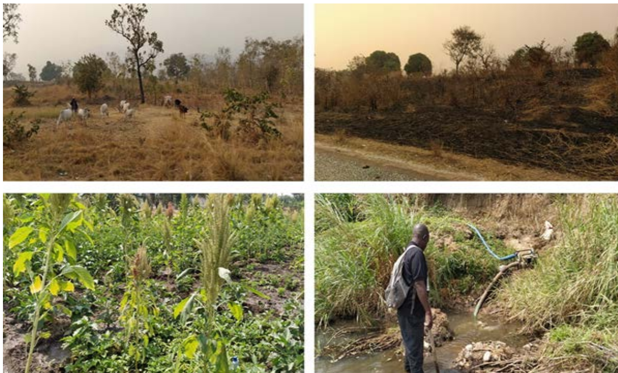
Figure 5: Different human activities observed during the field survey that may pose threats to the amphibians and reptiles in the area.

We further engaged in community-based conservation activities (involving conservation sensitisation and awareness programmes). We visited different communities and interacted with local people including farmers, market women and men, youths, hunters etc (Figure 6). We enlightened the public on the importance of herpetofauna in the ecosystem and the need for the conservation of amphibians and reptiles and its associated habitats.