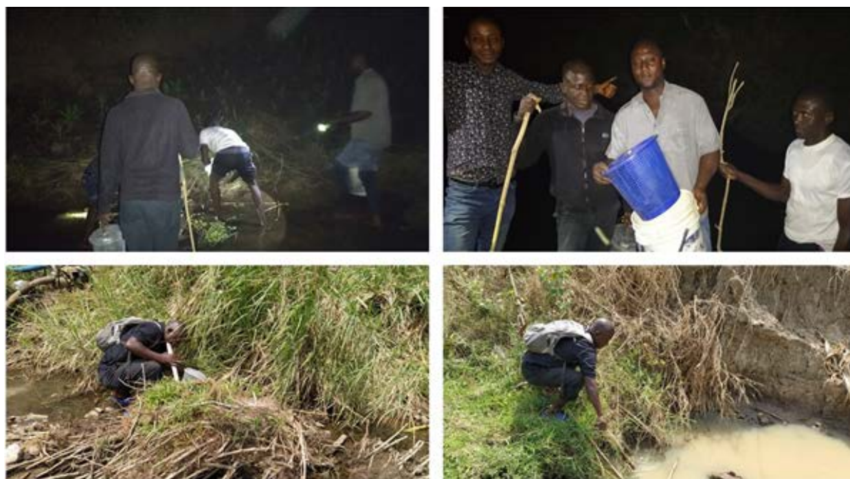
Figure 2 (a): Field activities by the team members and some local people.