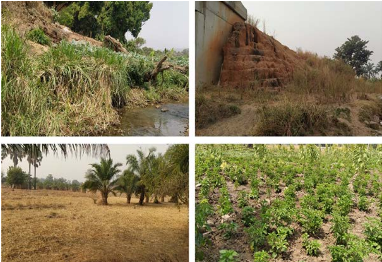
Figure 1 (a): Some of the localities surveyed during the field survey.

The first phase of our project involved herpetological field survey and community-based conservation activities (involving conservation sensitisation and awareness programmes). We focused our field survey in areas that were relatively unexplored during the previous herpetological survey of the park (Figure 1). Specifically, our survey focused on the Mambila Plateau and its environs. We searched for amphibians and reptiles opportunistically. We surveyed the banks of the aquatic ecosystem for amphibians, and we also searched for amphibians and reptiles in the grassland and agricultural field (Figure 2a).