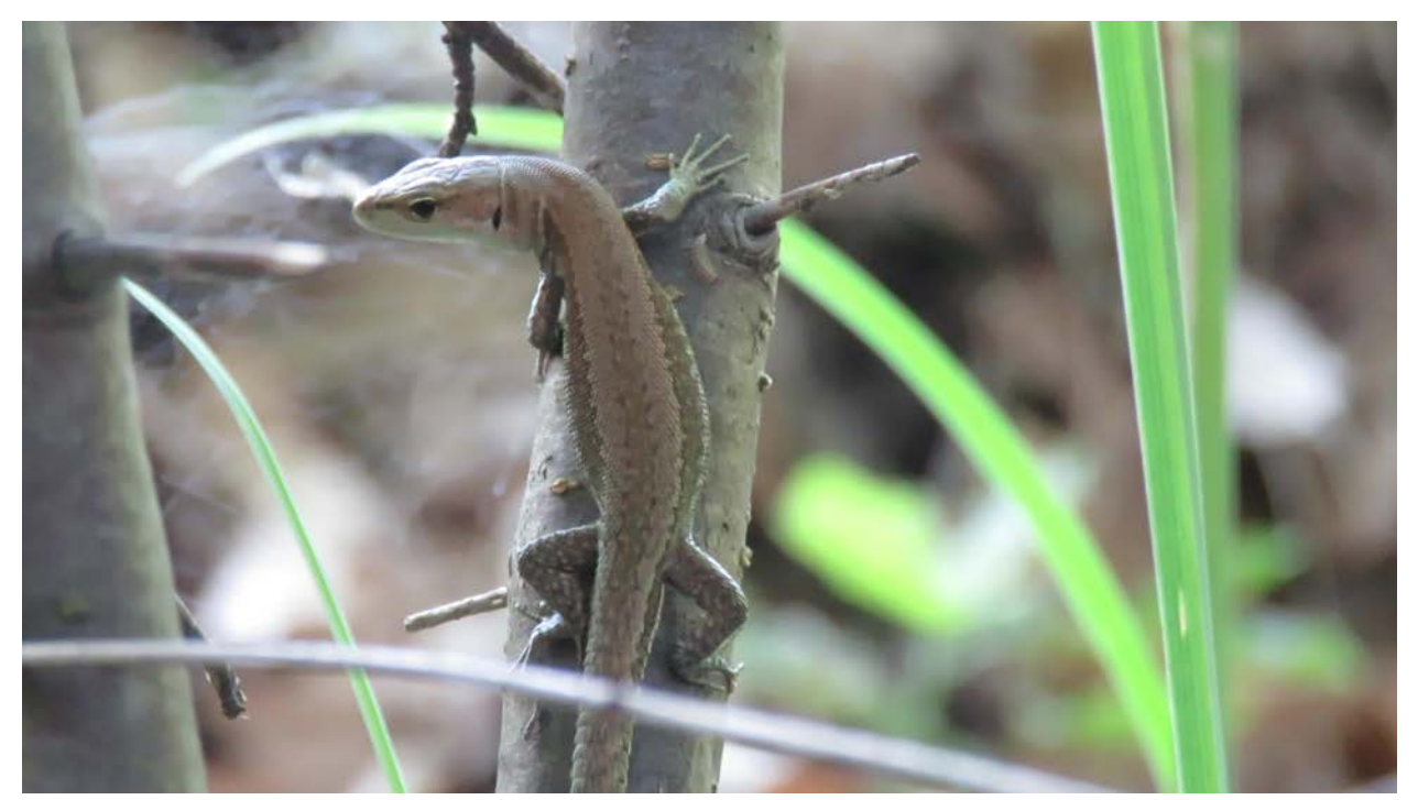
Darevskia praticola, the meadow lizard, for the "Wild interviews" series. IUCN status Near Threatened.