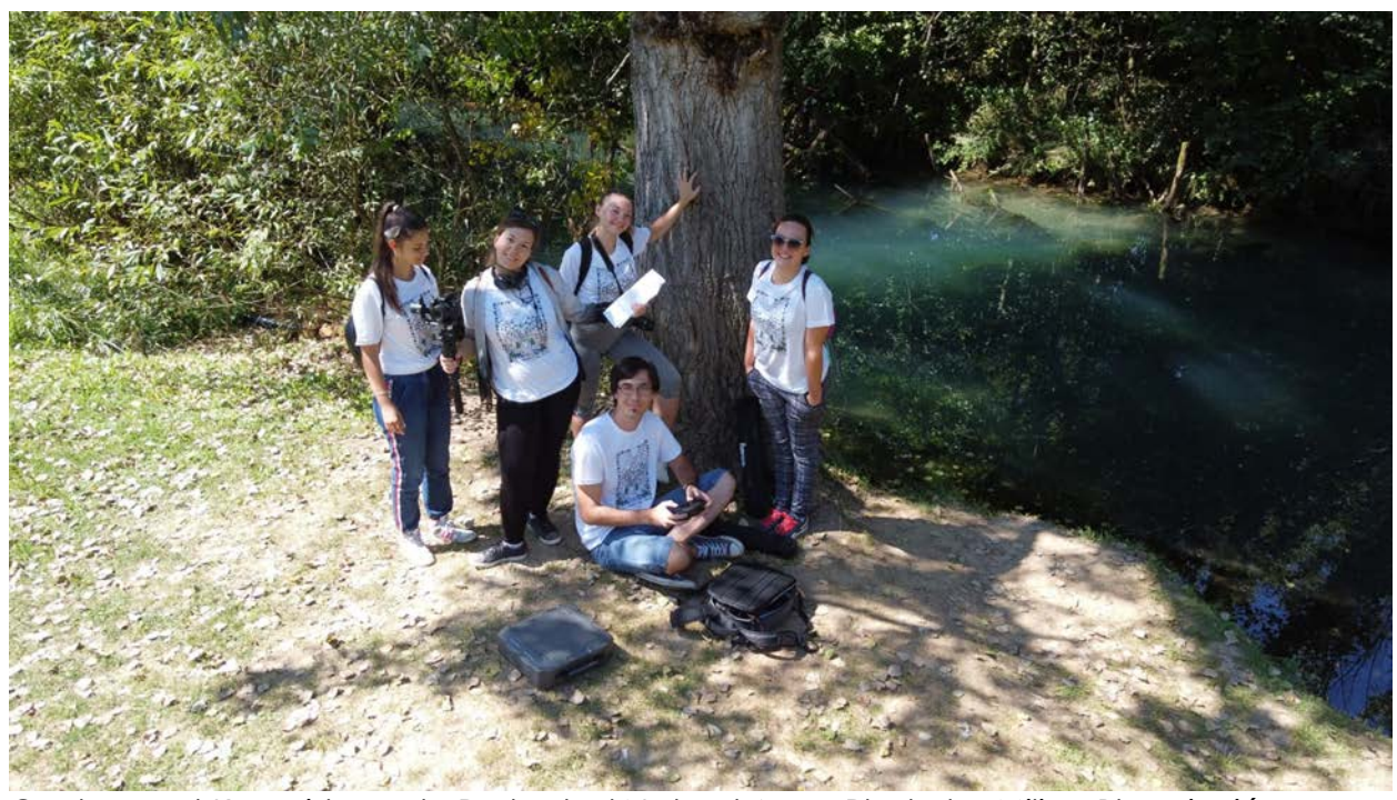
Our team at Krupajsko vrelo Protected Natural Area.