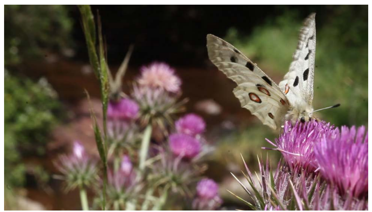
Parnassius apollo, The Apollo butterflies, for the "Wild interviews" series. IUCN status Vulnerable.