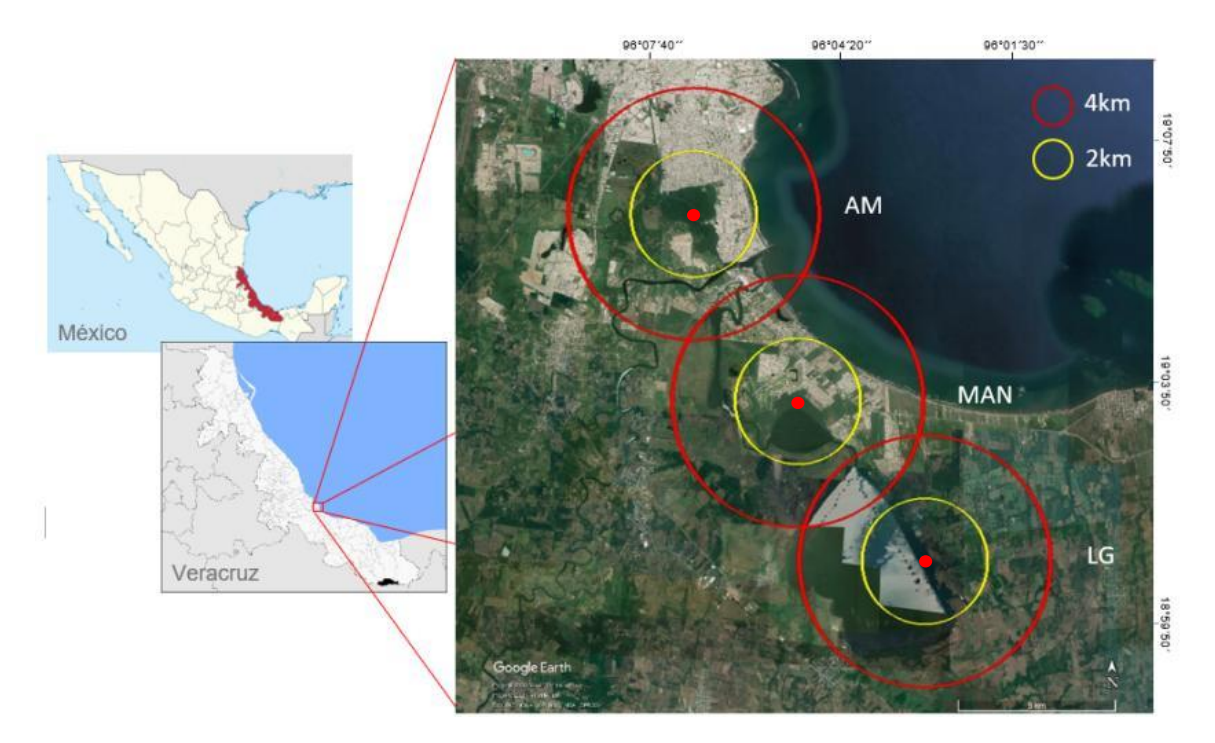
Figure 1. Geographic location of the study area in the central coastal portion of Veracruz, Mexico. Focal mangrove fragments and spatial radius are shown.

The field work covered three mangrove fragments in the central portion of the "Planicie Costera de la Región del Sotavento" physiographic province in the state of Veracruz, Mexico (Fig. 1). The choice of these fragments was: 1) Arroyo Moreno "AM", 2) Mandinga "MAN" and 3) Laguna Grande "LG" because of their relative structural homogeneity and because they are mixed forests with three mangrove species: Rhizophora mangle (red mangrove), Avicennia germinans (black mangrove) and Laguncularia racemosa (white mangrove). We took fragments as focal points and adjusted 2 km and 4 km radii to delimit landscape contexts and characterize them at three nested spatial scales: local vegetation, patch, and landscape. We classified a subscene of a Landsat 8 Level-2 multispectral image (30m spatial resolution, April 2019) with 5 land use classes: 1) mangrove, 2) agricultural, 3) urban settlements, 4) water, and 5) secondary vegetation. We extracted landscape contexts and calculated landscape metrics at the patch (area) and landscape scales (Shannon diversity, percentage of land use classes and number of fragments) using ArcMap Ver. 10.5 and FRAGSTATS Ver. 4.2.1 software. At the local vegetation scale, we established 20x20m plots where we measured diameter at breast height (DBH), and estimated mangrove structural variables such as basal area and tree height. All variables were considered as predictor variables.