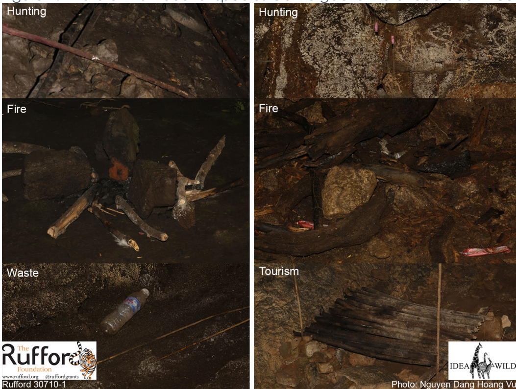
Figure 3. Photo of four mains human impacts on unusual and fragile ecosystems in lava tube caves (example C4 Cave)