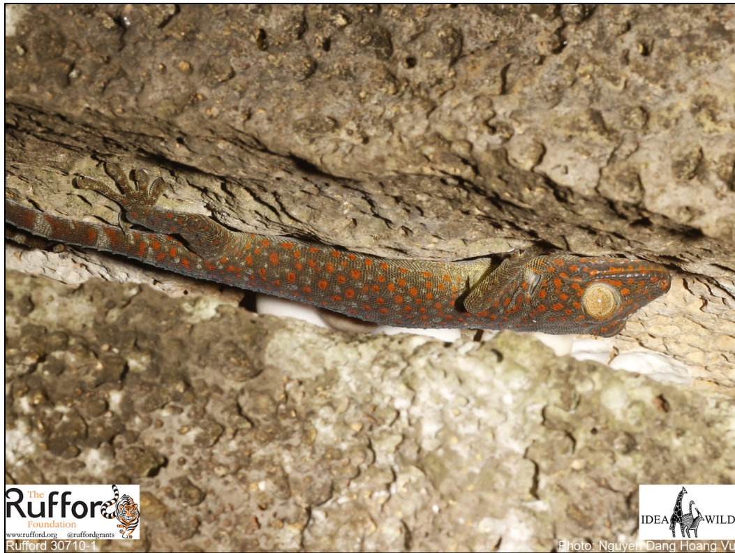
Figure 2. Photo of individual of species Gekko gekko were recorded in C8 Cave