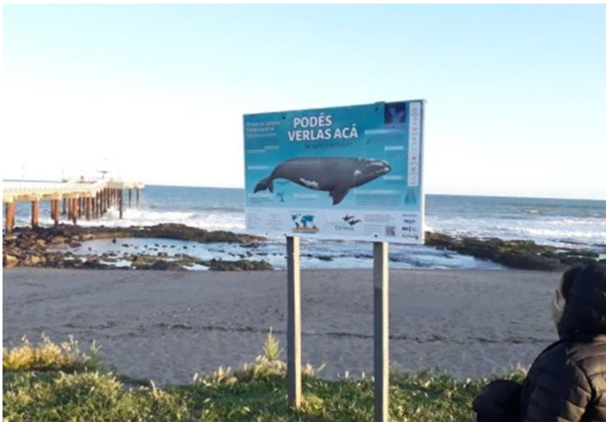
New panel of Whale Watching on Miramar's promenade

We gave two virtual talks for a kindergarten from Neuquén province (Patagonia Argentina). Lectures were about whales and dolphins, and their sounds. Then the children made drawings to represent what they learned.