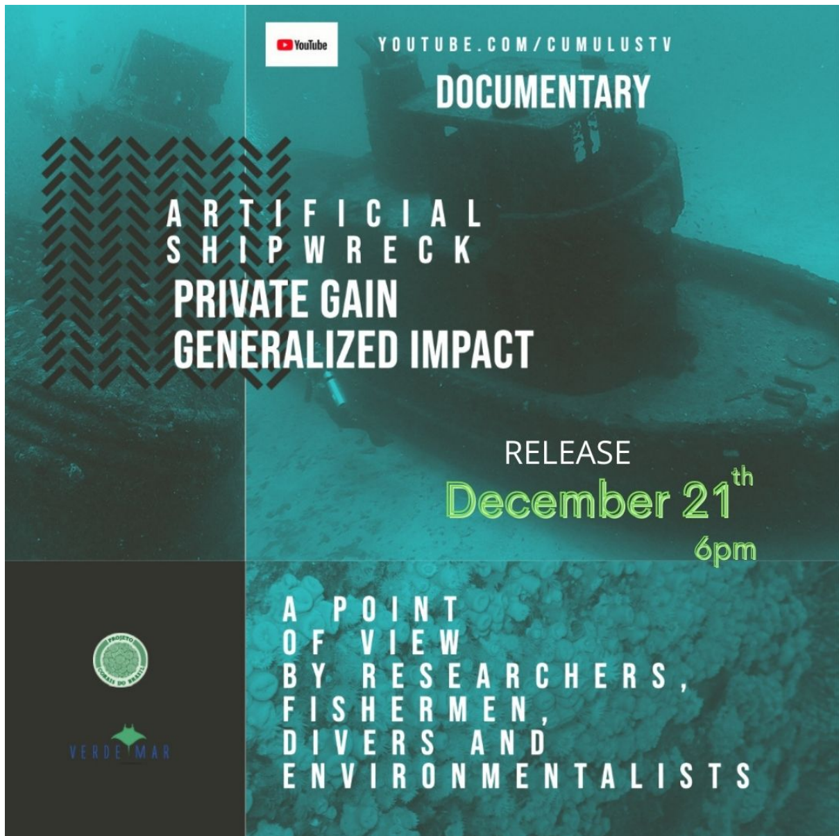
Figure 2. Documentary poster available on YouTube: "Artificial Shipwrecks: private gain, generalized impact". www.youtube.com/watch?v=GxVADp_MJsg