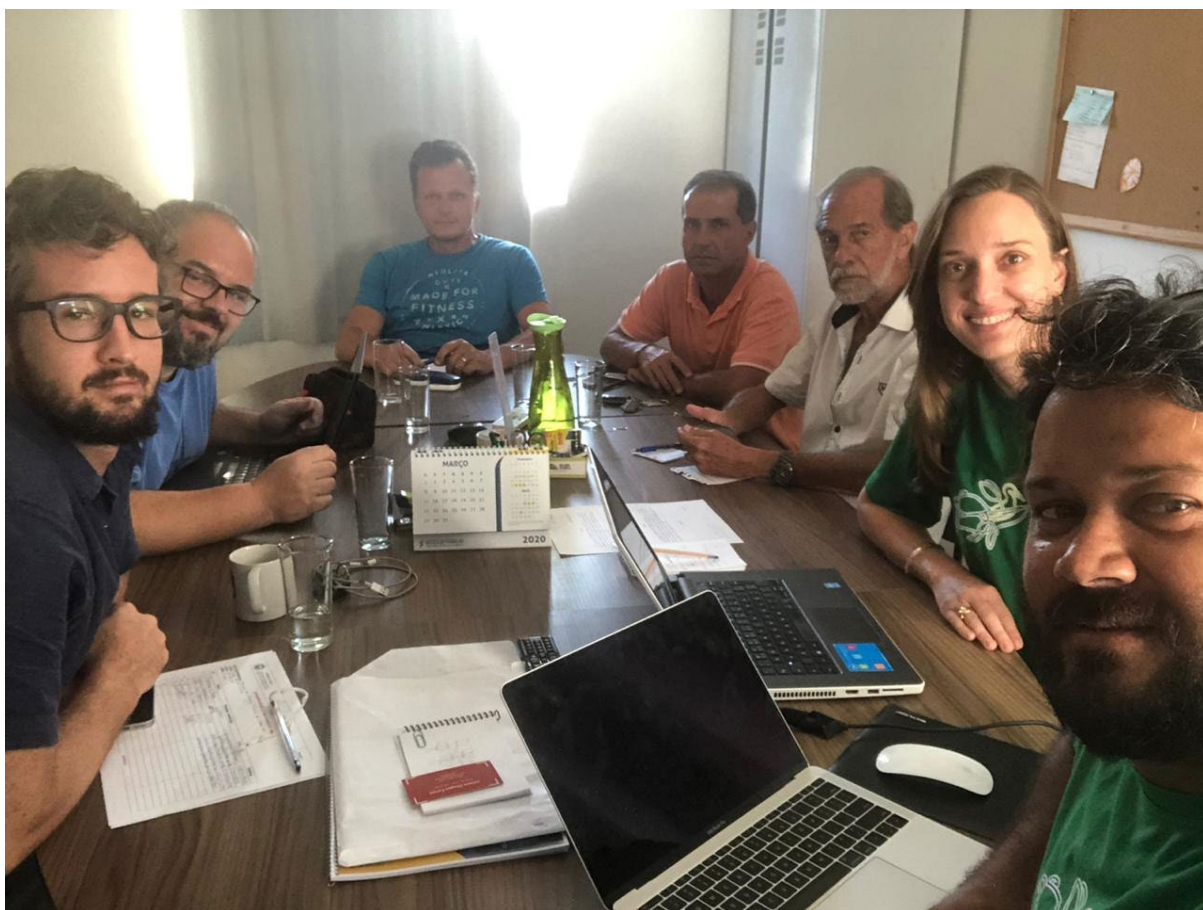
Figure 5. Meeting with representants of environmental agencies and NGOs at Alagoas state to build a police tool to implement actions to avoid Sun Corals invasions.