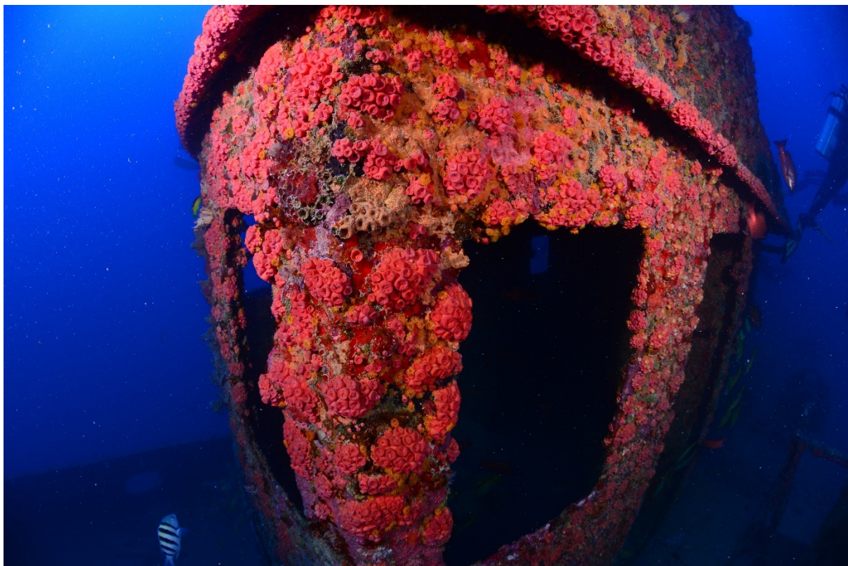
Figure 1. High coverage of Sun Coral ( Tubastraea spp.) reported in 2020 on artificial shipwreck Walsa intentionally sunk in 2006.

Our project started during the COVID-19 pandemic period in October 2020. We started the social communication about the sun coral invasions. In 2020, sun corals were reported occurring in shipwrecks in Pernambuco < 90 km from the MPA Costa dos Corais (Fig. 1). We produced and shared on social media a short documentary about the problem of artificial shipwrecks as a stepping-stone to sun coral invasion in Brazilian coral reefs (Fig. 2, www.youtube.com/watch?v=GxVADp_MJsg ). We also produced posts on Instagram detailing the important steps of sun coral invasion process in Brazil; introduction, survival, establishment, dispersal (including artificial shipwrecks as a facilitator) and ecological impacts (Fig. 3, https://www.instagram.com/p/CNtA7rxlvUw/ ). Additionally, we started fieldwork activities in January 2021 using scuba diving to take ~6,000 photo-quadrats (Fig. 4) to monitor potential arrive of sun corals in MPA Costa dos Corais (12 reef sites), and fortunately, we didn't find them. These data will also be important to access vitality conditions, abundance and richness of native benthic species to investigate the main research question of our project: how vulnerable are reef communities to invasion impacts based on native species biological characteristics? Some management actions were also conducted in partnership with environmental agencies in Pernambuco and Alagoas governments (Fig. 5) to implement public laws and regulations to avoid sun coral invasion.