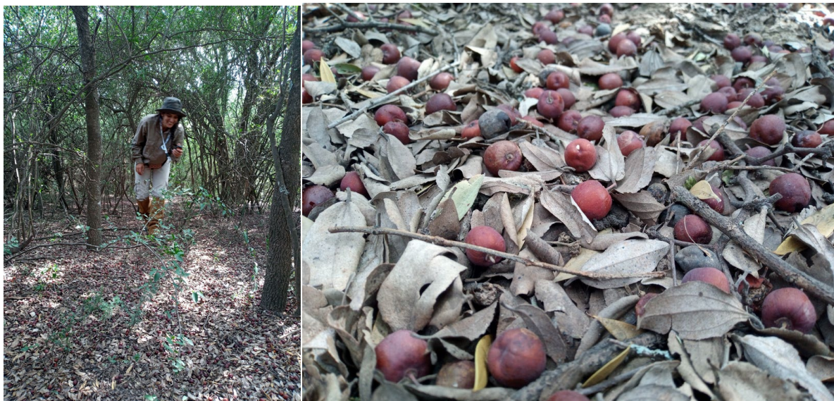
Left: Marking waypoints location of all the neighbour trees around a focal tree employing a GPS. Right: Fruits of Sarcomphalus mistol in one of the surveyed forest patch.

We collected seeds of Prosopis nigra and Sarcomphalus mistol in four forest patches. For each harvested tree, we measured the distance of all trees of the same species in a radius of 25m: if the harvested tree was P. nigra , then we measured the distance of all P. nigra trees present in such radius. This measured was done to evaluate the local influence of tree neighbours on reproductive parameters of the focal tree (the harvested trees). Moreover, the selected forest patches present different forest cover in their local landscape, representing a forest cover gradient at landscape scale. This design allows us to test the effects of forest loss on the reproductive potential of the studies species.