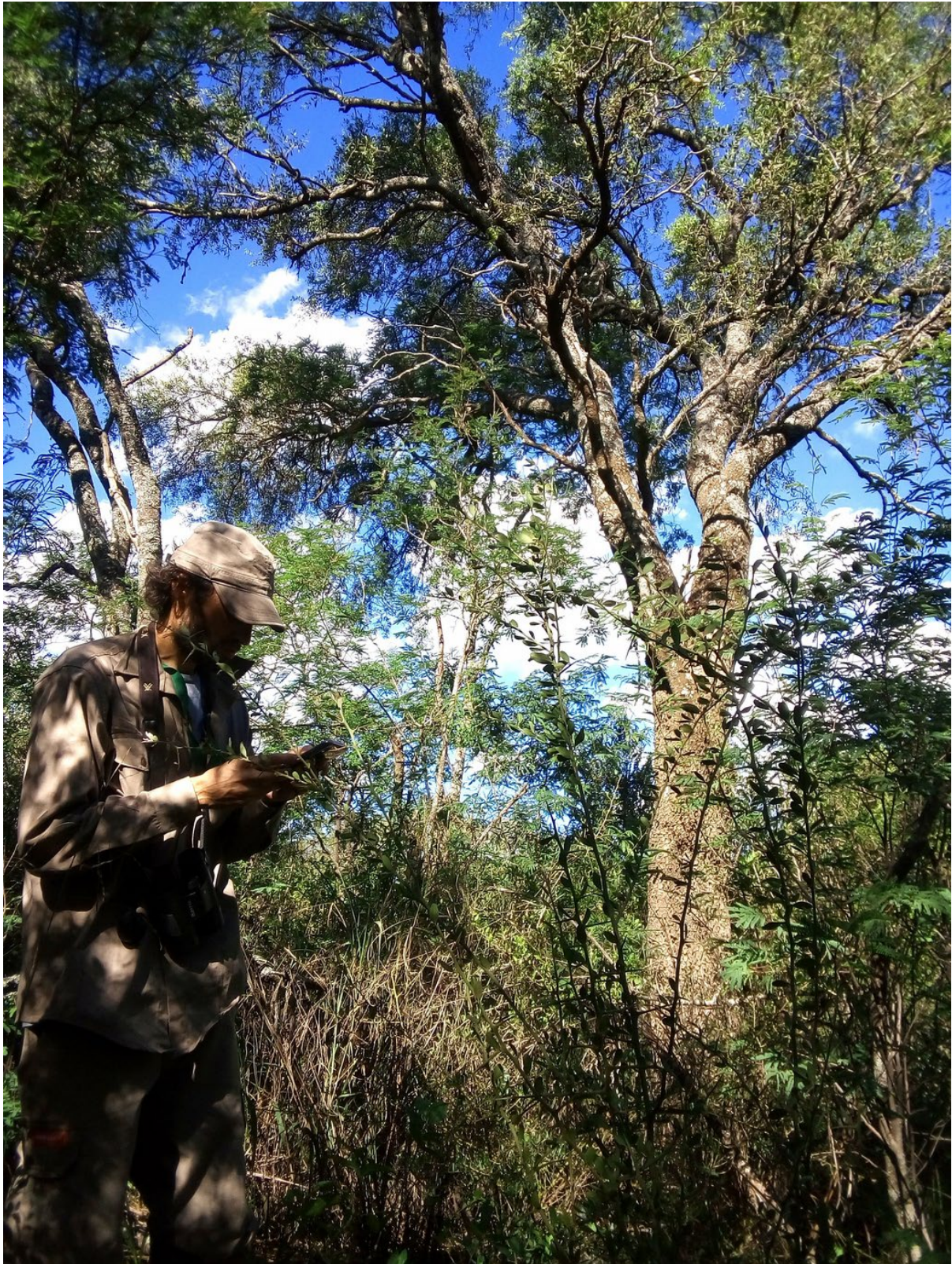
Conducting the bird surveys.