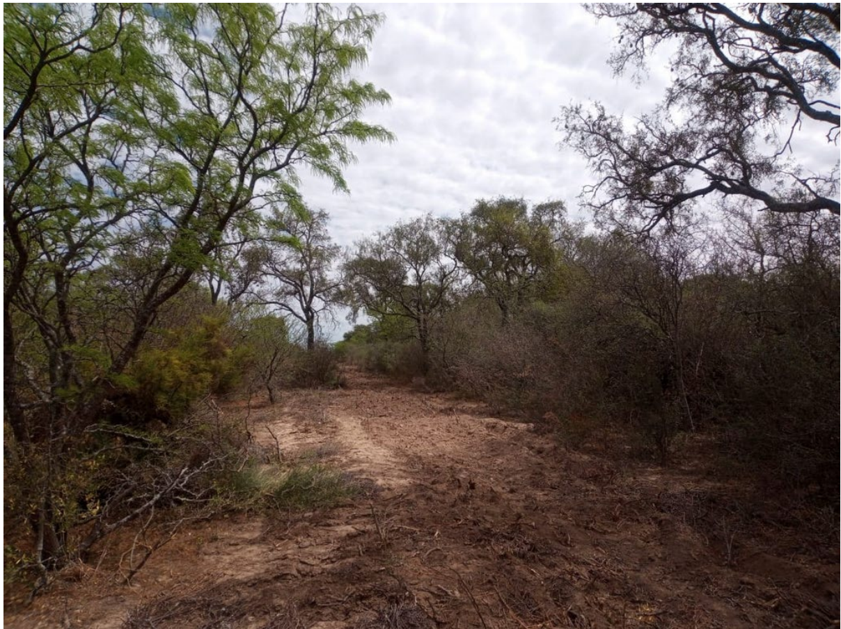
The interior of one of the forest patch in Villa Rosario del Saladillo.

conserve such forest patches and conduct ecotourism activities in the area. They asked as for help in this regard. Our initial contribution will be to generate a baseline of avian and vegetation diversity in the area. Moreover, in such town there is a school in which we are planning to generate some environmental education activities.