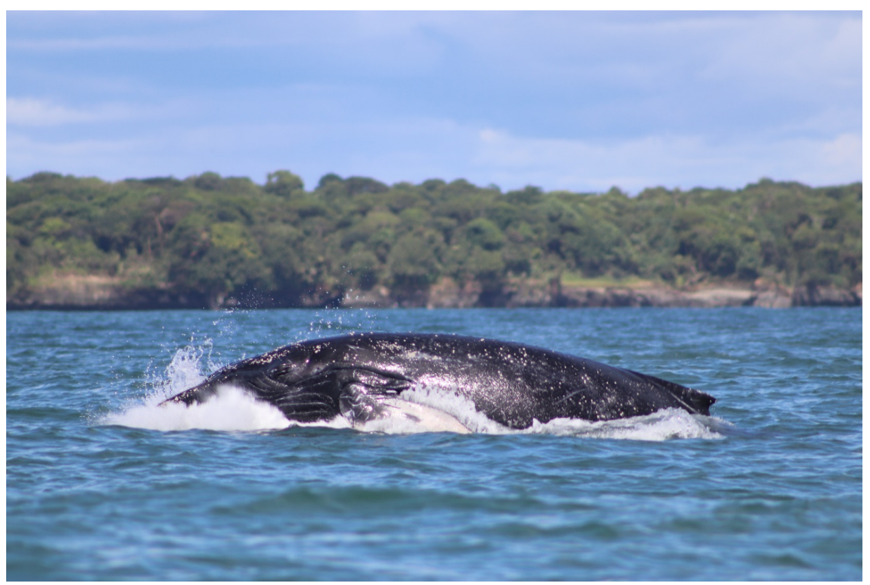
Currently I'm still doing the field phase here in Bahía Málaga, we have talked to the community and still getting the approbation of some of the afro descendant leaderships. We plan to make a workshop with the community to tell them the benefits (economic and environmental) of a responsible tourism.