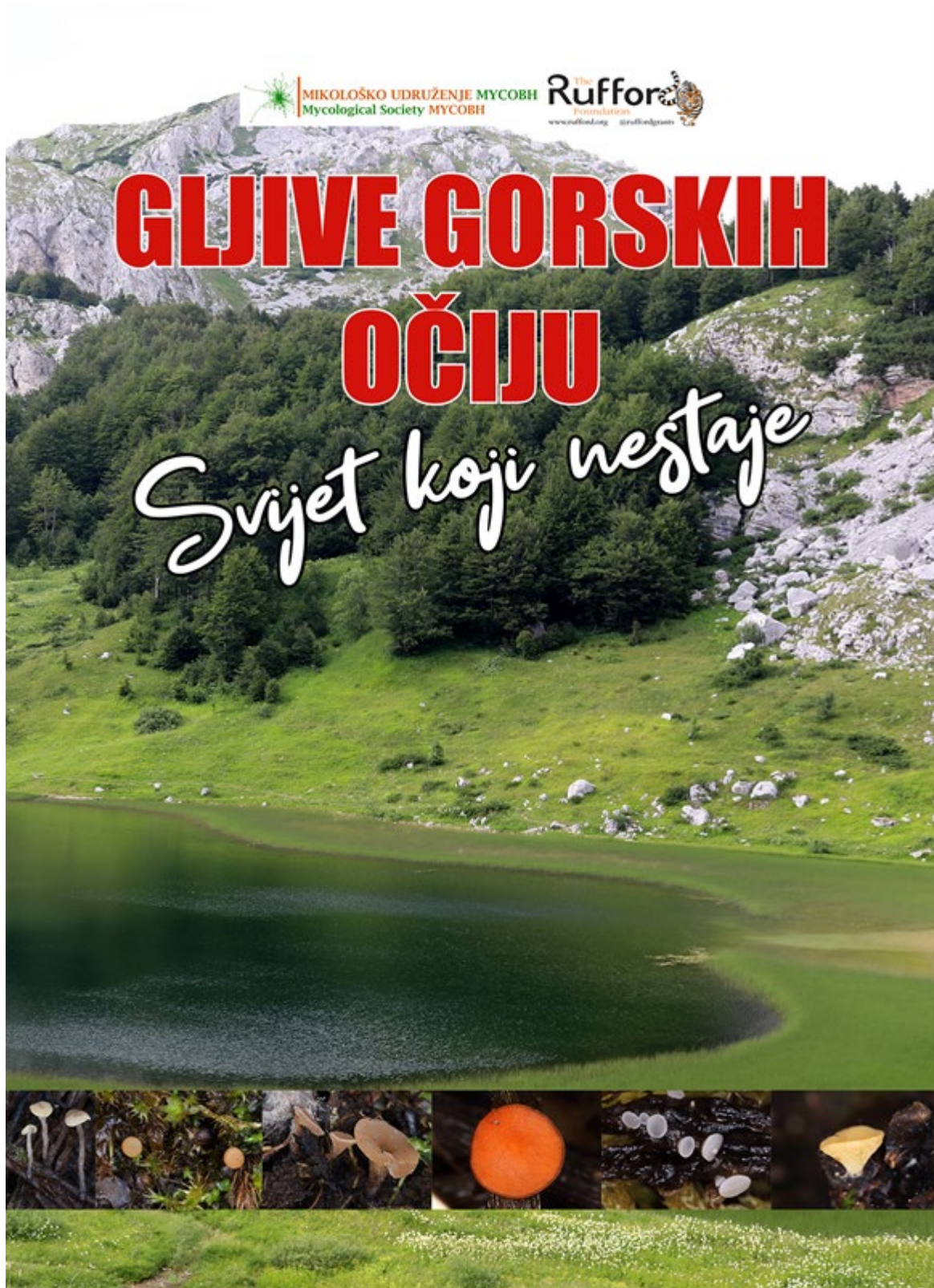
Front cover of the book "Fungi of the mountain eyes – The World that disappears".

What is for sure we will continue our passionate scientific work and try to discover more amazing fungal organisms hidden within small water oasis in the karst vastness.