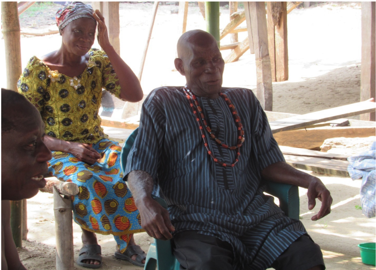
Image 1: Baale (Community Leader/Chief) of Sunmoge and his wife listening to the conversation