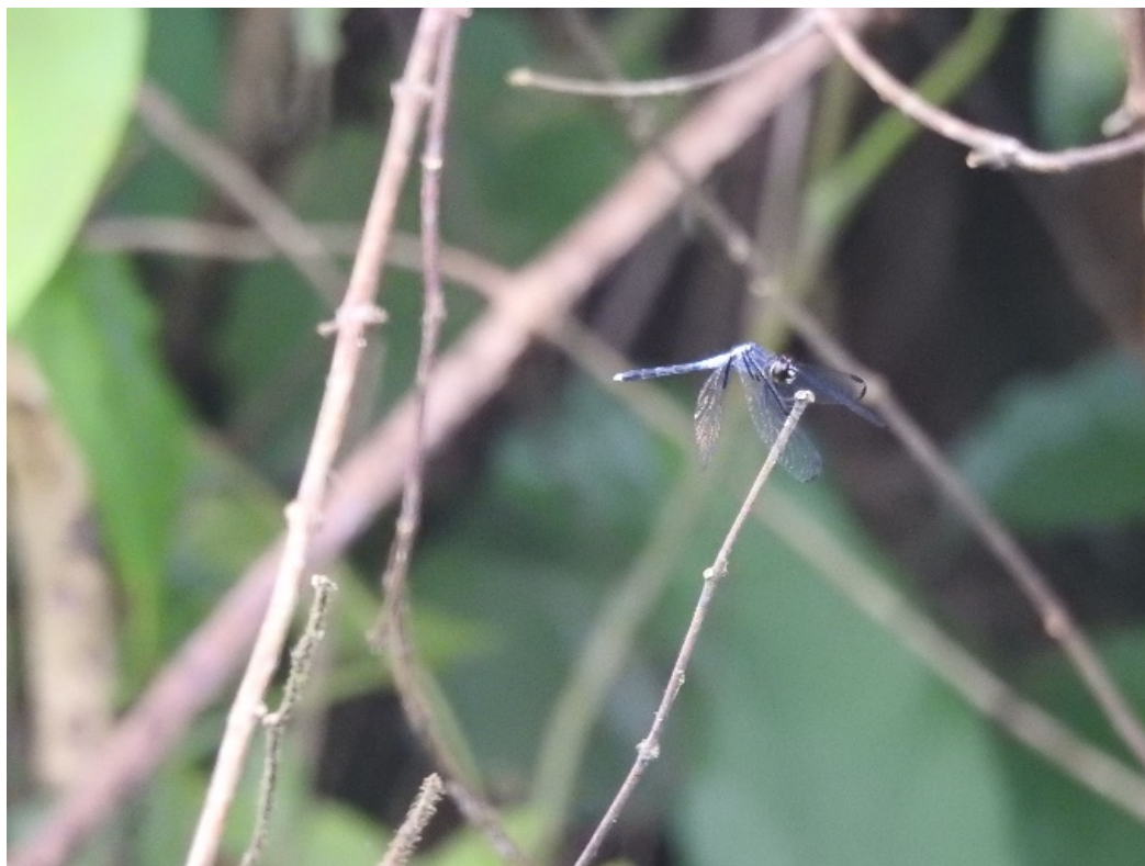
Figure 5. Thermochloria equivocate