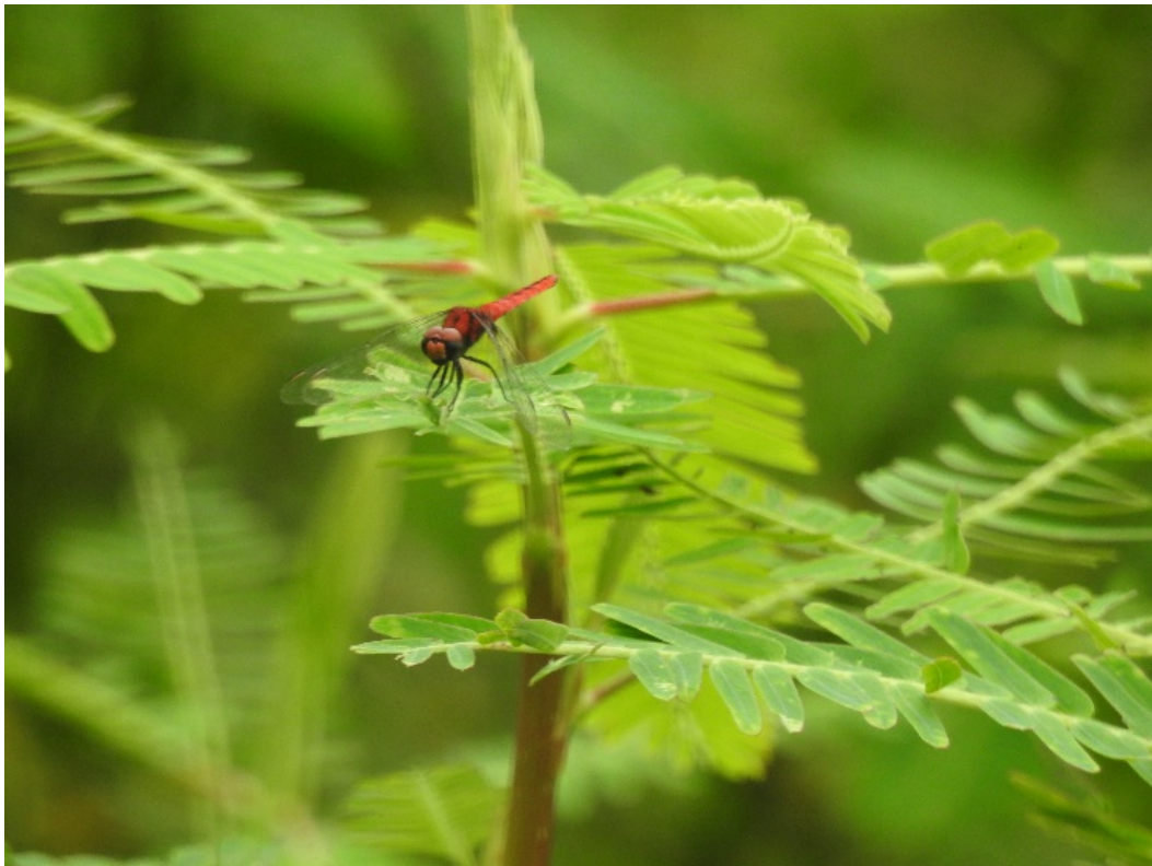
Figure 4. Crocothemis erythraea