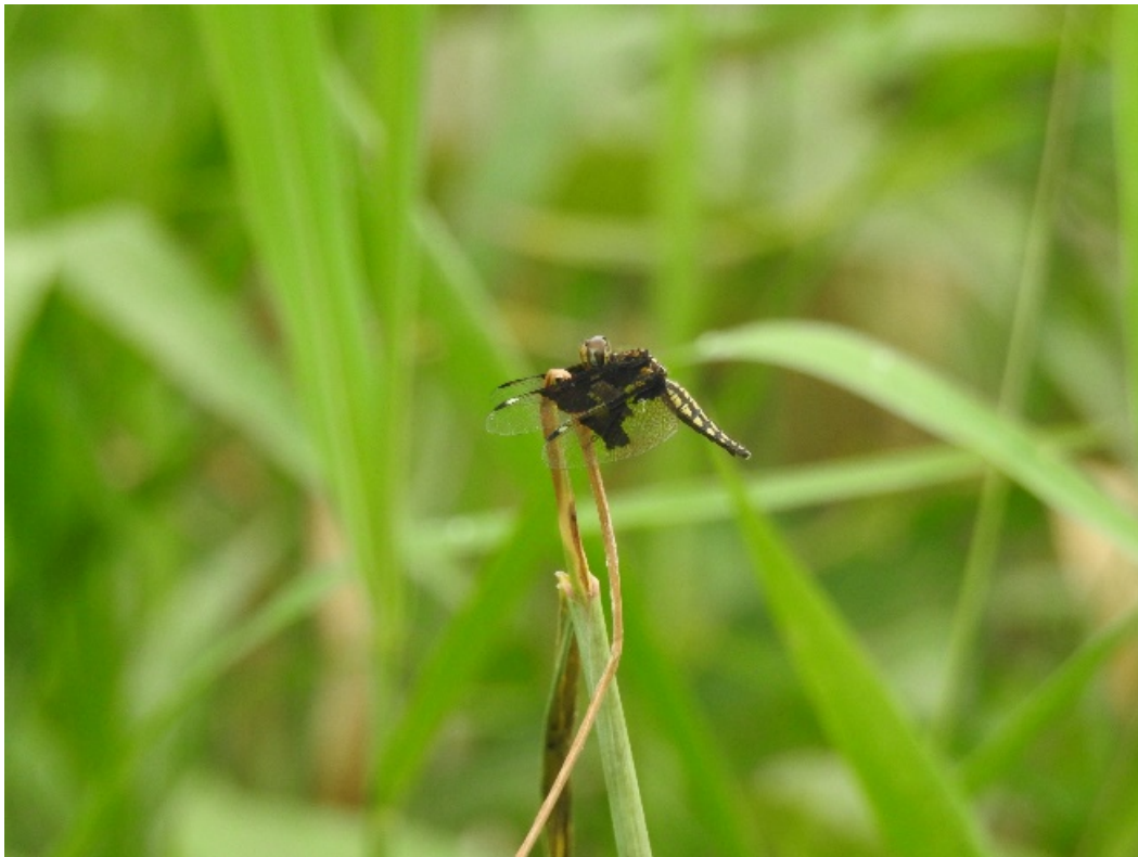
Figure 2. Palpopleura lucia (female)