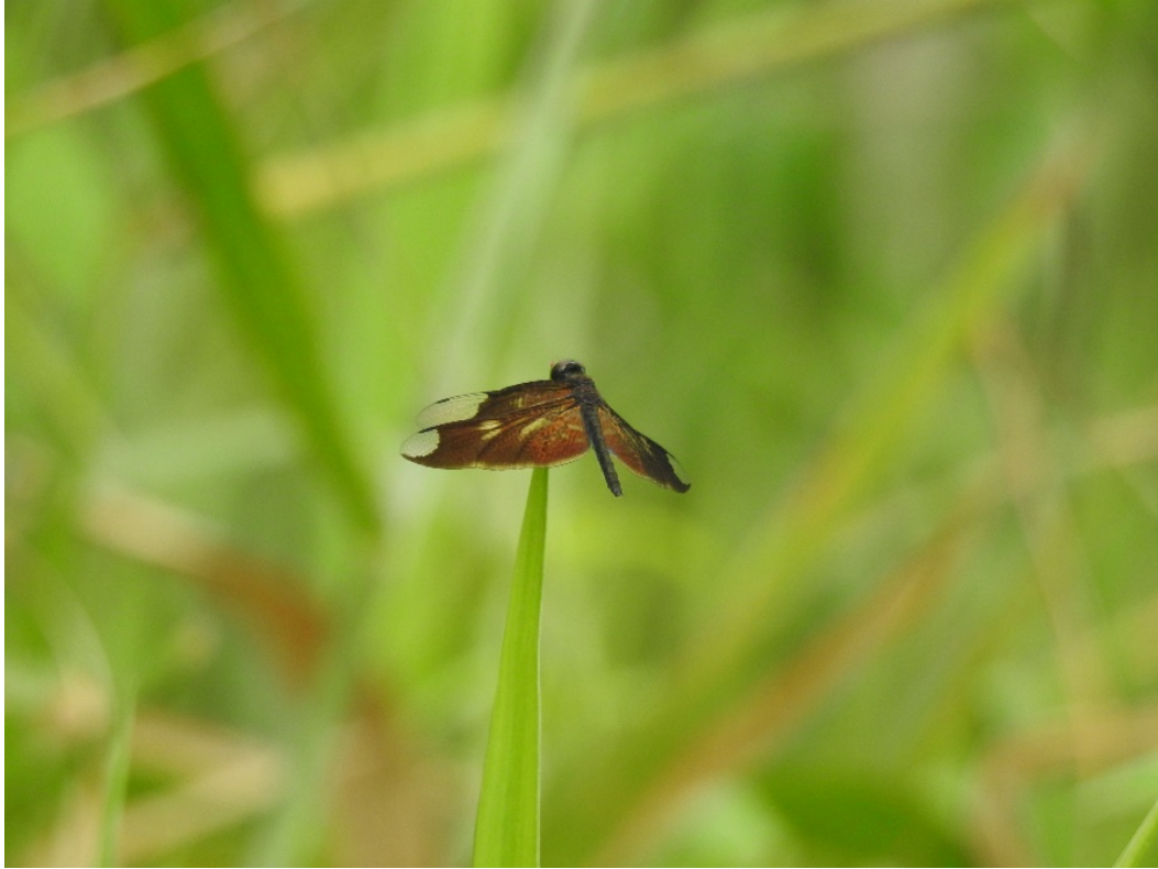
Figure 1. Rhyothemis notata