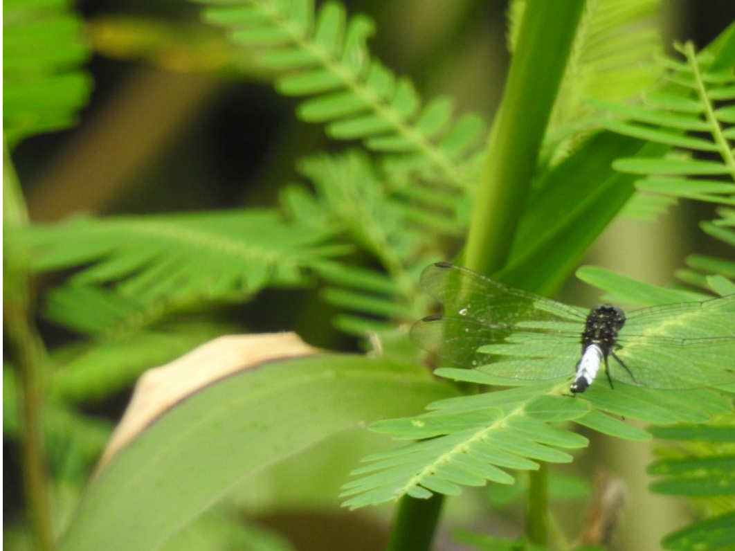
Figure 3. Acisoma trifoldum