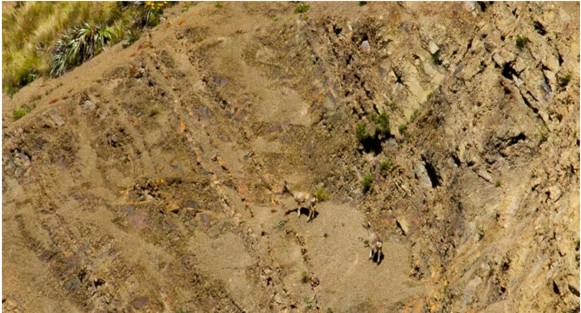
Supplementary material 3. Taruca male in Santa Ana.