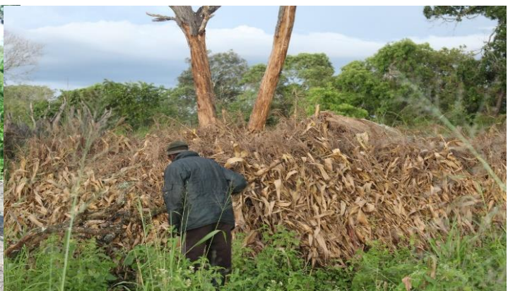
HARVESTING MAIZE BEFORE FULLY DRY AND PILING IN A SINGLE POINT TO REDUCE