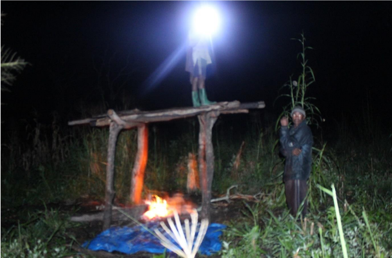
WATCHTOWER IN FARMS AND USING STRONG TORCHES