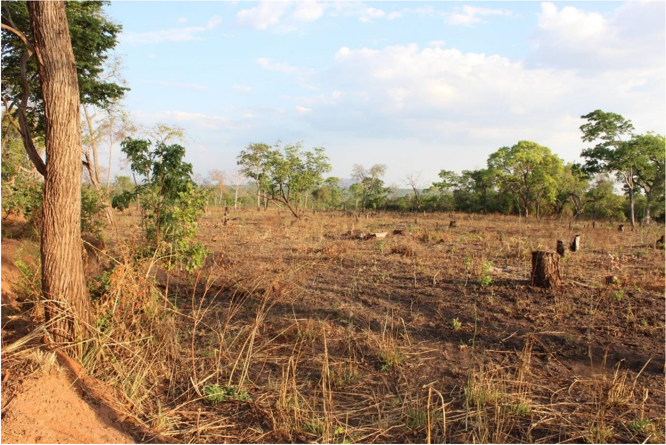
NEW FARMS RECENTLY CREATED