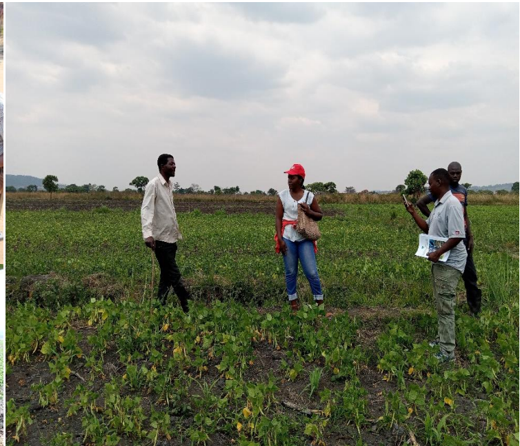
Part of the surveying team during data collection in three respective areas; Kabwe udachi, Kabwe camp and China villages