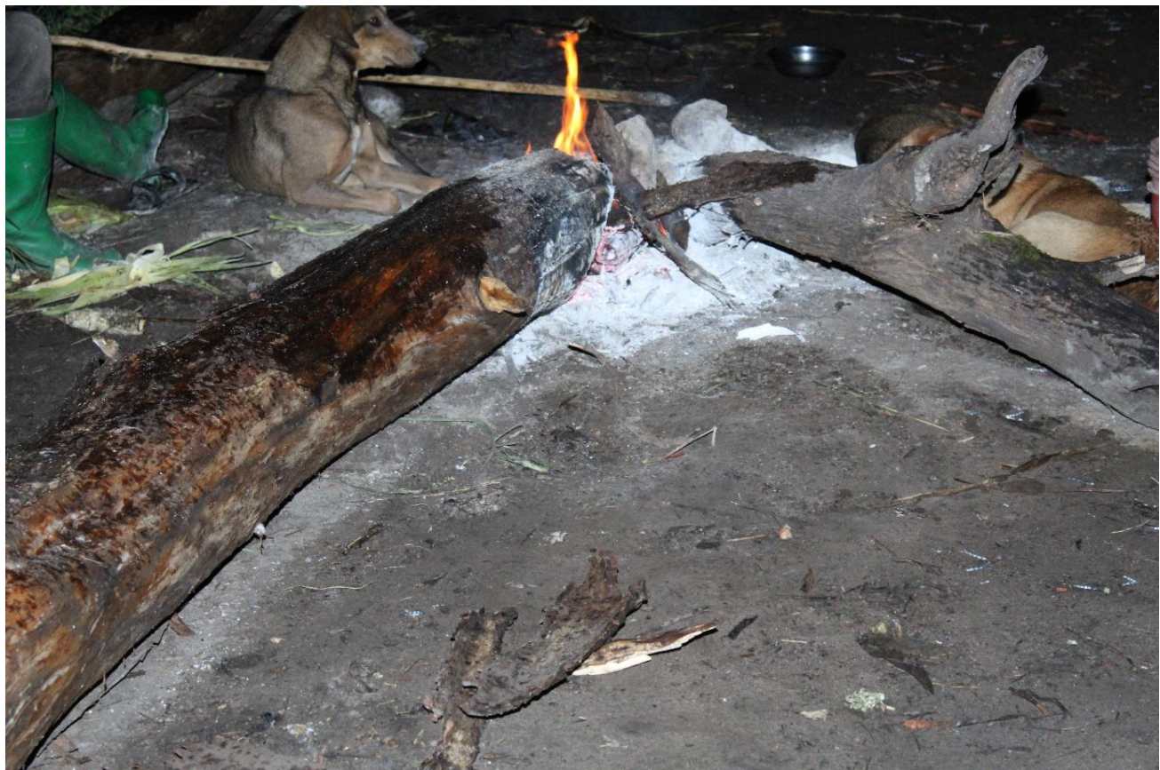
USING ANIMALS (DOGS) AT NIGHT