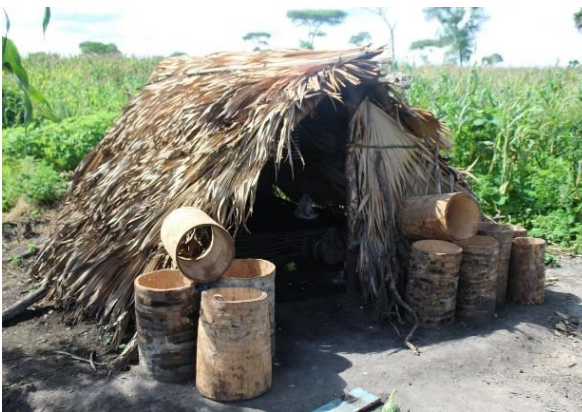
USING TEMPORARY CAMPS IN FARMS