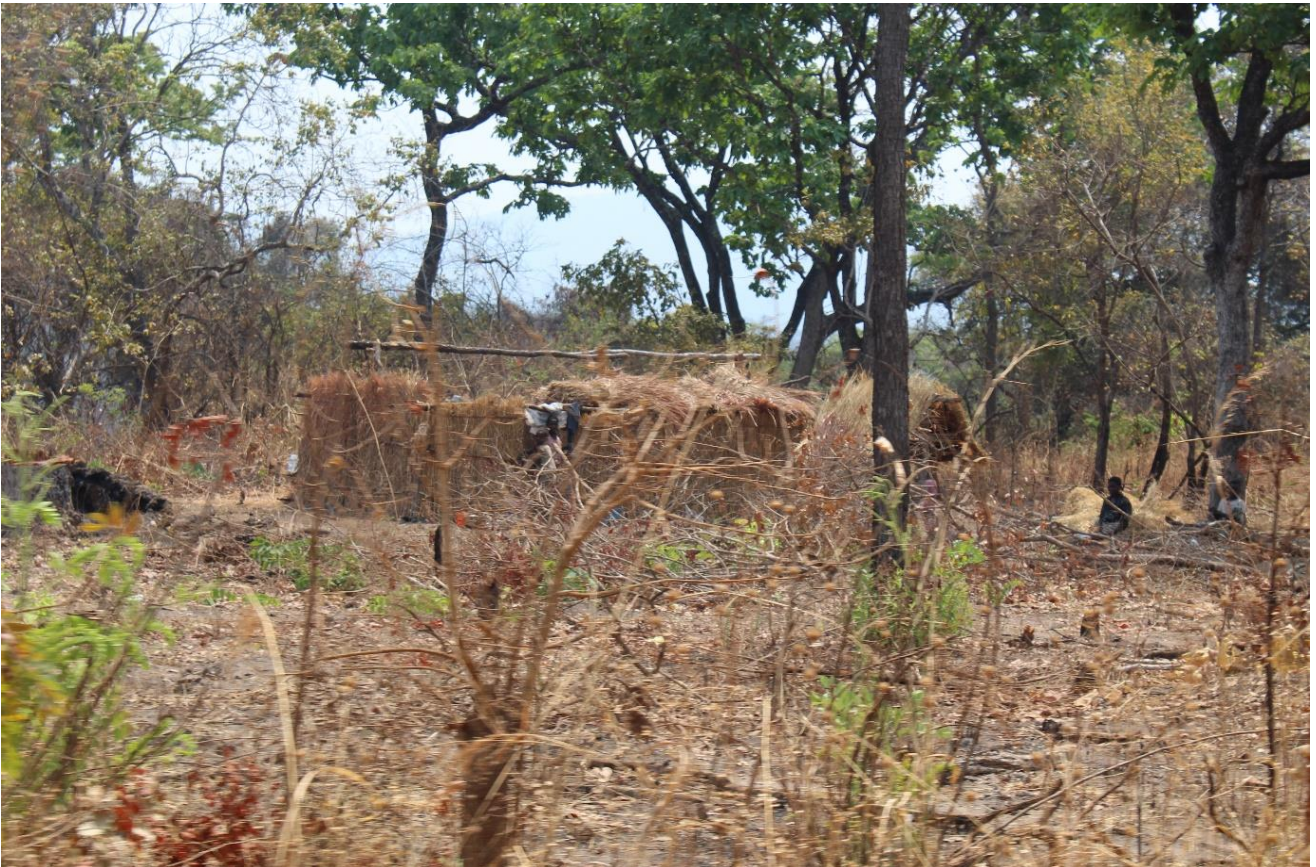
NEW TEMPORARY SETTLEMENTS ESTABLISHED ALONG THE LWAFI GR BOUNDARY