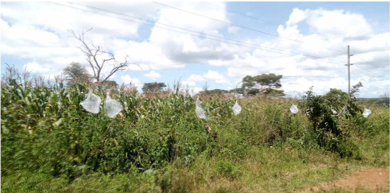
USING PLASTIC BAGS (FORMERLY USED FOR WATER PACKAGING) AND ATTACHED ON A LONG STRING ACROSS THE FARM