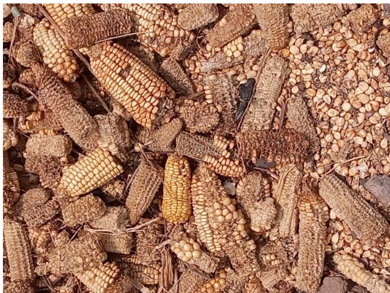
SOME MAIZE FORCED TO DRY CAPTURED IN ONE OF THE FARM CAMPS VISITED