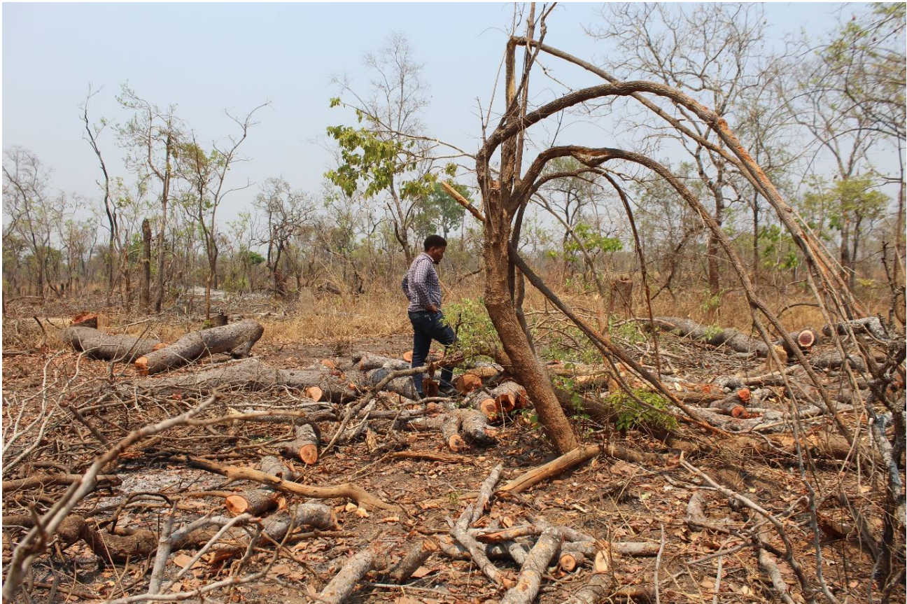
TREE FELLING FOR FIREWOOD