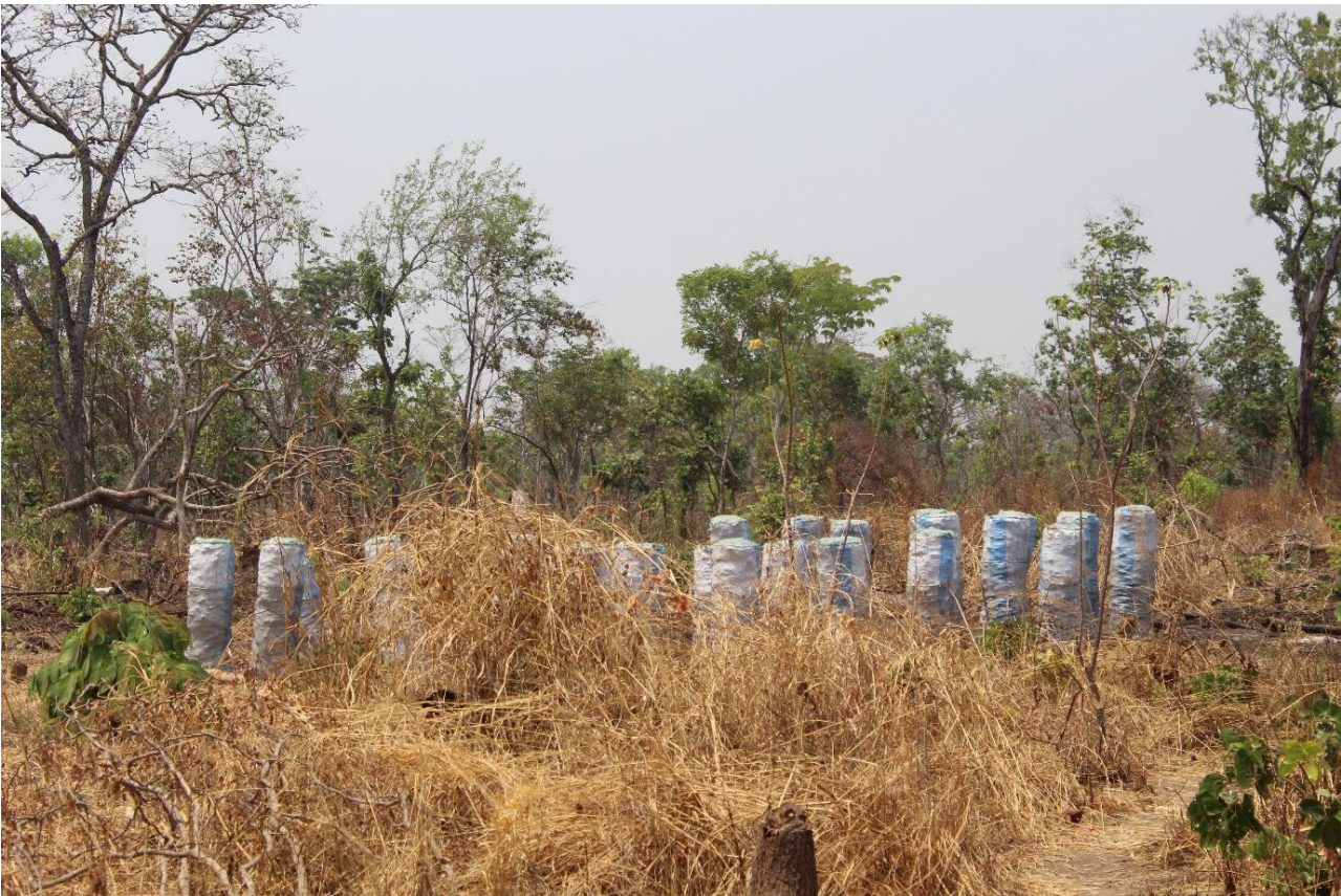
CHARCOAL MAKING ALONG THE LWAFI GR