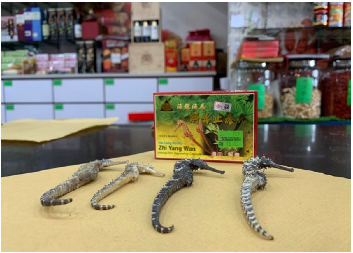
Dried seahorses ( Hippocampus comes ) and capsules of seahorse extracts being sold in a traditional Chinese medicine shop in Selangor.

Besides that, we had carried out the traditional medicine survey across Kedah, Penang, Perak, Selangor, Kuala Lumpur, Negeri Sembilan, Johor, Kelantan, Terengganu, and Pahang through interviews with a total of 92 Malay, 32 Chinese, and 10 Indian traditional medicine practitioners as well as 228 traditional Chinese medicine shop traders in the field and remotely.