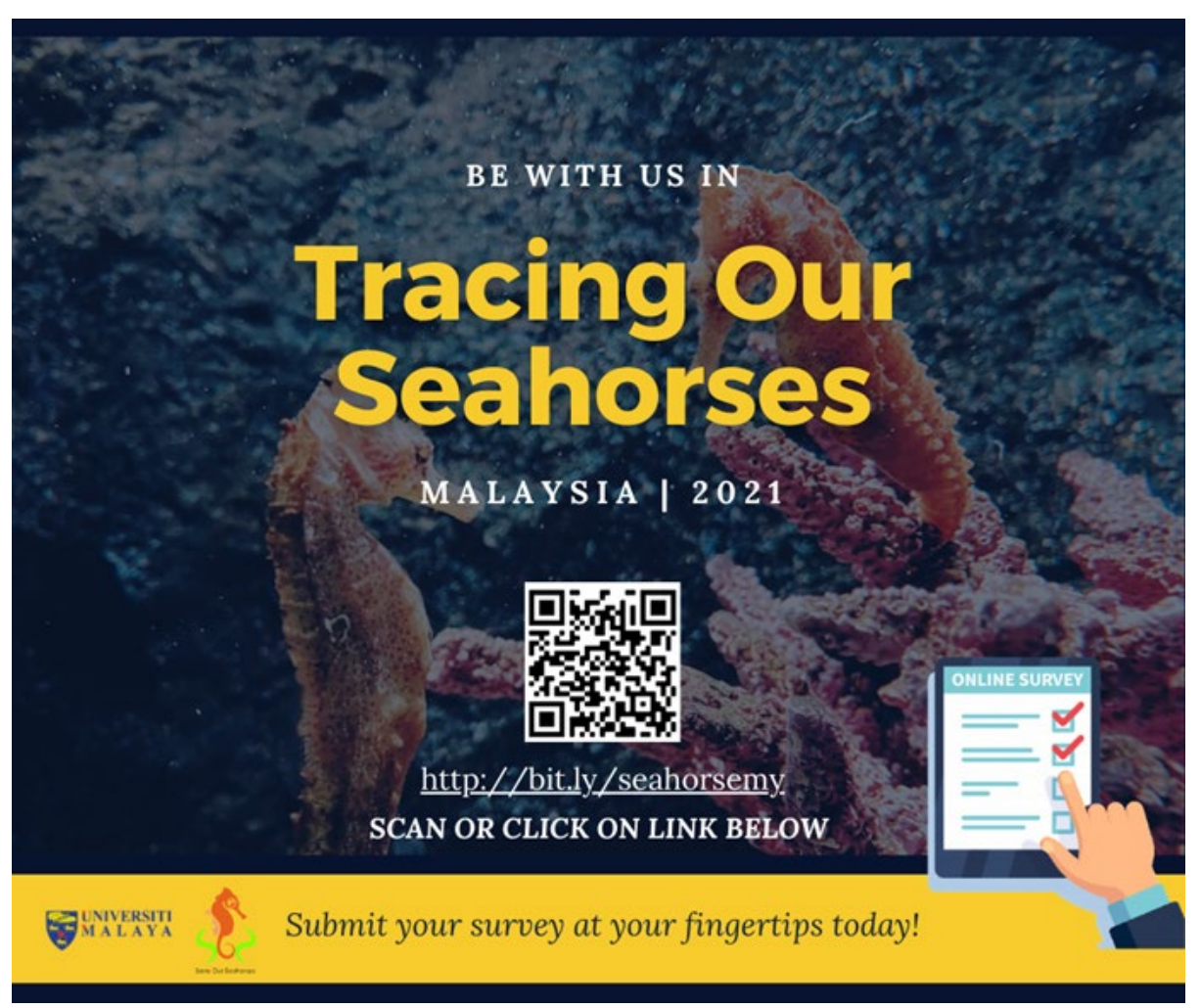
Public survey launch poster

Our project has also been featured in various news platforms, radio stations, and media companies, such as: