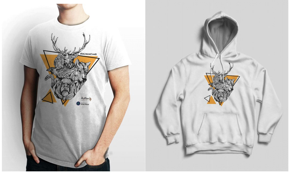
Design by: Dimitrija Savić-Zdravković

Part of the promotional material was prepared and printed at the beginning of the project with an already recognizable project design.