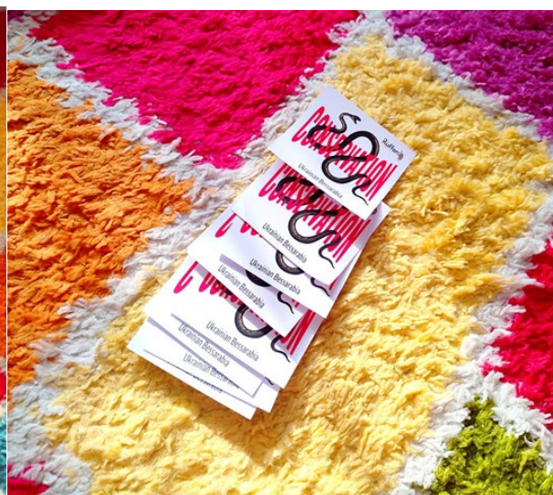
The logo, stickers and T-shirts our project