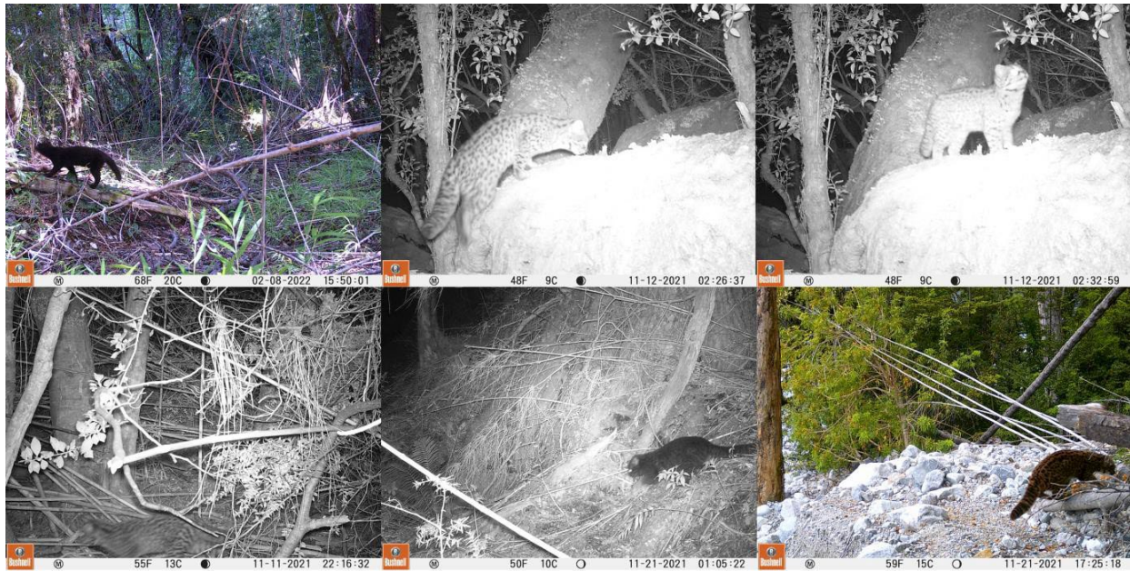
Figure 3. Pictures of kodkod Leopardus guigna taken in several CTs in Menéndez Lake, Los Alerces National Park.