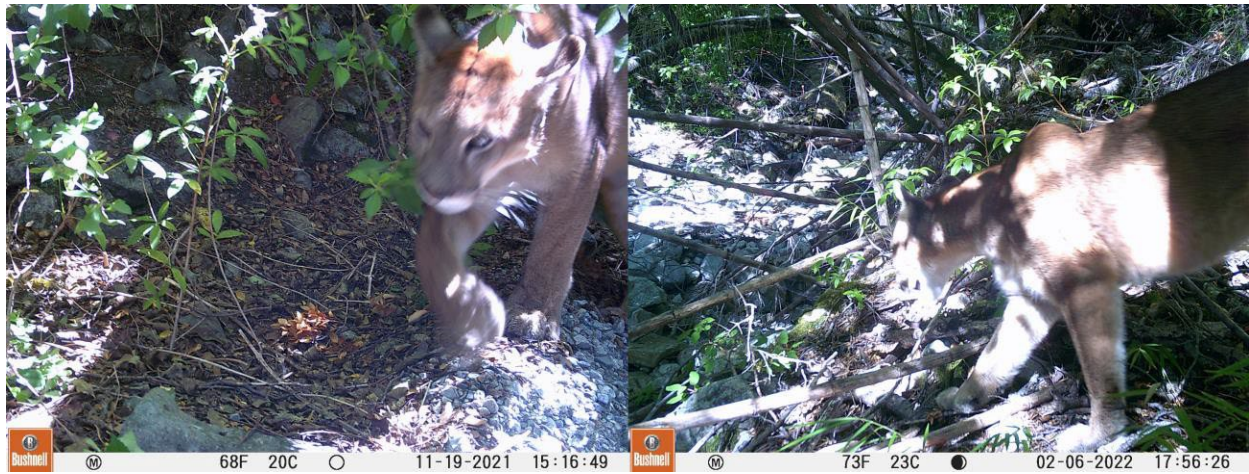
Figure 5. Picture of puma Puma concolor , in Menéndez Lake, Los Alerces National Park.