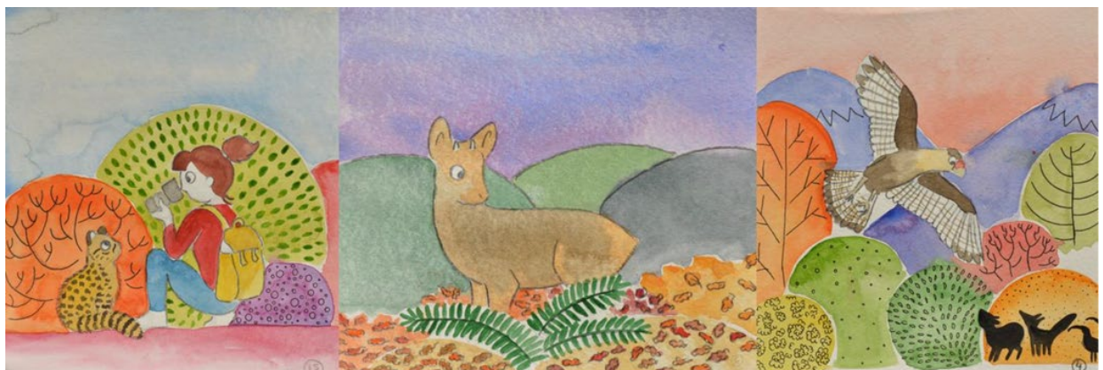
Figure 8. Drafts of the graphic novel about kodkod.

We are currently working with the graphic novel about kodkod. We have several drafts (Figure 8) and a main text, that we hope to finish in the coming months. We also begin to acquire budgets to press the novel.