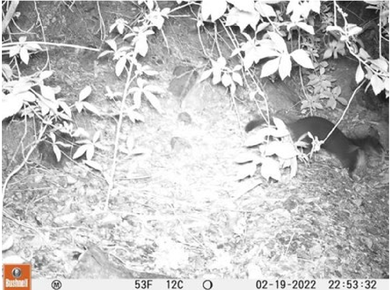
Figure 7. Picture of introduced American mink Neogale vison , in Menéndez Lake, Los Alerces National Park.