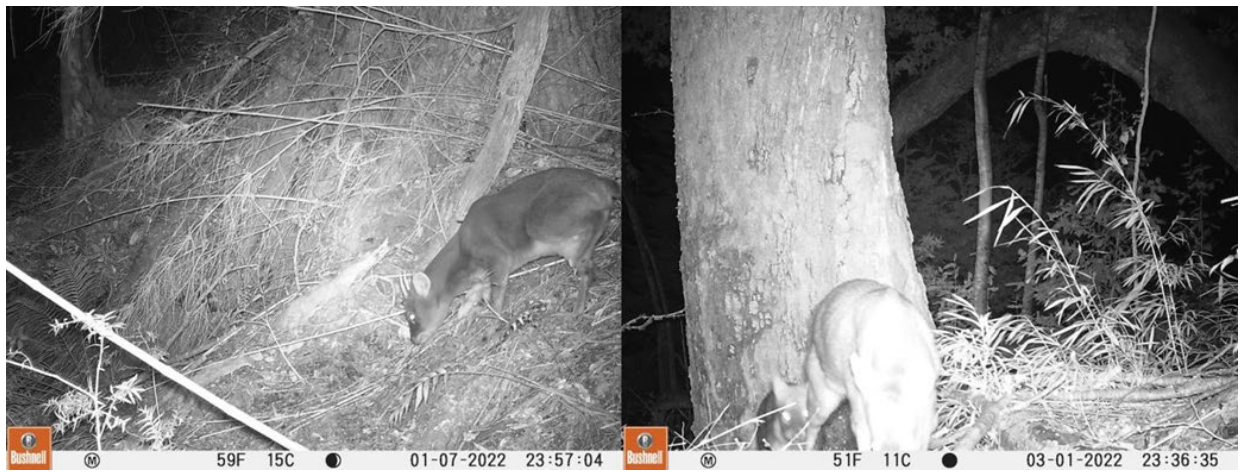
Figure 4. Pictures of pudu Pudu puda in Menéndez Lake, Los Alerces National Park.