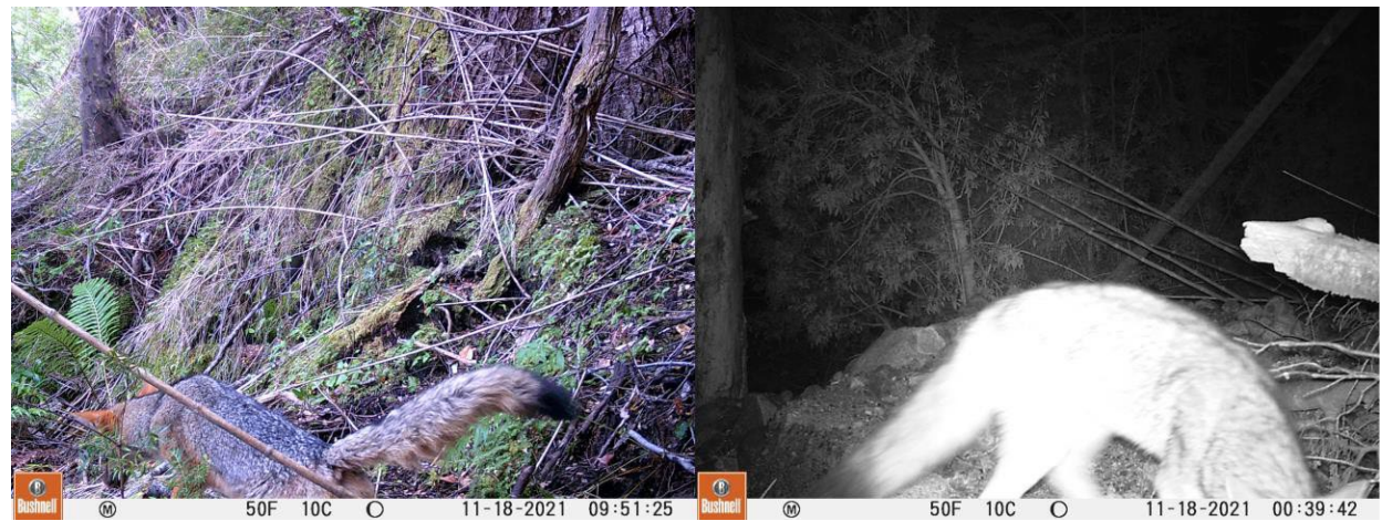
Figure 6. Pictures of Andean fox Lycalopex culpaeus , in Menéndez Lake, Los Alerces National Park.