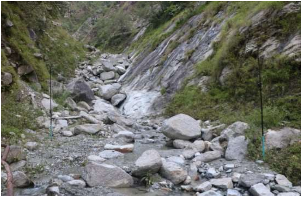
Figure 2: Mist-net deployed on a stream in Khimti Bajar, Ramechhap