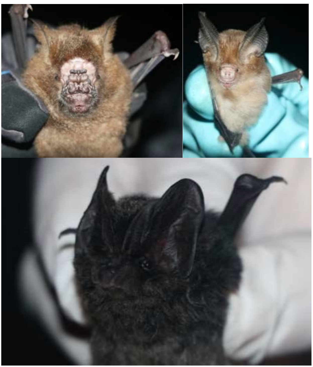
Figure 5: Bats captured during the first phase of the project; Hipposideros armiger (Top left), H. gentilis (Top right), Barbastella darjeelingensis (Bottom)

ground to avoid echoes from the ground and other surfaces. The Echo Meter Touch 2 Pro was also operated on an Apple iPhone 11 inside bat roost to detect the presence of different bat species.