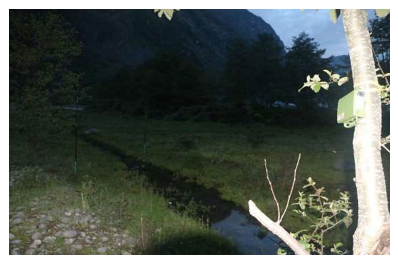
Figure 3: Mist-net and a Song Meter Minibat deployed over a stream in Lamabagar, GCA, Dolakha