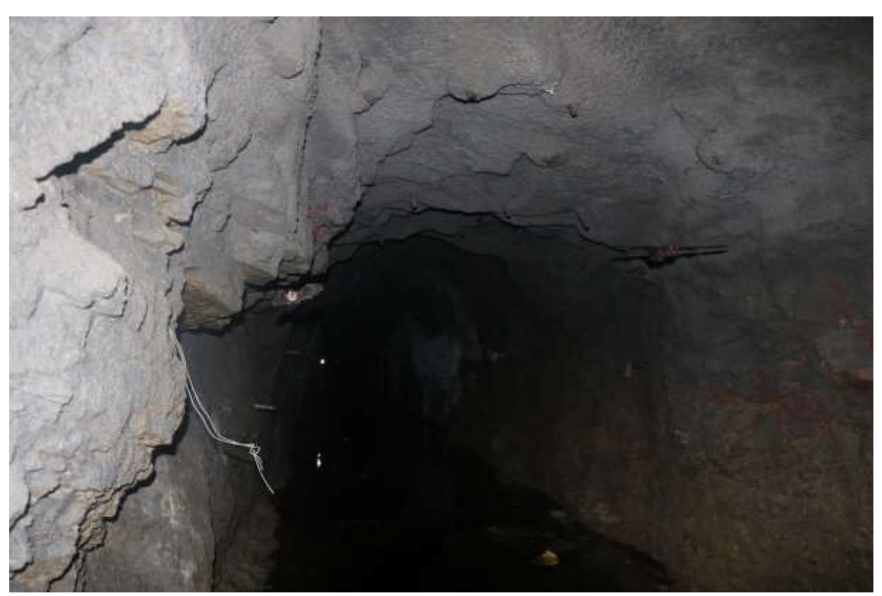
Figure 4: A hydropower testing tunnel serving as a roost for Hipposideros gentilis and H. armiger, Dolakha