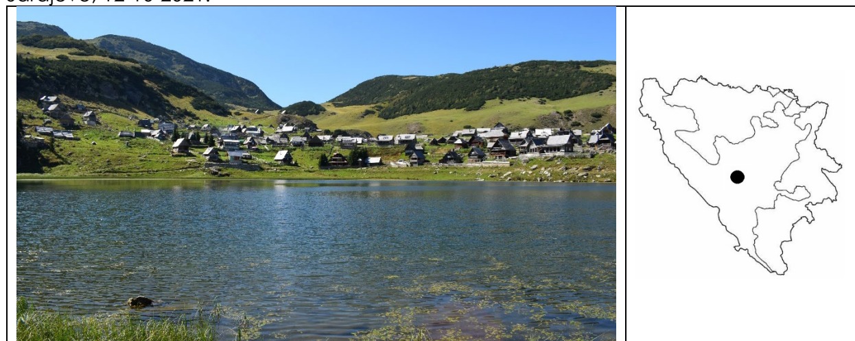
Figure 1. Prokoško lake (Vranica mountain)