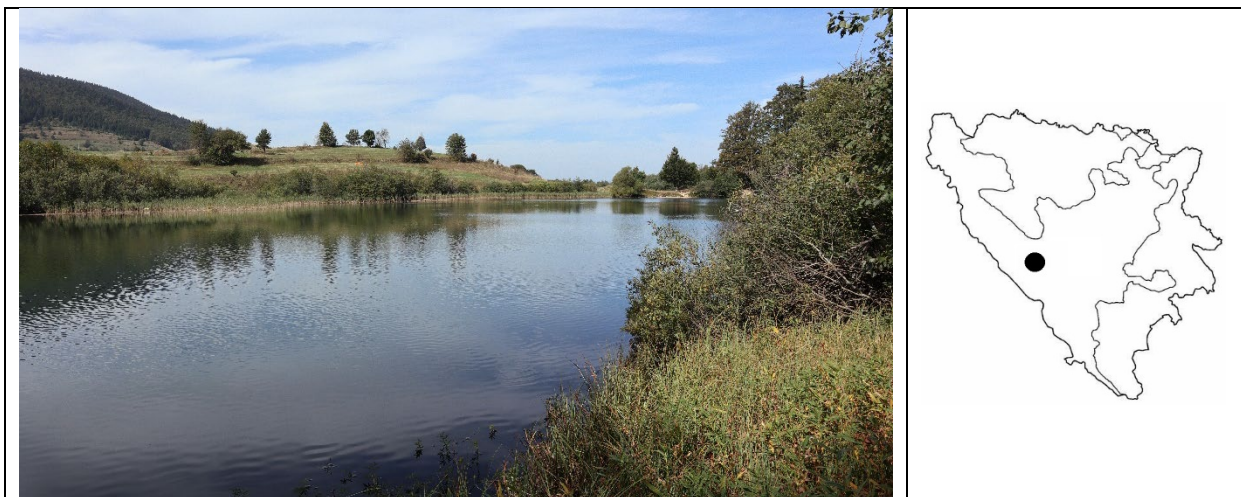
Figure 3. Kukavičko lake (Kupres)