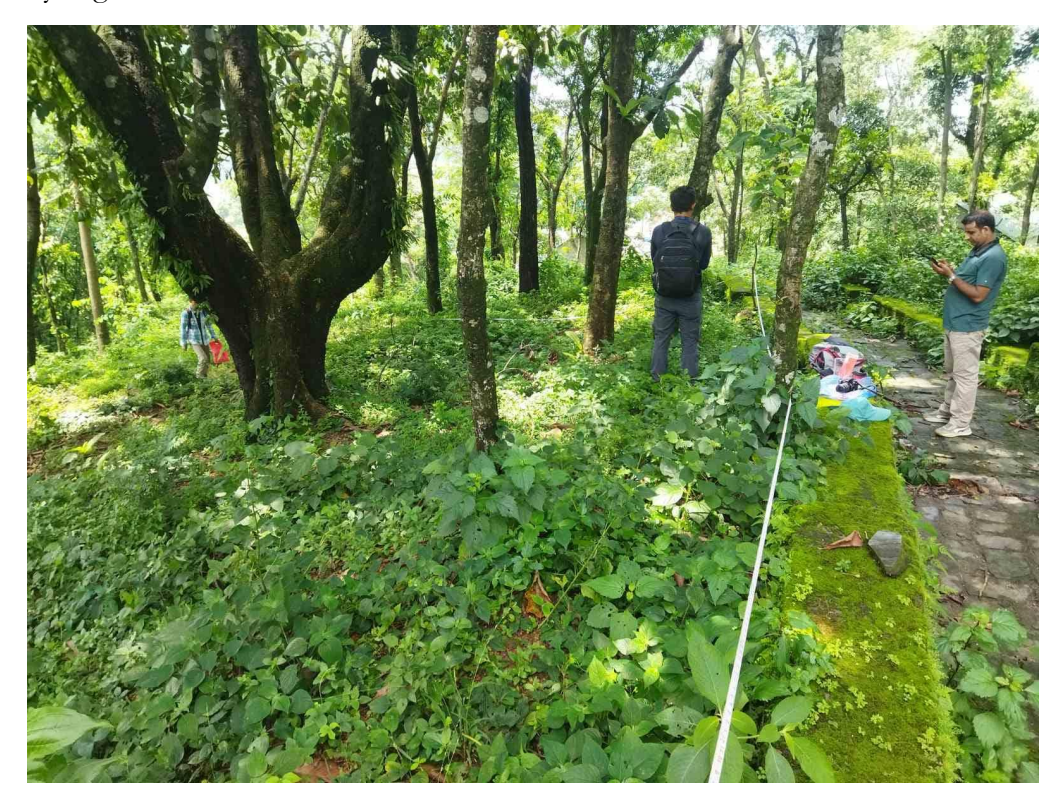
Fig. 4. Vegetation survey being conducted by field team

canopy cover and Diameter at Breast Height (DBH) were also recorded from each sample plot before analyzing the data.