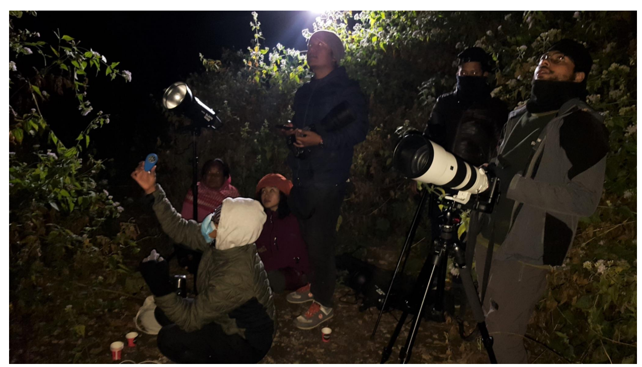
Fig. 2. Project team trying to capture bats feeding on chiuri

One location was finalized after verifying with the locals that bats were observed after dawn. The selected location wasn't too far from the settlement area and the chiuri trees had enough flowers for bats to feed all night. 3 high-resolution cameras were positioned 45 degrees under the tree, focusing on three different bunches of chiuri flowers. 2 Ample lighting with adjustment features were used to increase and decrease brightness whenever necessary and were placed in two positions under the tree. After a couple of unsuccessful nights, torch lights were also used to spot bats when they arrived around the flowers and flashed when they would hang on the branches to capture the image or video.