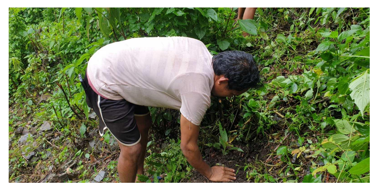
Fig. 5. Chiuri sapling plantation being conducted with CFUG members

A total of 100 saplings of Chiuri were planted in different community forests within the project area. CFUG members actively took part in the plantation process and care for these saplings was handed to them.