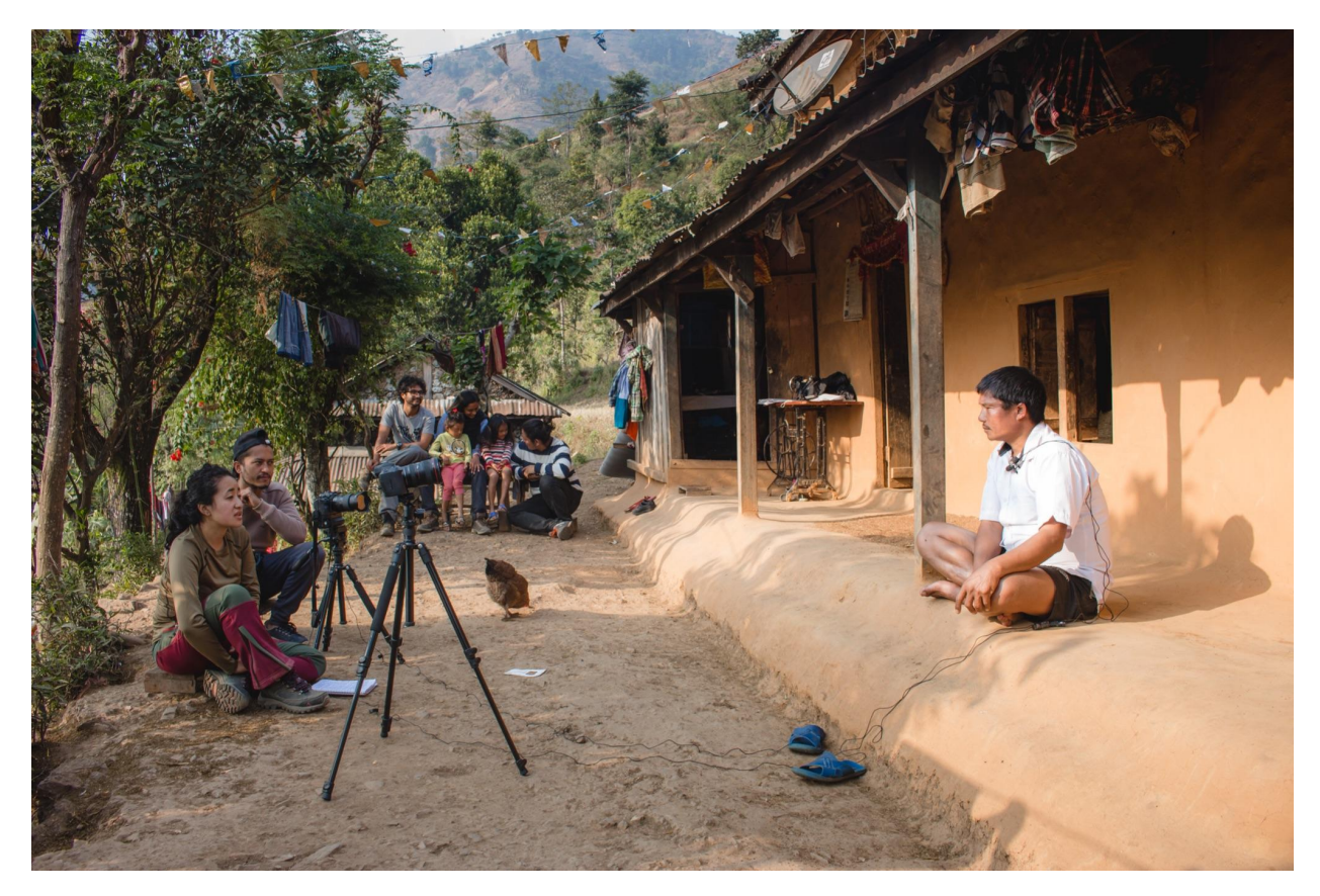
Fig. 3. KII being conducted with local informants

Based on the review of previous study, existing literature, input from community collaborative and experts, a semi-structured draft questionnaire was developed. KII was then performed with 9 individuals from different backgrounds, including bat researcher, local Chepang community members, local government representatives and beekeeping experts. Interviews were taken in their preferred premises (office, home, place of business) and were recorded through audiotape and digital cameras. The recordings were all reviewed and transcribed to point out a few KII Codes for reference. Based on the codes recurring themes were identified in each interview along with passages that represented the sentiments of the interviewee.