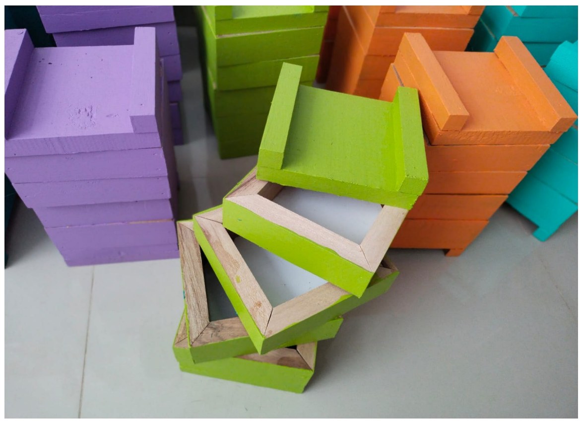
Design of boxes for bees that will be installed in the meliponario.