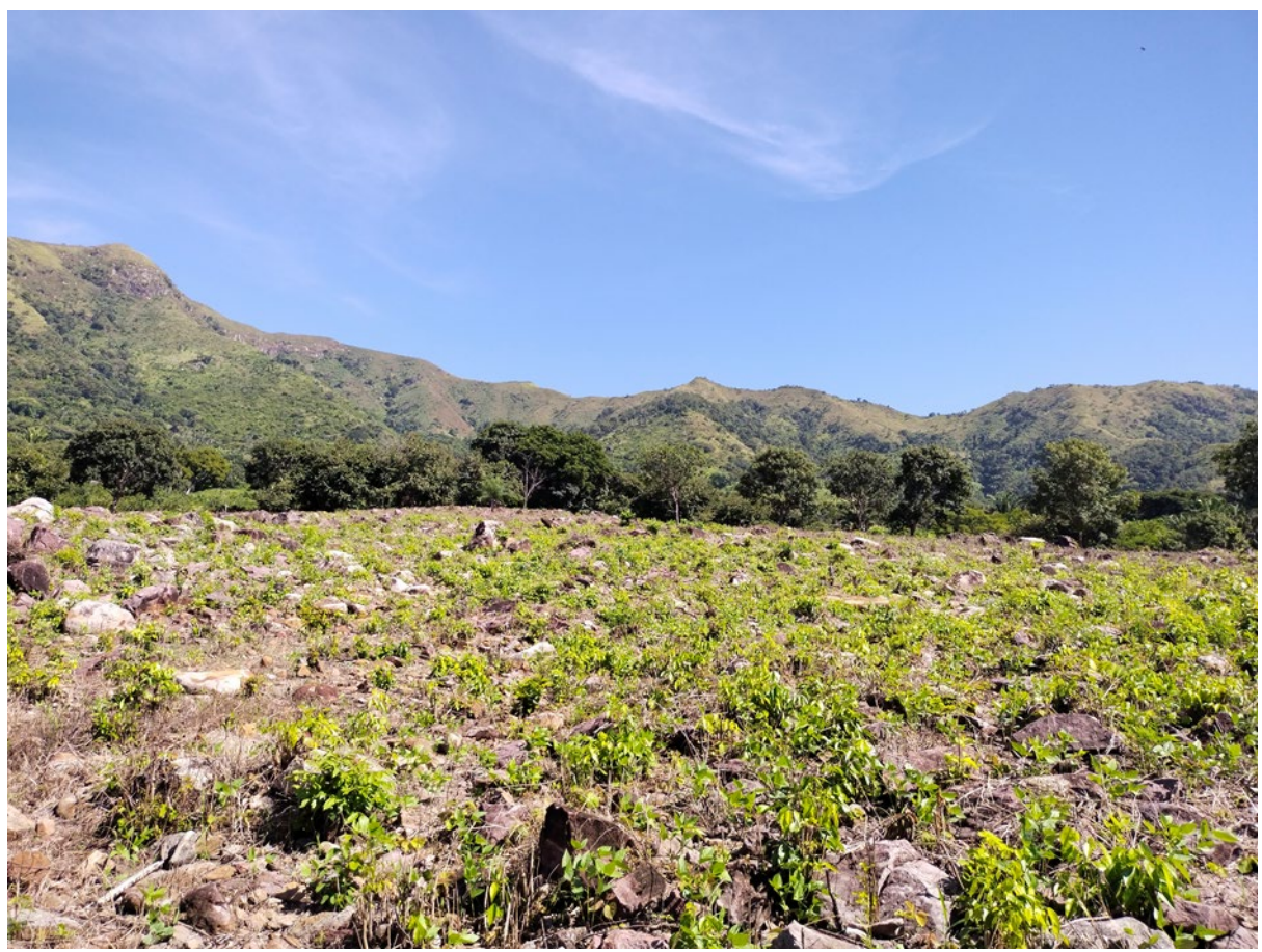
View of the Uraku Foundation Reserve.

We are in the design and layout phase of the image of the Meliponary of the URAKU Foundation Reserve, as well as the informative material that will be used in the training activities with the students of the educational institution and the community in general.