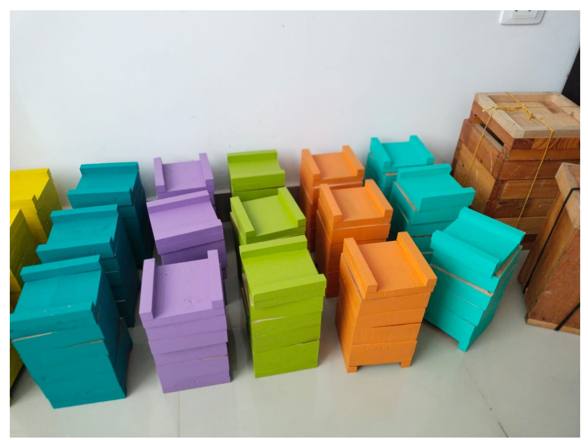
Customization of boxes for bees for the creation of the Meliponary of the Uraku Foundation Reserve.