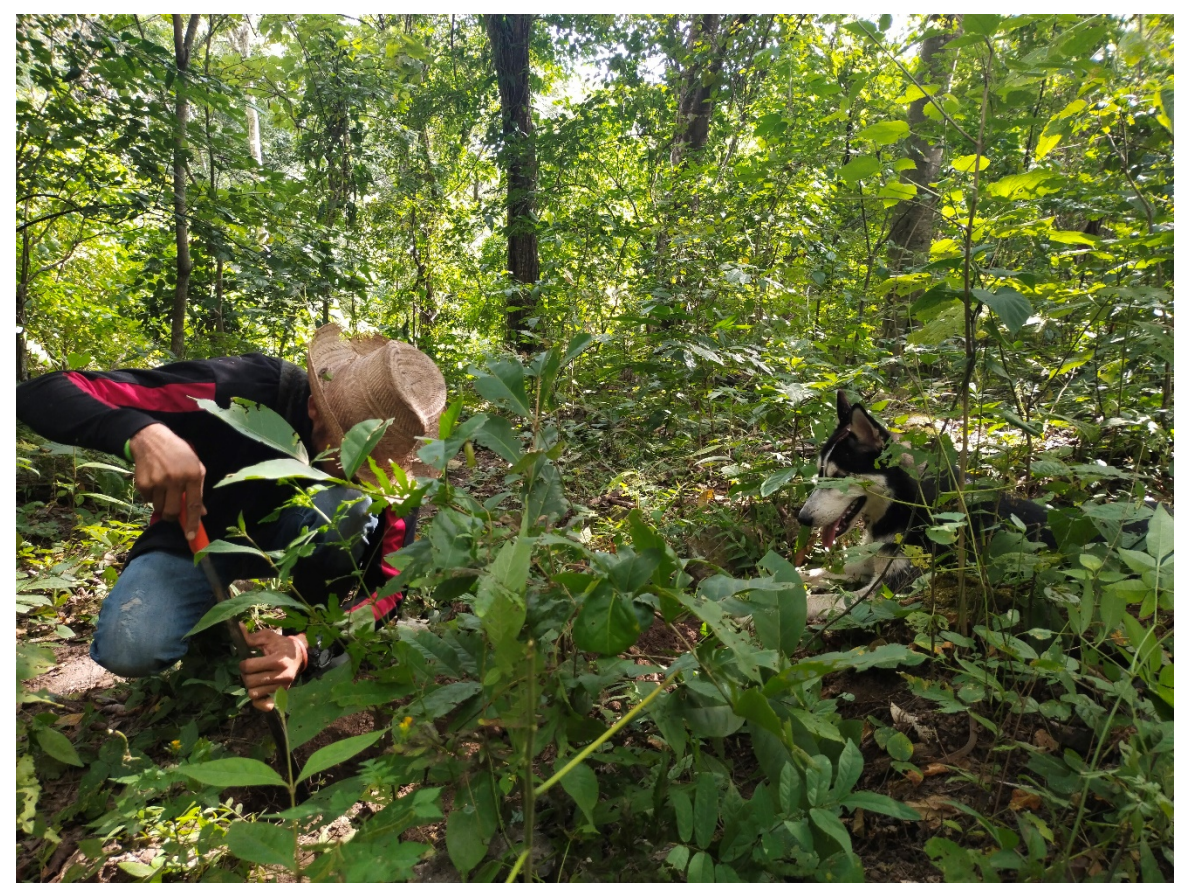
Collection of soil samples.