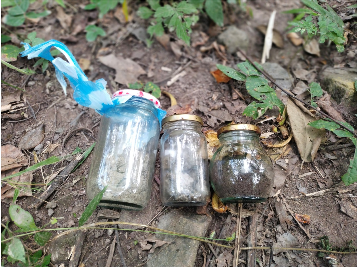
Soil samples collected in places where the installation of the Meliponario is projected.