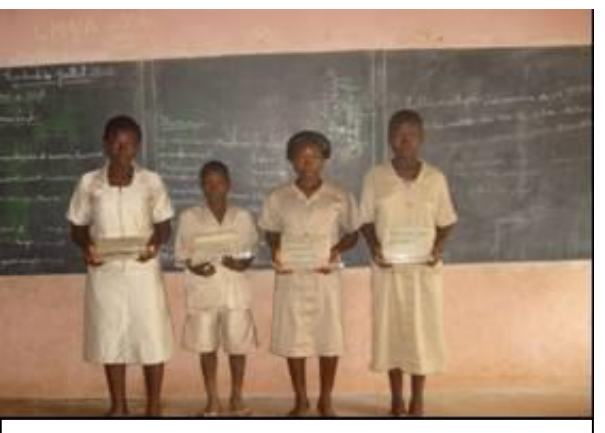
Photo 4. Four winners (one boy and 3 girls) receive their prizes after the contest at Kpomè