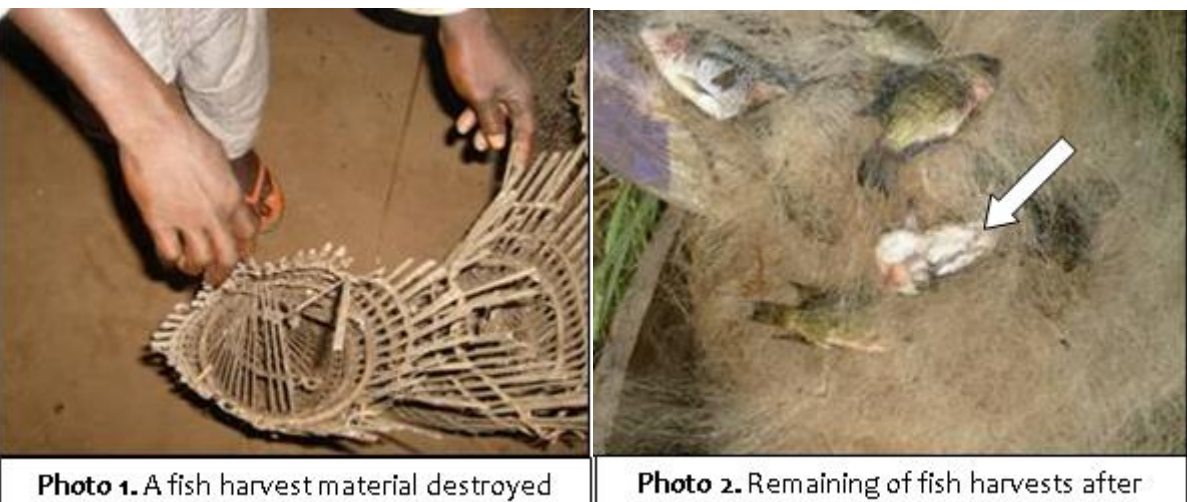
by otters at Hon