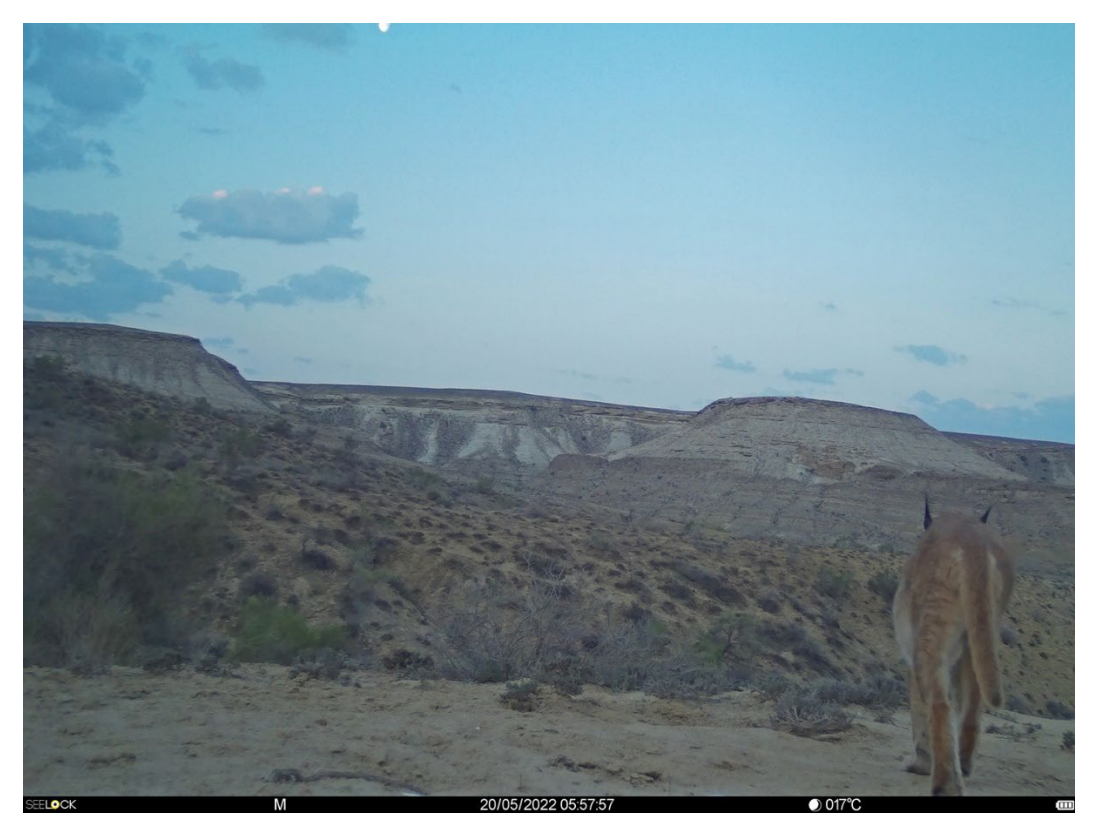
3. Caracal Caracal caracal occurs in the Mangistau region of Kazakhstan in the very north of its extensive range. Our observations of the past years confirmed the breeding of the caracal in the territory of Ustyurt Nature Reserve. The species is included in the Red Book of Kazakhstan. Status in the IUCN Red List 3.1 - Least Concern.

2. Egyptian vultures Neophron percnopterus fighting over prey. These birds are the most common species of scavenger birds on the territory of Ustyurt Reserve. According to past estimates, up to 8 pairs of this species may inhabit the area. The species is listed in the Red Book of Kazakhstan. Its status is IUCN Red List 3.1 - Endangered.