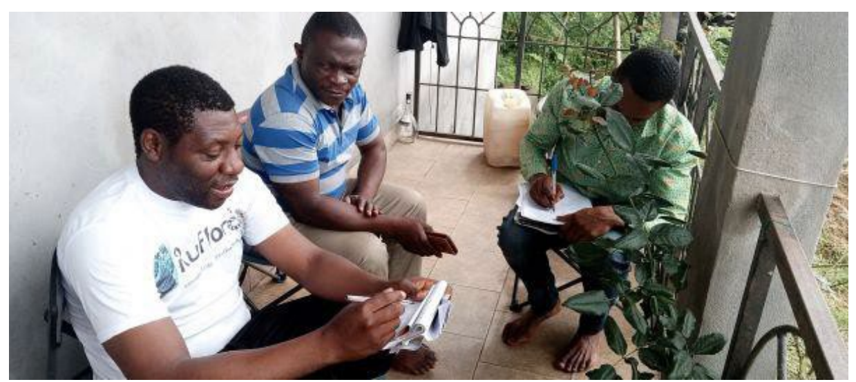
Fig1. Questionnaires survey

In June 2022, we carried out the questionnaire survey in different villages around the Mount Cameroon National Park to determine the local ecological knowledge about the endemic Mount Cameroon francolin. This survey permitted us to have an idea on the important areas of Mount Cameroon where the francolin can be found. We also trained our field assistants on francolin monitoring techniques (using call playback) and how to distinguish the Cameroon francolin from other francolin species. Thanks to these acquired new skills, they will be very useful to us during the next monitoring programmes given that the breeding biology and the ecology of the Mount Cameroon francolin are not yet studied.