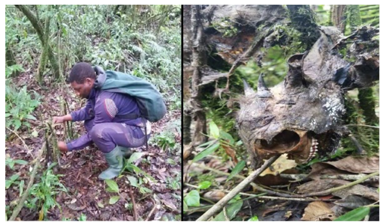
Fig6. A: Removing of the wire trap.