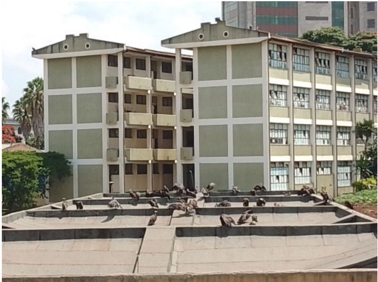
Fig 6: Hooded vulture perching on building of car station in Jimma University (Main campus)