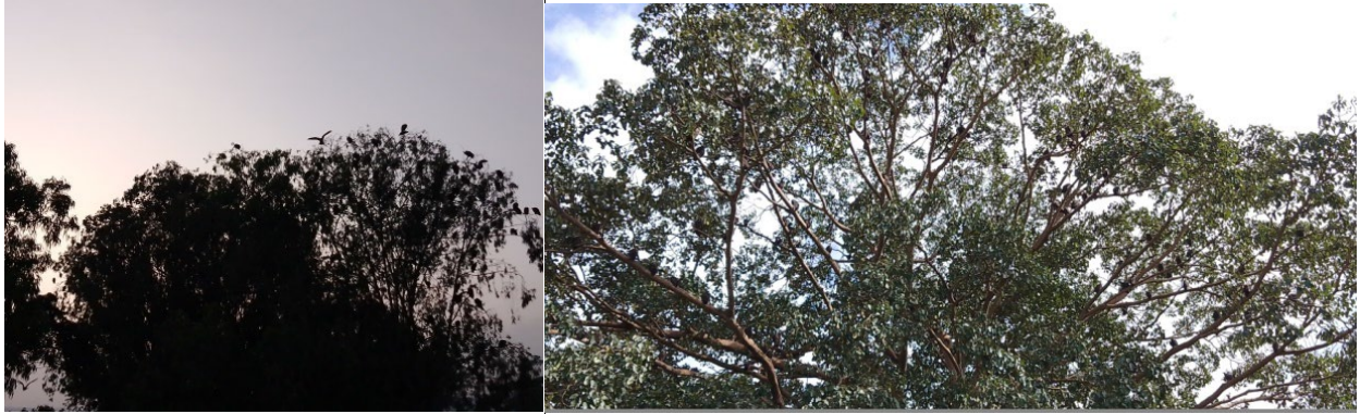
Fig 7: Among very common overnight and day roost trees (the Eucalyptus species and Ficus species respectively) for hooded vulture in study areas