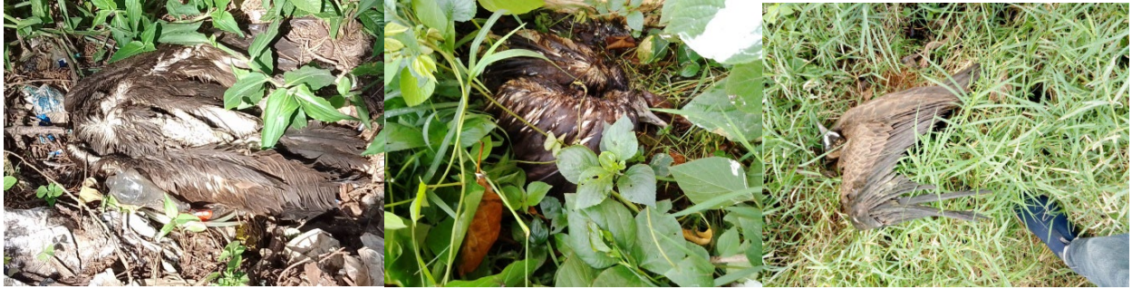
Fig 5: Two Dead bodies of adult hooded vulture at Jimma University roost site and feed site and one fresh dead juvenile at Bonga University dumpsite respectively