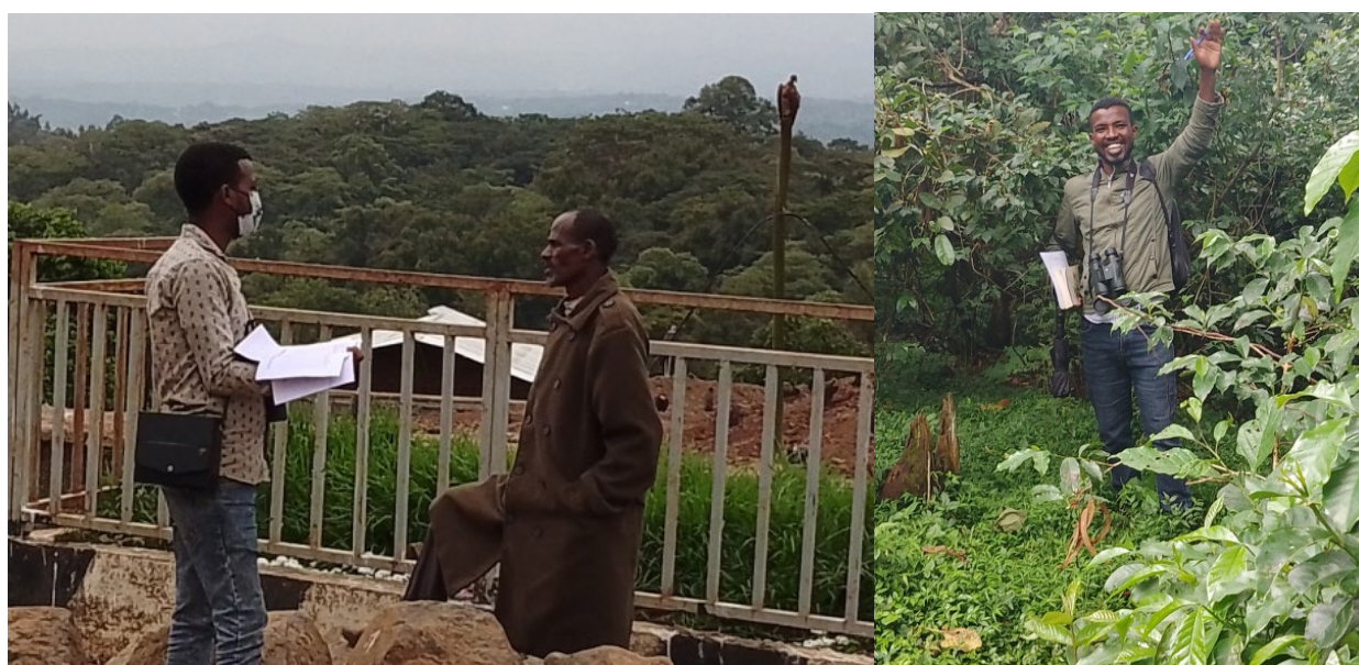
Fig 3: while asking Abattoir guard for basic correction about vulture daily movement and searching for additional roost site near dump