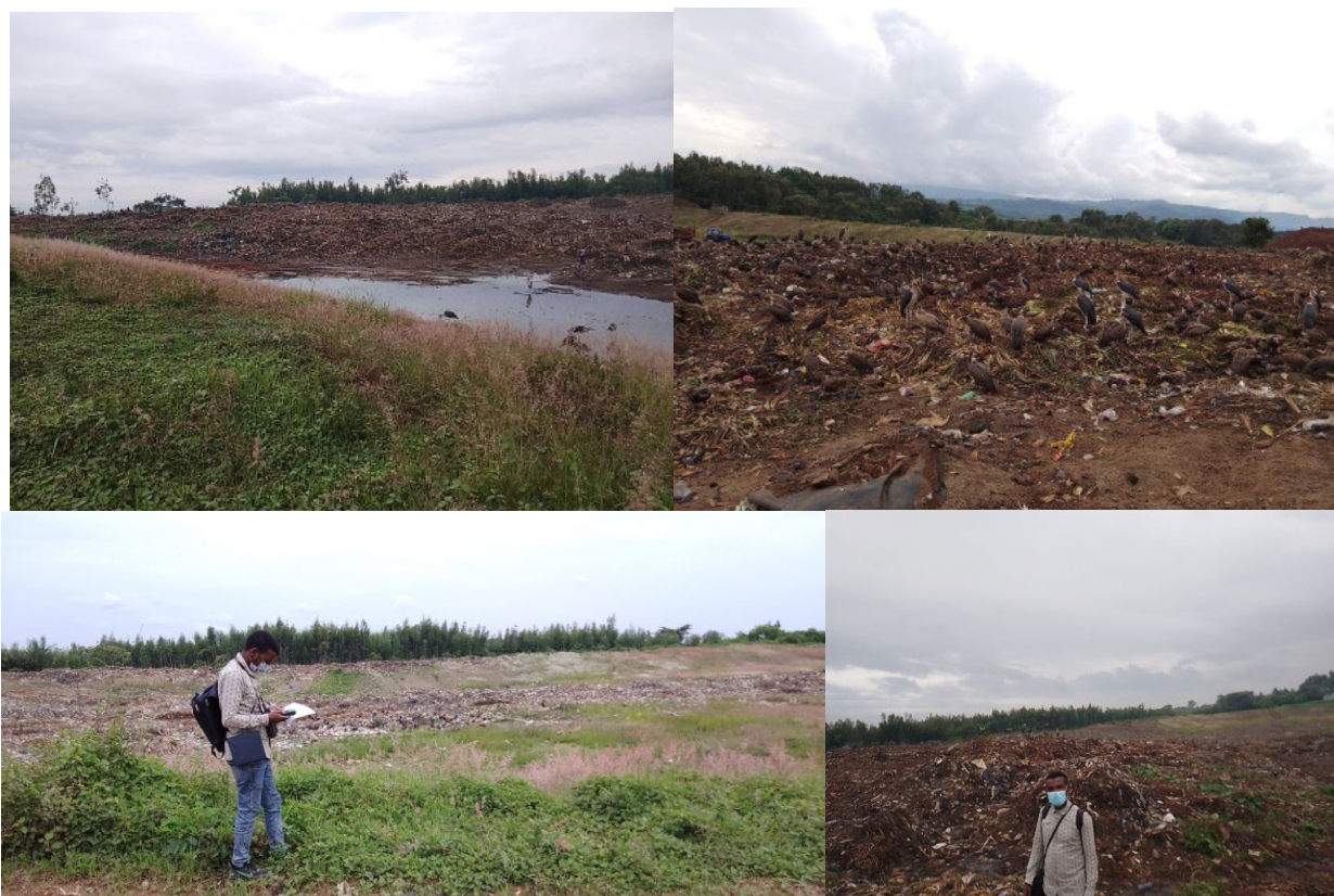
Fig 2: Landfill, different vultures and observation for count data at dumpsite in Jimma (respectively)