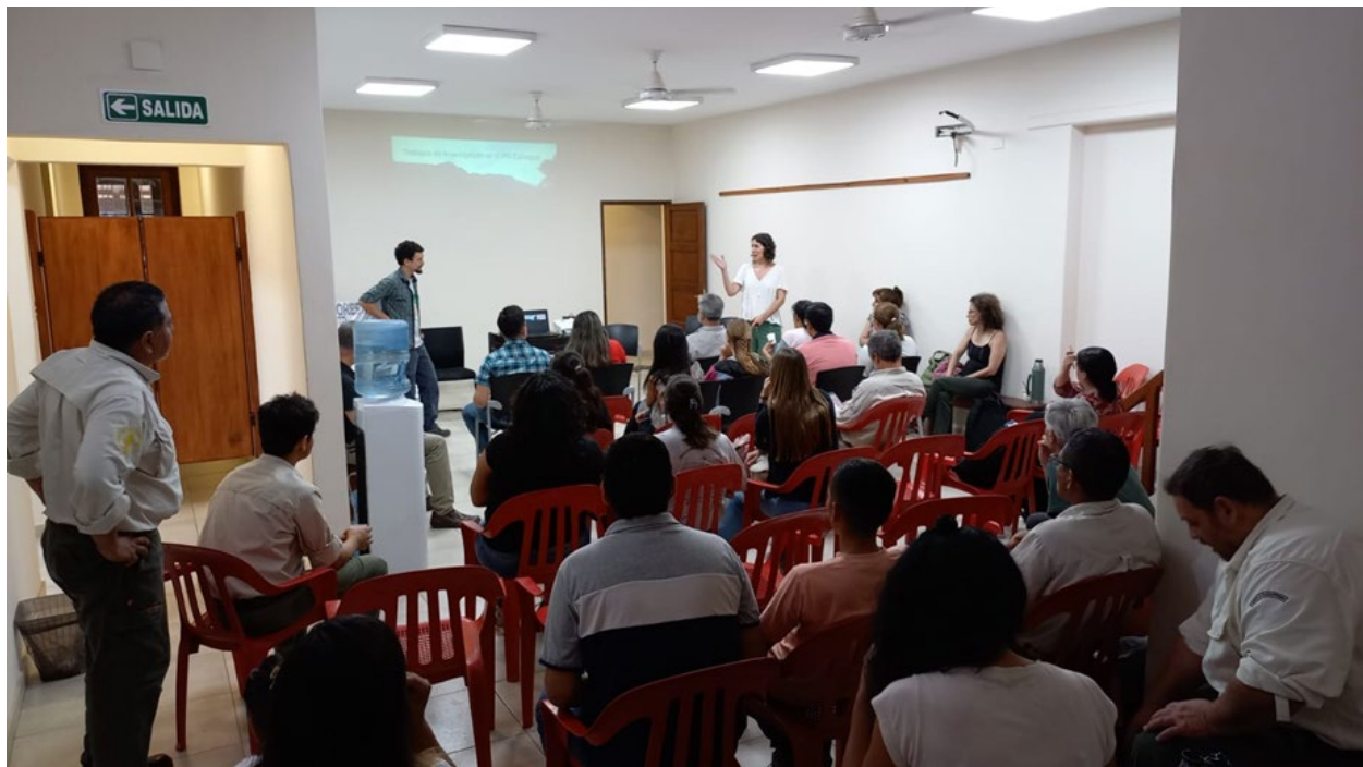
Figure 8. MB talk at ecosystem service conference at Calilegua National Park.