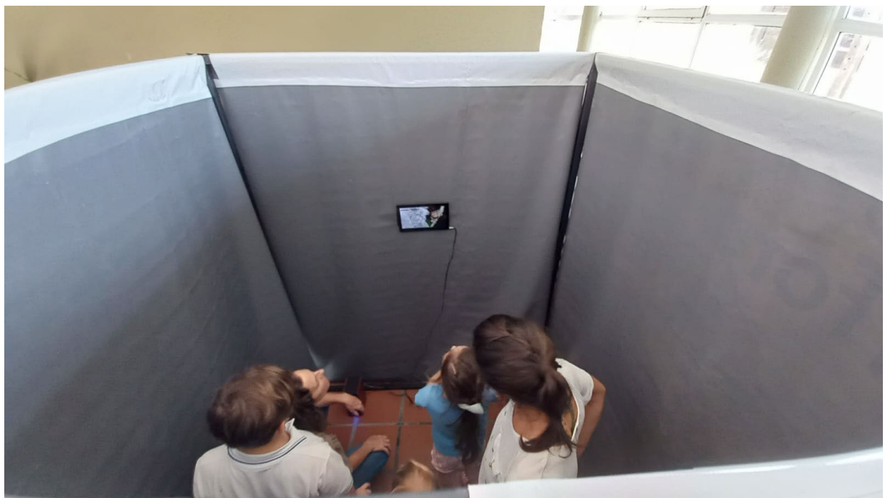
Figure 2. Inside Ecoacoustics Capsule. Children listening to video of Yungas soundscapes.