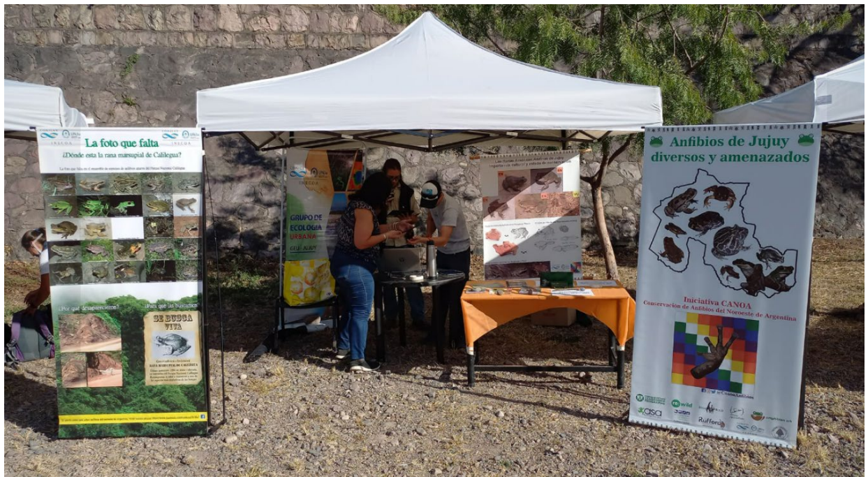
Figure 4. Environmental Day celebration at Xibi-Xibi River, San Salvador de Jujuy.