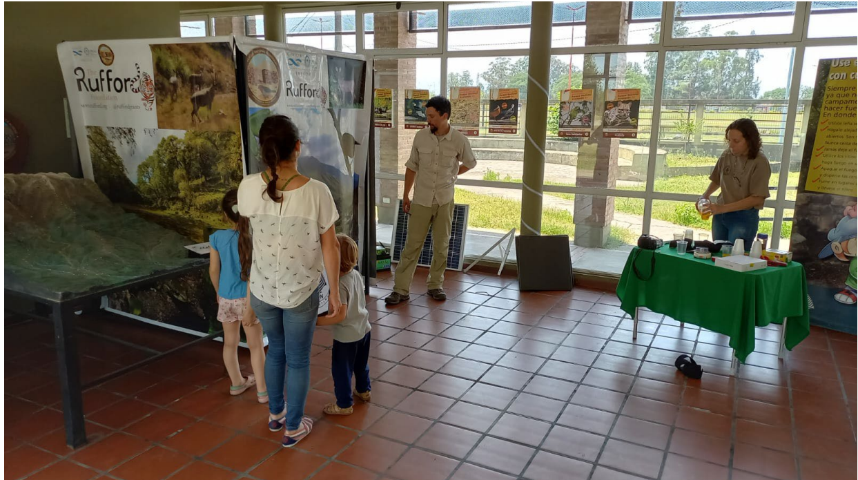
Figure 3. MB presenting the Eco acoustics capsule to children.