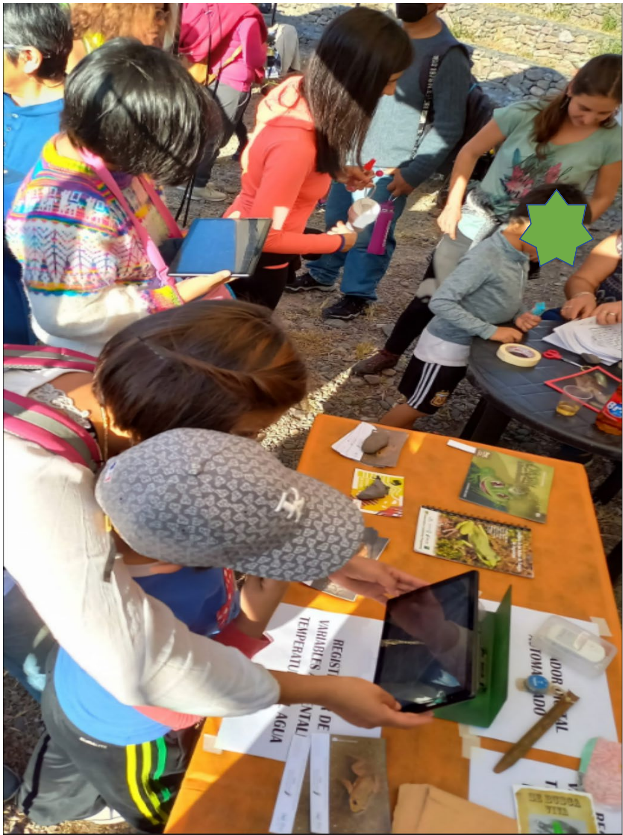
Figure 5. People listen to videos about Yungas's soundscapes.