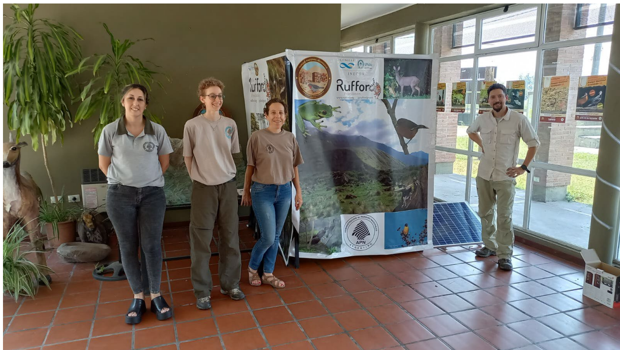
Figure 1. Eco acoustic Capsule Installed in Aconquija NP administration office. Aconquija staff members and MB.