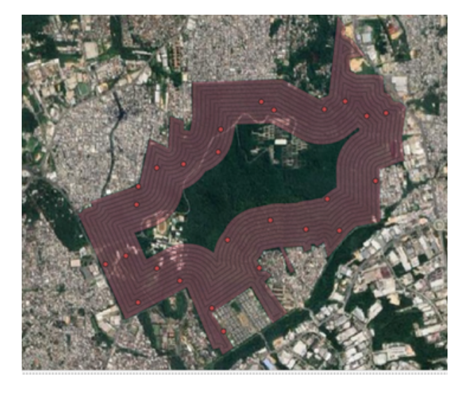
Fig 4. New selected points to install the autonomous recorders and conduct propagation experiments at the UFAM forest fragment, Manaus. The lines represent inner buffers of 50 m.

The recorders were installed in trees at 5 m (Fig 6), to avoid thievery and because pied tamarins are arboreal. Even though, two of the two of the recorders were stolen. The recorders were collected at the end of March, and data is still to be uploaded at Arbimon Platform.