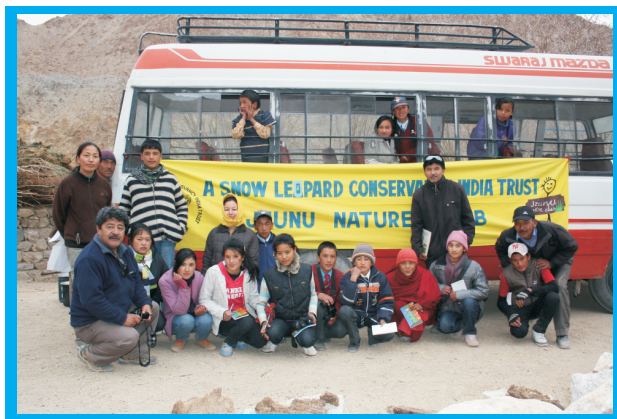
Jzunu Nature Club's first members at its first meet

Wishing Readers, Partners, and Friends of Snow Leopard Conservancy India Trust a Very Happy New Year. We hope you have year filled with peace and happiness.