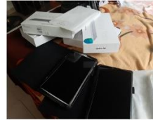
Tablets used for collecting social survey data