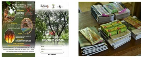
Souvenirs for Conservation club members