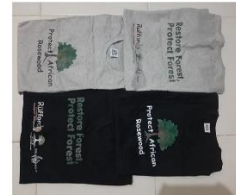
Samples of branded T-shirts