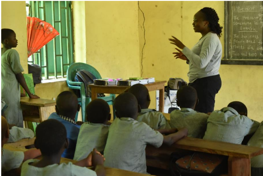
Facilitation during club activity