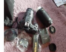
Camera used for taking photos