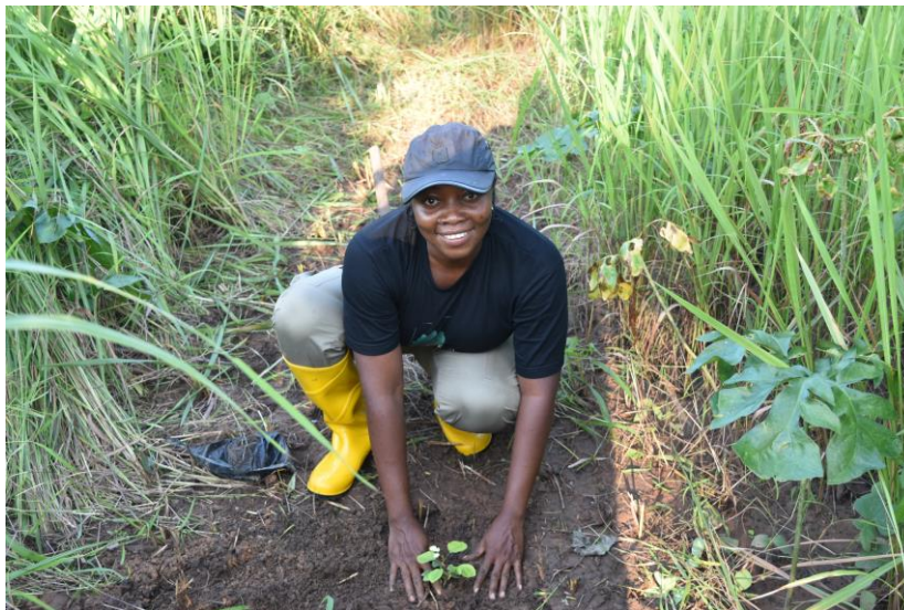
Planting of African Rosewood in degraded Akwete Forest.